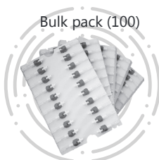
Bulk pack (100)

Questions? 1300 138 247 or contact@allflex.com.au