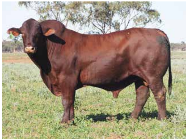
Diamond H Striker S151 (P)