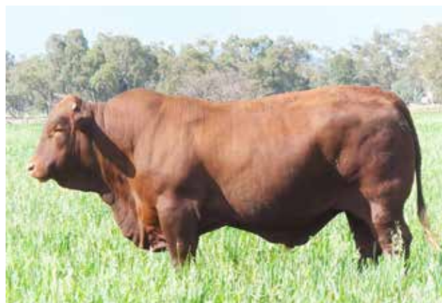
Rockingham Quambone Q126 (PS) – Lot 7