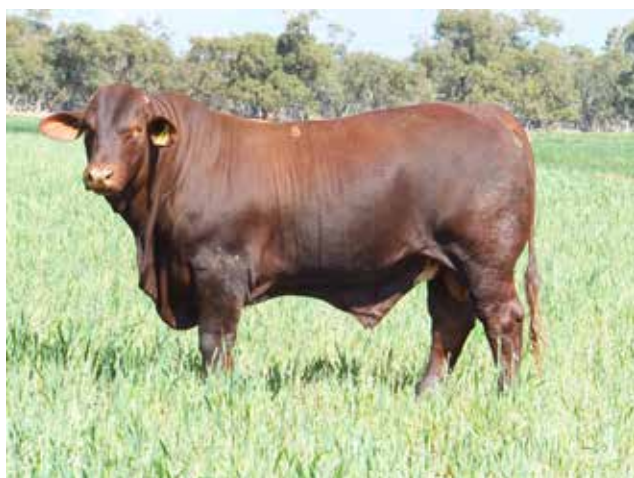
Rockingham Quarantine Q90 (PS) – Lot 3