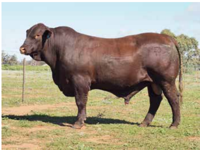
Rockingham Powerhouse (P) 2020 Sale record $70,000