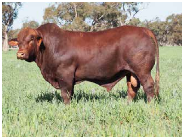
Rockingham Quartz Q8 (P) – Lot 11