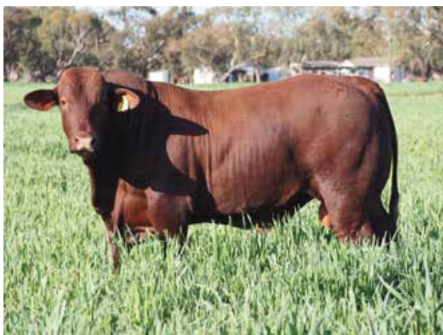
Rockingham Quip Q150 – Lot 31