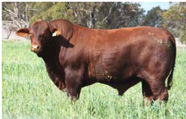
Rockingham Quadtrack Q164 (P) – Lot 8