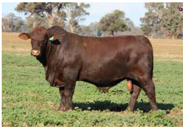
Denngal Quartet Q65 (P) – Lot 23