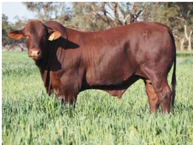
Rockingham Quake Q168 (P) – Lot 1