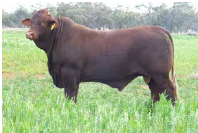
Rockingham Quatro Q114 – Lot 29