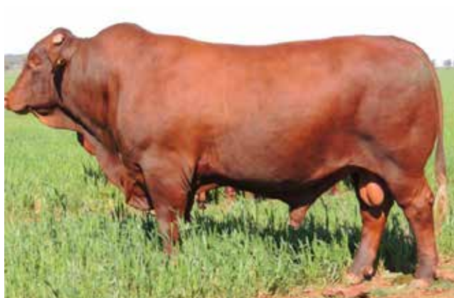
Rockingham James Bond J106