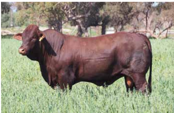
Offering 2021 Full brother Rockingham Qantas Q152 - Lot 2