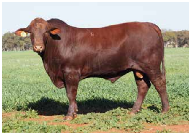
Rockingham Quicksilver Q54 (P) – Lot 5