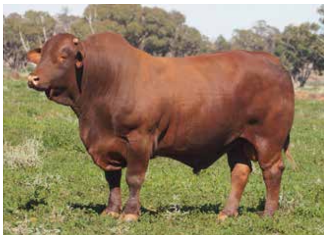
Rockingham Joker J100 (PS)