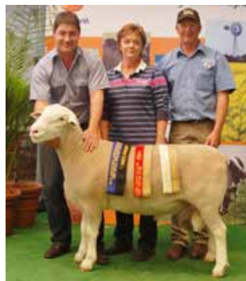
Bundara Downs 133546