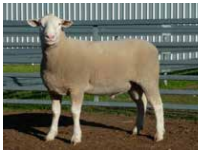
Bundara Downs 122261