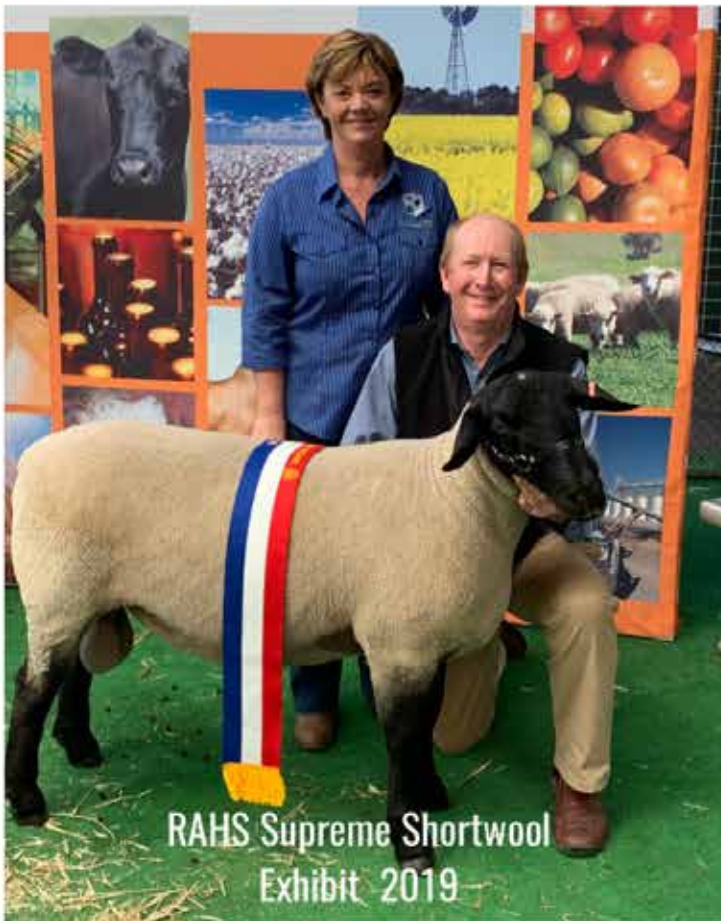
RAHS Supreme Shortwool Exhibit 2019