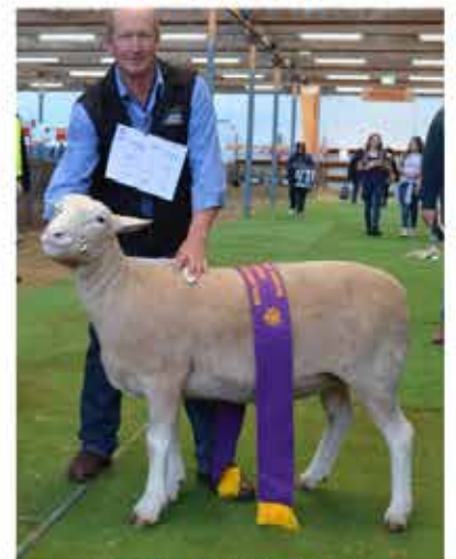
Reserve a Champion Ewe 2016