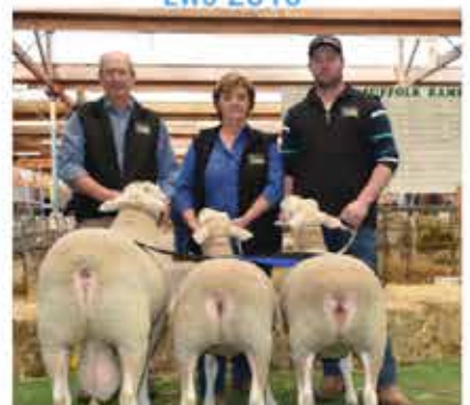
2019 Maternal Terminal