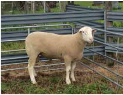
Ramsay Park 188200