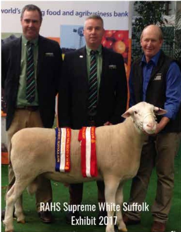
RAHS Supreme White Suffolk Exhibit 2017