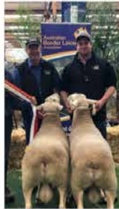
Hamilton Interbreed Lambplan 2014