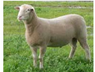
Ramsay Park 130201