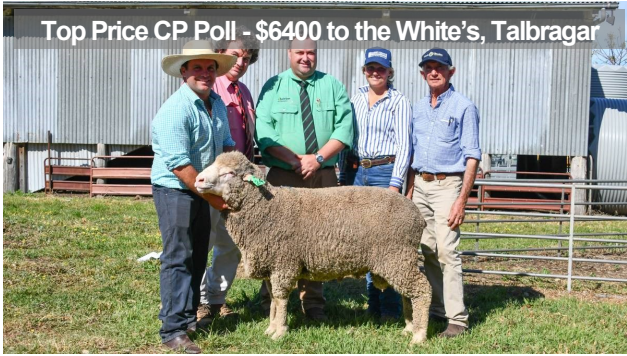
Top Price CP Poll - $6400 to the White's, Talbragar