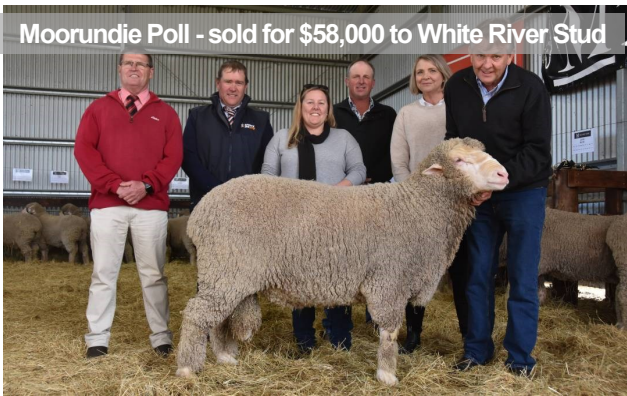
Moorundie Poll - sold for $58,000 to White River Stud

Our 2020 Ram Sale was a great success, selling 79 rams including an extra 20 that were added at the eleventh hour. We would like to thank everyone who supported us at the ram sale, and throughout the year. Special mention to two long time clients (50 years plus), the Gallagher & White families who purchased the top priced horned and poll rams respectively. The CP Poll rams averaged $2406 and the horns $2114.