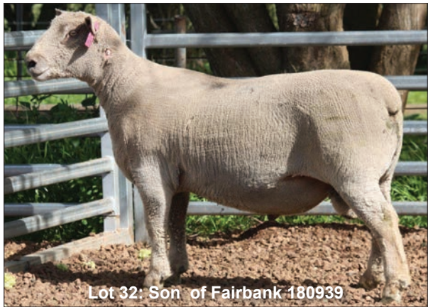
Lot 32: Son of Fairbank 180939