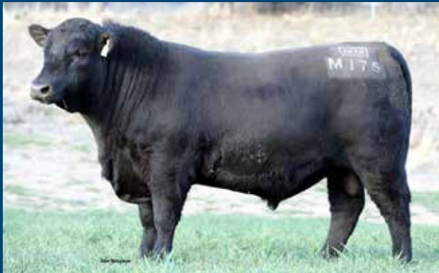
Millah Murrah Klooney K42