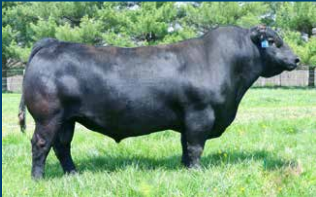
LD Capitalist 316