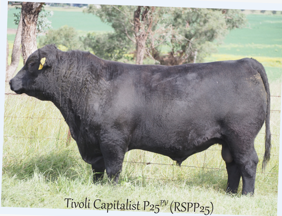
Tivoli Capitalist P 25 PV (RSPP 25 )