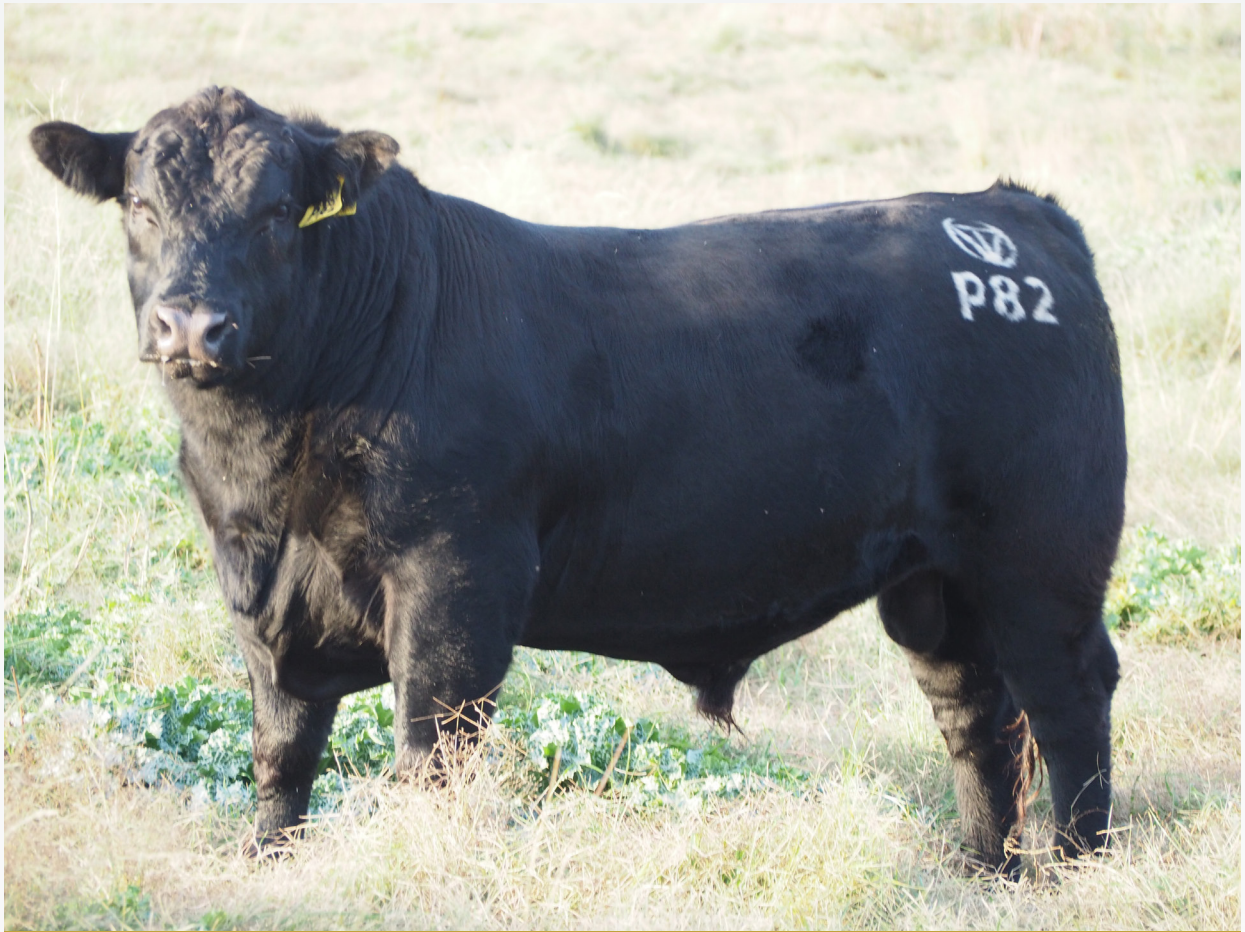
Lot 11 - Tivoli Lincoln P82# (RSPP82)