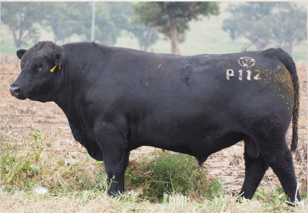
Lot 7 - Tivoli Capitalist P112 SV (RSPP112)