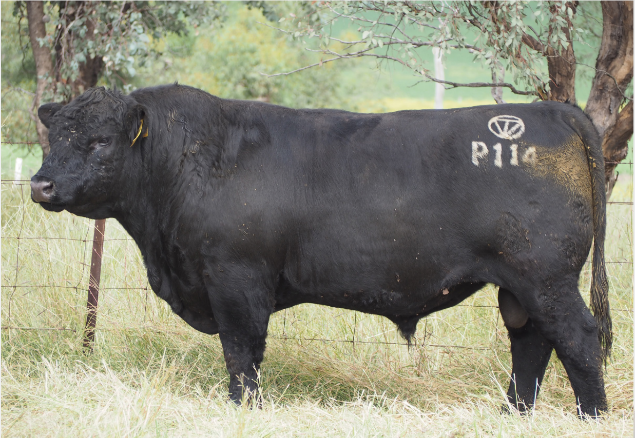
Lot 3 - Tivoli Loch Up P114# (RSPP114)