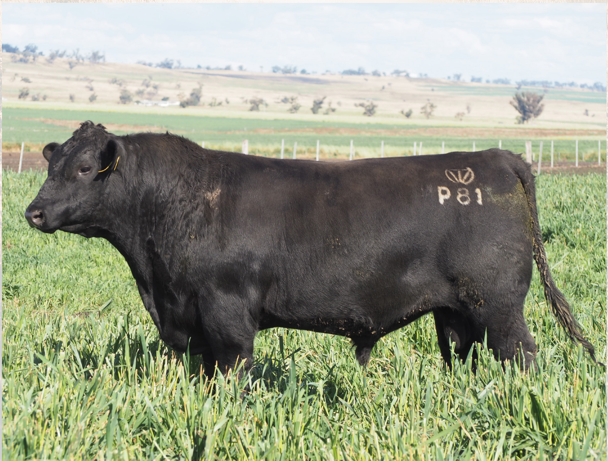
Lot 22 - Tivoli Loch Up P81# (RSPP81)