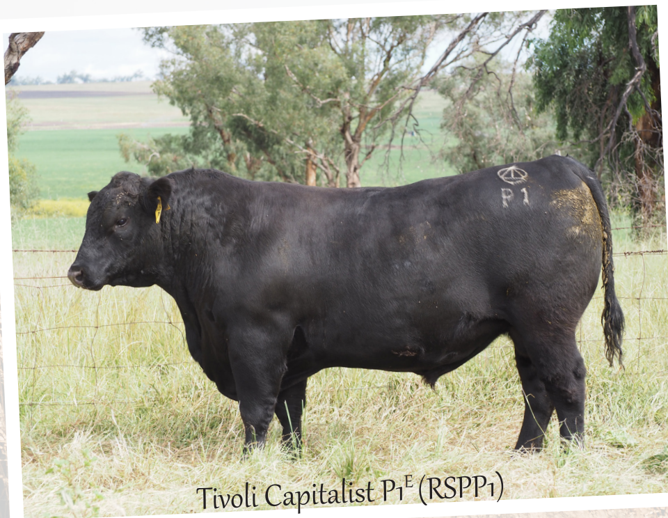
Tivoli Capitalist P 1 E (RSPP 1 )