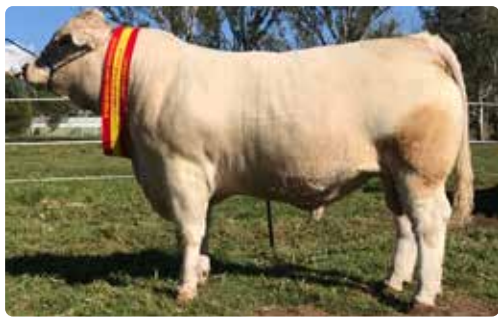
CALOONA PARK LEROY (ET) (P/S) LSFL40E (S)