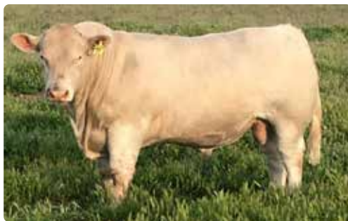
TEMANA K66E (P) TJK66E (P)