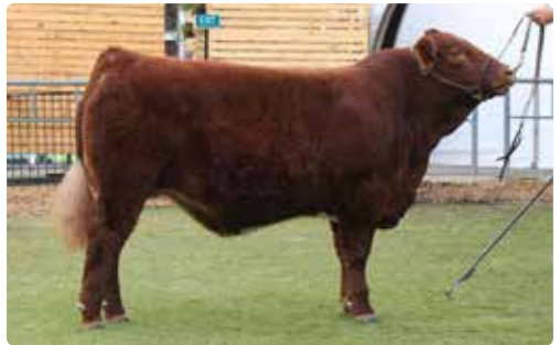
2019 SYDNEY ROYAL 1 ST PLACE HEAVYWEIGHT & SILVER MEDALIST