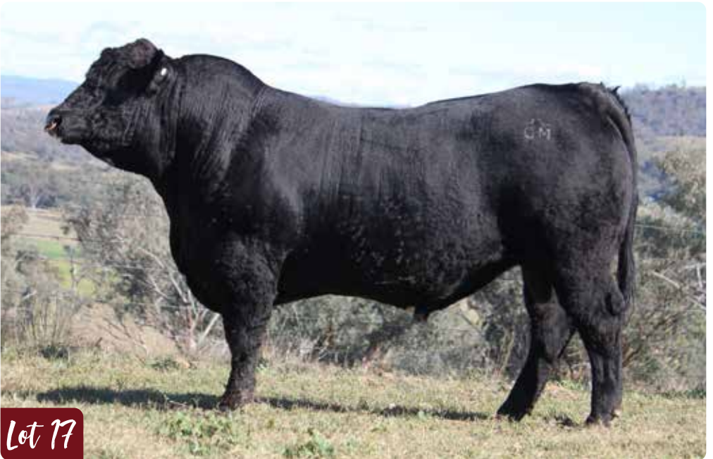
CALOONA PARK PIRATE (P) (R/F)