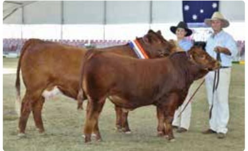
MD ROSANNE H565 & MD AMIGO K649