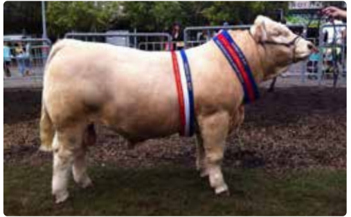
2014 SYDNEY ROYAL CALOONA PARK HERO