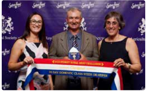
2019 RAS BEEF CHALLENGE