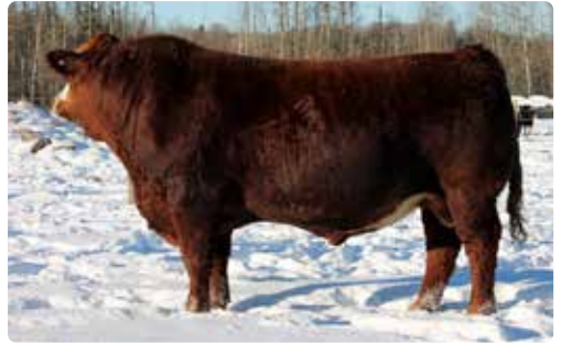
KOP SPARTAN 113A