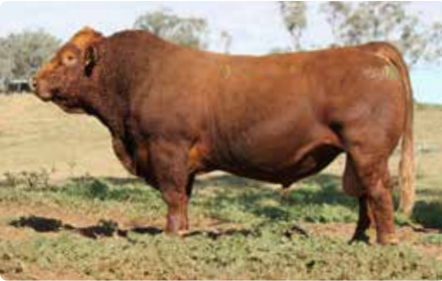
MALA-DAKI RED AMIGO K649 (PP) (AI)