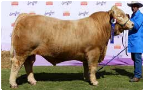
CALOONA PARK LITTLE HERO