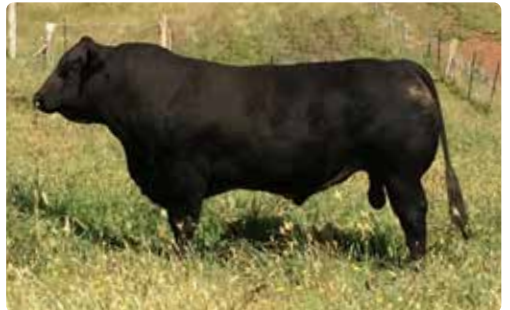
MALA-DAKI MICK H574 (PP) (B)