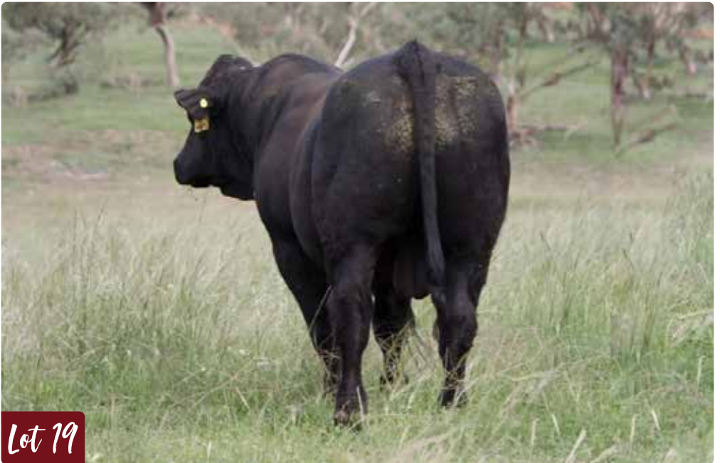
CALOONA PARK PROUD (P) (R/F)