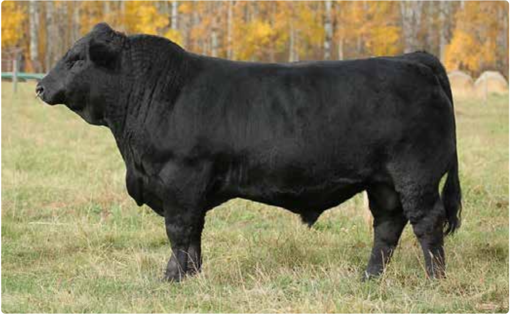
RJY SHOCK N AWE 5W (P) (B) (AI)