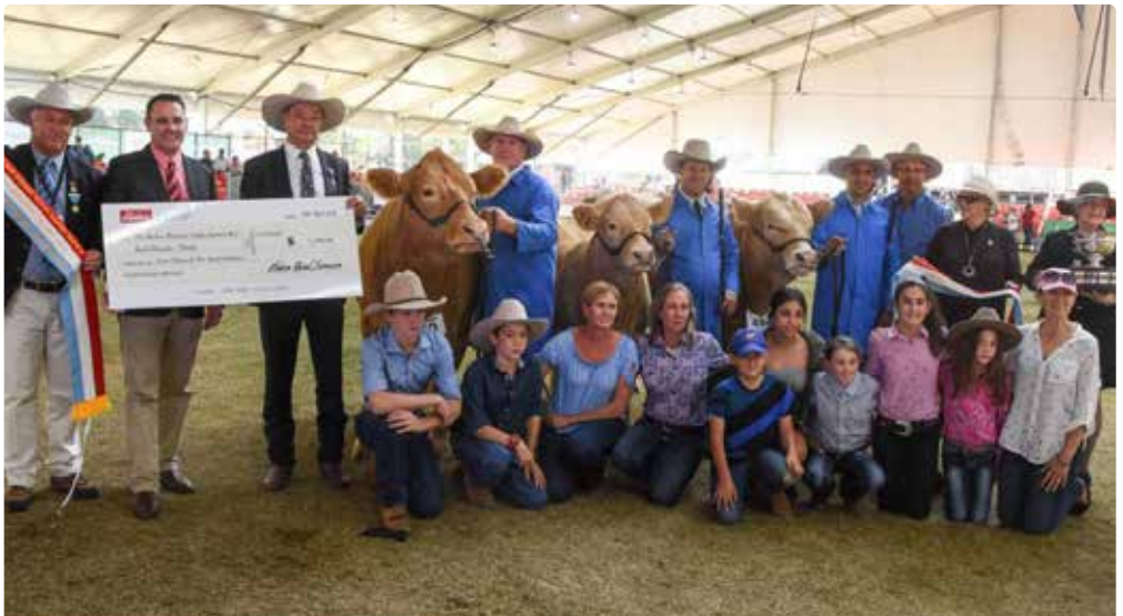
2019 SYDNEY ROYAL - THE HORDERN PERPETUAL TROPHY