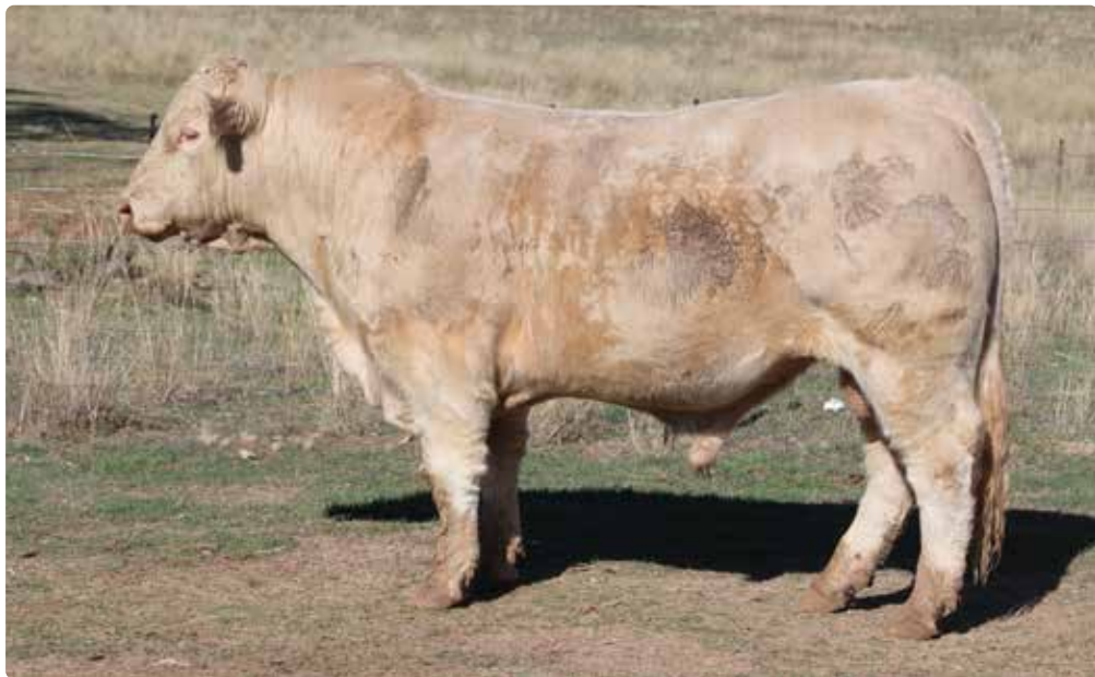
CALOONA PARK KODIAK (P) LSK123E (P)