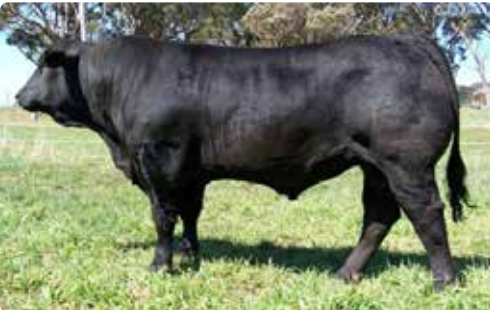
MALA-DAKI BULL DOZER E421 (P) (B) (AI)