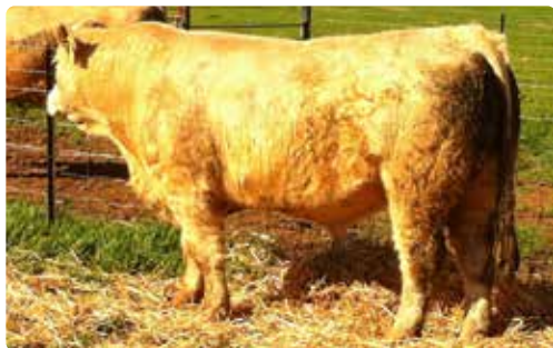
AIRLIE KIT K127E (AI) (P) A1SK127E (P)