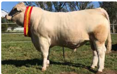
CALOONA PARK LEROY (ET) (P/S) LSFL40E (S)