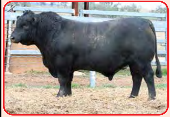
Mid July 2020 TransTasman Angus Cattle Evaluation

Comments: Another outcross pedigree with this lot seeing new dam and sire lines introduced to DSK in 2017. This is the first year we see the Gridlock sons offered and we are very happy with our breeding choices. The Bonnie females are looking highly maternal as they are getting close to calving. A great deal of sire strength here with great head, bone and outlook on a very well balanced and correct frame.