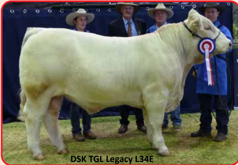
DSK TGL Legacy L34E

Junior & Grand Champion Charolais at Sydney Royal 2016, Dubbo Charolais National show 2016, & Brisbane Royal 2016 as well as being part of the Interbreed Champion pair.