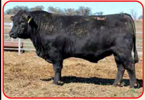
Mid July 2020 TransTasman Angus Cattle Evaluation

Comments: Another good all rounder Big Tex son on good bone and balanced frame with a thick top on wide rib and hindquarter. Stands square and balanced with good extension throughout. Very soundly made out of one of our easiest keeping females that goes back to the great Sitz Upward on her sires side. His daughters will make very easy to maintain and productive matrons and his sons will suit many markets.