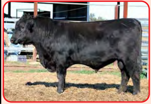
Mid July 2020 TransTasman Angus Cattle Evaluation

Comments: A larger framed bull with loads of neck extension and smoothness. Nice muscle pattern with good weight. Soft and well balanced and great legs and feet with good scrotal. Great for those looking to increase frame in their females but keep good muscle content and capacity as well. Good skin, hair and temperament.