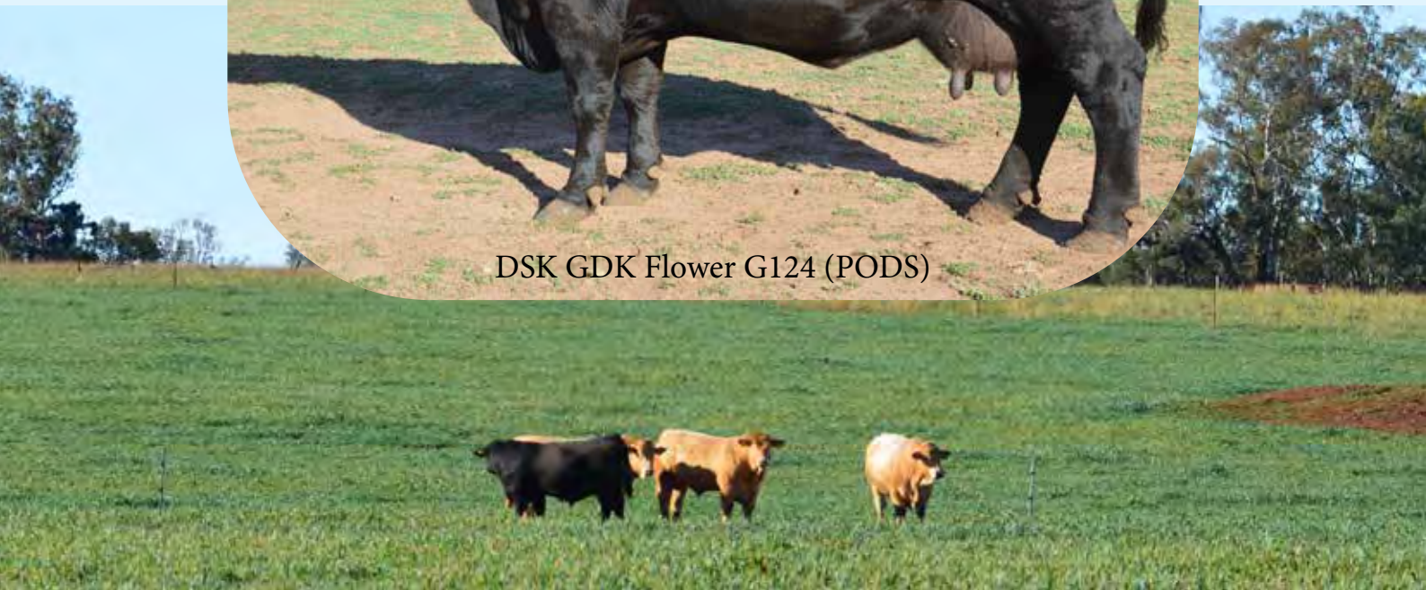
DSK GDK Flower G124 (PODS)