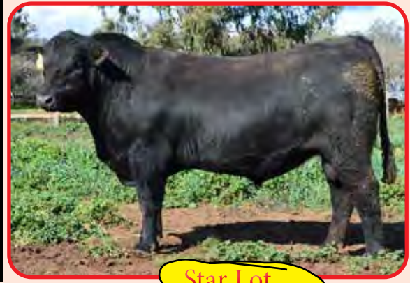
Mid July 2020 TransTasman Angus Cattle Evaluation

Comments: A bull we have a lot of time for. Long as a coal train but width and strength of muscle and frame as well. Beautiful hid and soft. Extension and smoothness to boot and all that length adds up to a good, strong heavy bull that is sound and easy to keep. Smoothly made shoulder and strong maternal family lines will make for a consistent and easy calving experience. Another sire that will produce great feeder steers and replacement females. His dam will join our donor program after she calves down this spring.