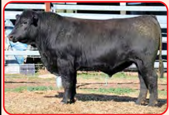
Mid July 2020 TransTasman Angus Cattle Evaluation

Comments: A very nicely made and well balanced son of L612(Big Tex) out of another one of our good old Rachis females. Smooth and soft on a very correctly made frame. Silky hair and soft hide. Strong maternal lines. Very good bull for those that sell into the domestic trade and for retaining highly productive and easy maintenance females.