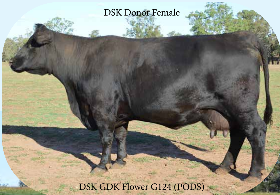
DSK Donor Female

We reduced breeding numbers by 30% and to recover feeding costs, stud Angus females were sold to Flemington, JSR and Mystic Angus studs and we wish them well with their purchases and future programs.