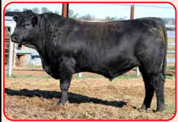
Mid July 2020 TransTasman Angus Cattle Evaluation

Comments: The last of our Rachis sons this year and out of our highly productive and maternal Anita X Hi Road cow line. Shows the softness and balance of the Rachis progeny with plenty of muscle on a very sound base. A bull for all markets and great for replacement females. Dam is a sister to the dam of Lot 7.