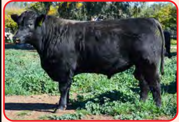
Mid July 2020 TransTasman Angus Cattle Evaluation

Comments: Length and scale in this son of a very proven sire and good safe and consistent cow line. The Sitz Upward sire appears in the pedigree of a very large percentage of proven and successful Angus sires world wide. We have used Upward at DSK for many years and his progeny are always well made with good muscling.