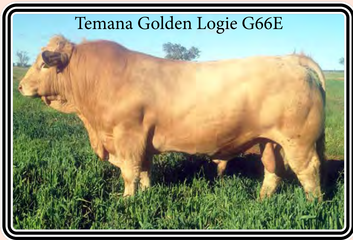
Temana Golden Logie G66E

An exceptional sire of quality Charolais progeny with a show winning record that is unequalled in Australia. Siring many champions at Royal & National shows with both males and females. Outstanding sons in this year's sale with at least 4 stud sire prospects among them.