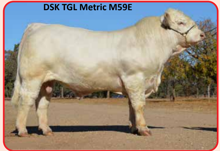
DSK TGL Metric M59E

DSK TGL Wendy K50E sired by Logie. Junior Champion female at the 2016 Charolais National show.