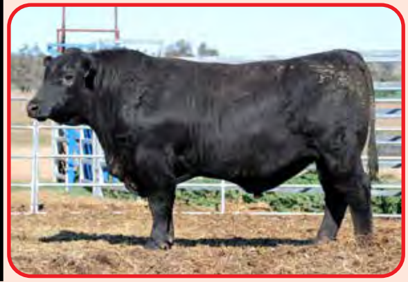
Mid July 2020 TransTasman Angus Cattle Evaluation

Comments: A good smoothly made, well balanced son of L612 out of a full Canadian dam again who is a young cow with a great breeding record already. The dams side is very easy calving and well made and that shows in this young bull. Should be easy calving and make great replacement females.