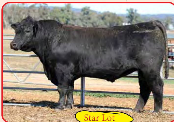
Mid July 2020 TransTasman Angus Cattle Evaluation

Comments: Stud Sire Potential. Pedigree sibling to previous lot. Very long with a top line you could use as a straight edge. Deep sided with a strong sire presence. Powerful performance and strong muscle in a smooth made structure with great skin and hair type. Very good scrotal with a tight sheath. Another bull built for calving ease and making great productive daughters. A complete package.