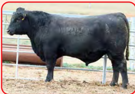
An easy calving maternal pedigree and is long and smoothly made himself.

Comments: This young sire has it all. The second youngest bull in the sale draft. Great temperament, structurally sound and strong boned with large scrotal and great muscle content. He is not to be missed if you want the best cows you can make. His mother is the best cow we have ever bred and she is still going strong today. G124 has sold sons to $12,000 in previous sales. P162 has loads of softness with a high yielding carcass and huge capacity.