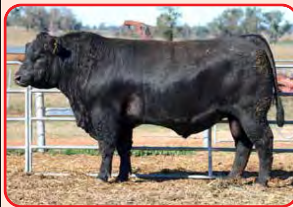
Mid July 2020 TransTasman Angus Cattle Evaluation

Comments: Comments here will get very repetitive with these L612(Big Tex) sons out of our good Rachis daughters. This cross worked very well for us. Yet another good young bull here, clean made, long bodied with added depth of side on a very well balanced body. He will calve easy being as smoothly made through the shoulder and neck that he is. Great skin and hair again with good scrotal and easy keeping with loads of carcass. A really good all purpose beef bull out of a great female.