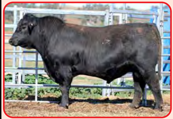
Mid July 2020 TransTasman Angus Cattle Evaluation

A moderate framed but very well balanced son of L612 (Big Tex) that is hard to fault with his strong and correct structure and smooth muscle pattern. He stands on good bone with a strong wide hip and base. Another soft skinned and hidid bull with a strong maternal pedigree.