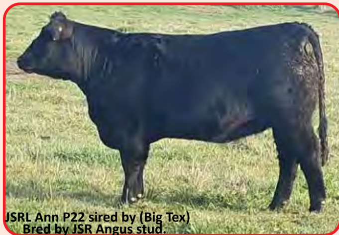
JSRL Ann P22 sired by (Big Tex) Bred by JSR Angus stud.