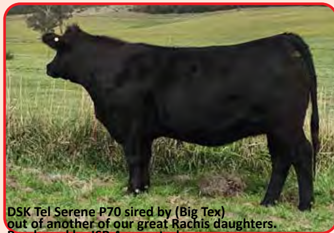
DSK Tel Serene P70 sired by (Big Tex) out of another of our great Rachis daughters. Purchased by JSR Angus stud.