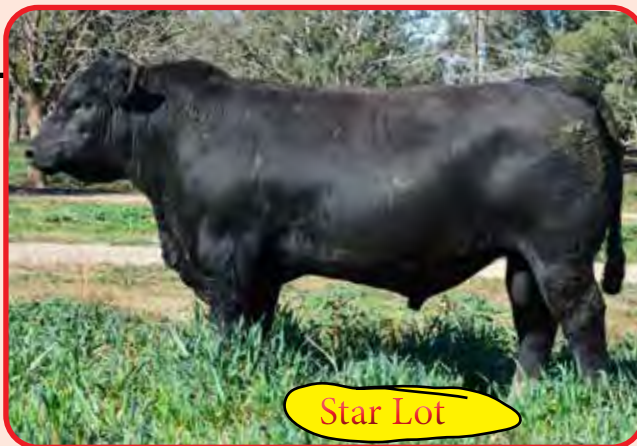
Mid July 2020 TransTasman Angus Cattle Evaluation

Comments: Another son of L612 (Big Tex) with great sire appeal. Strength from tip to toe. Good head, beautiful extension and length of body with tremendous spring of rib and big topped with a deep square hindquarter. Correctly made with great skin and hair. Once again from one of our tremendously successful matron lines in our all Canadian Lady Heather and Remitall Rachis crosses. A very safe bet here for the producer looking to breed top quality beef and have the best replacement females he can. Built right for safe calving ease.