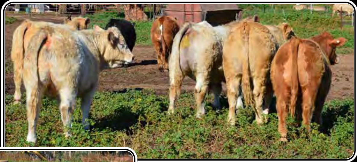
A mix of DSK home bred and Client calves