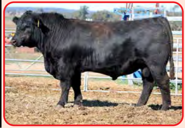
Mid July 2020 TransTasman Angus Cattle Evaluation

A Big Tex son out of another branch of our full Canadian bred females. Again showing loads of muscle expression on a correct frame with good skin and hair and easy finishing. Wide hind-quartered but smooth front end. Built right for all round production aims.