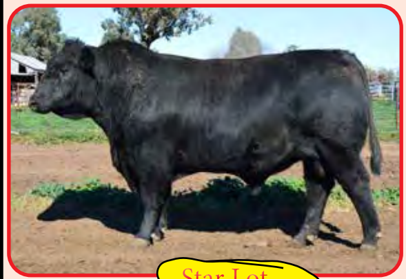
Mid July 2020 TransTasman Angus Cattle Evaluation

Comments: Full ET brother to lot 2 so another outcross son of Gridlock. Along with a tremendous amount of sire appeal, strength of spine and extension, P11 was the highest IMF% bull of the entire draft at 7.1 back in Feb this year. Soft, smooth made with good muscle on a high yielding frame. Deep, long, very sound with great rib. Impressive. Will calve easy and safely and make great replacement females as well as feeder steers.