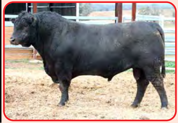
Mid July 2020 TransTasman Angus Cattle Evaluation

Comments: A complete outcross to any genetics in Australia with this fully imported bull to kick off the Angus draft. A great carcass on a very structurally correct frame. Moderate framed and was born small. Easy calving and will be suitable for well grown heifers. We are looking forward to the Bonnie females calving this year.