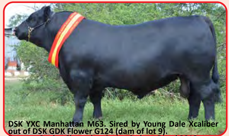
DSK YXC Manhattan M63. Sired by Young Dale Xcaliber out of DSK GDK Flower G124 (dam of lot 9). Reserve Senior Champion Angus Sydney Royal 2018.

Mid July 2020 TransTasman Angus Cattle Evaluation