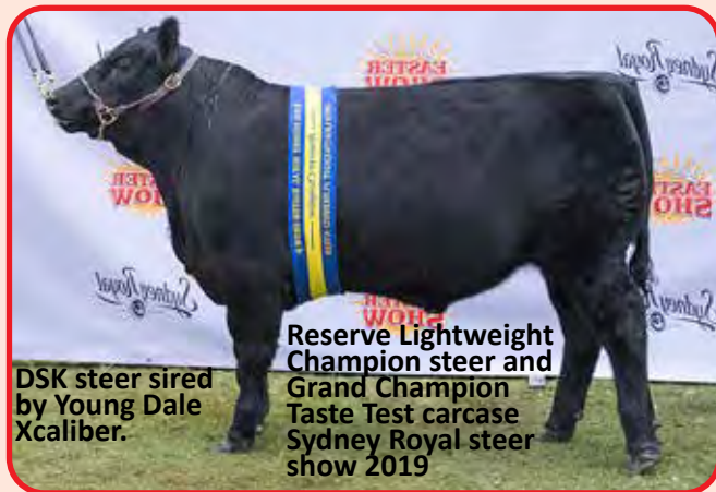
DSK steer sired by Young Dale Xcaliber.