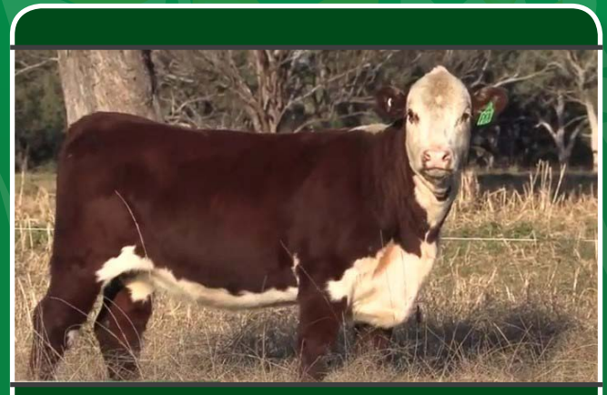
Lot 44 TYCOLAH BONNIE MIXER P174