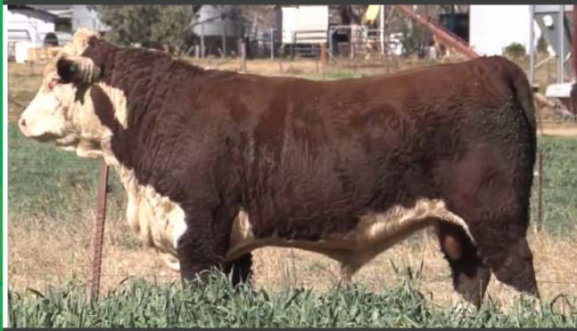
Lot 14 TYCOLAH RAPID FIRE P084