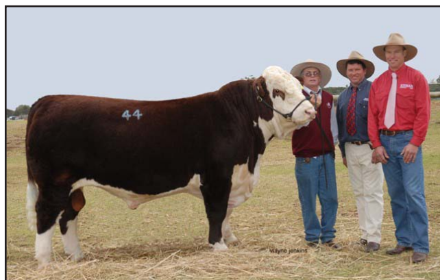
Sire of Lot 41 Tycolah Gold Rush