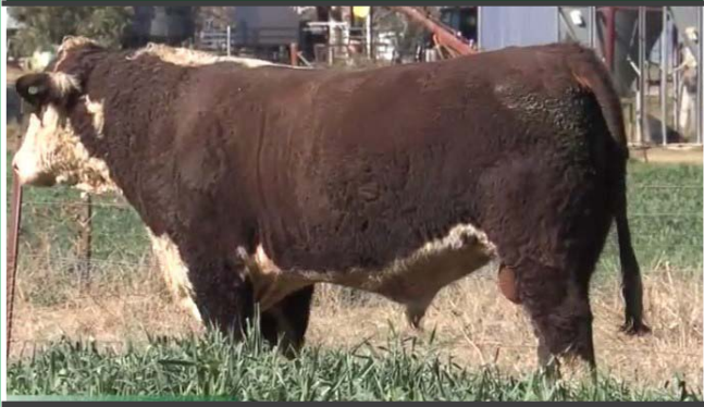
Lot 3 TYCOLAH REDWOOD P107