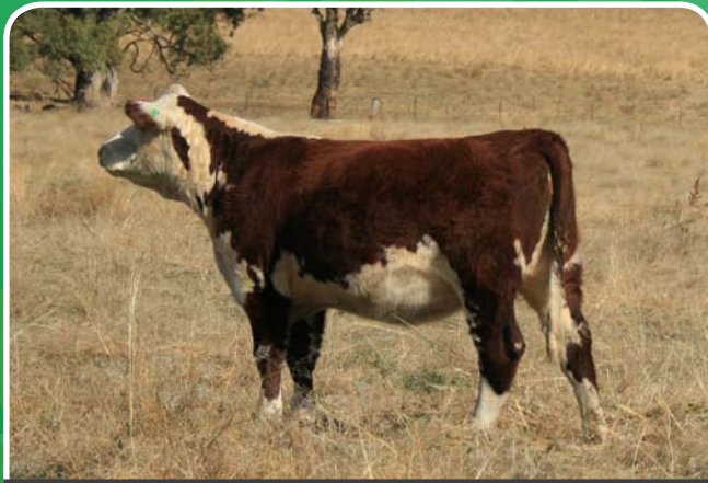
Lot 37 TYCOLAH BESS P076