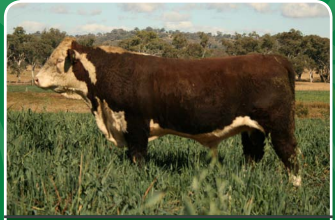
Lot 28 TYCOLAH RIVERINA P017