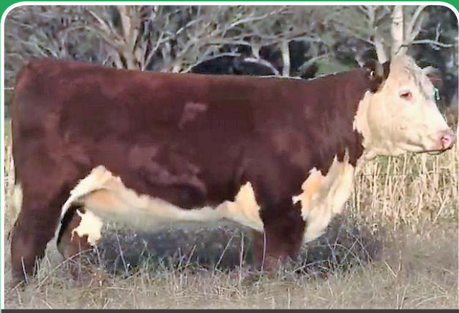
Lot 35 TYCOLAH GRACE P059