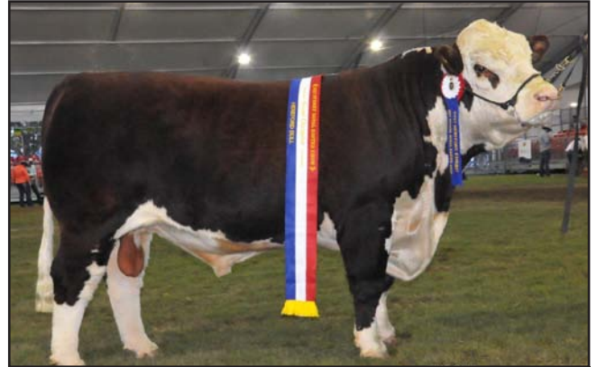
Sire of Lot 21 Tycolah Oakwood L26

VALMA PRESTIGE E60 (P) TYCOLAH LOW KEY H34 (P) TYCOLAH PERSONAL C77 (P) Dam: TYCOLAH TESSIES FAVORITE K52 (P) TYCOLAH INSTANT E46 (S) TYCOLAH TESSIES FAVORITE G90 (P) TYCOLAH TESSIE FAVOURITE Z117 (P)