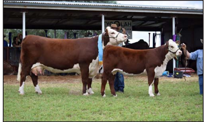
Dam Tycolah Grace K155 as calf at foot and Grand dam Tycolah Grace F148

BURANDO CLASS B044 (P) TYCOLAH GRACE F148 (P) TYCOLAH GRACE D65 (P)