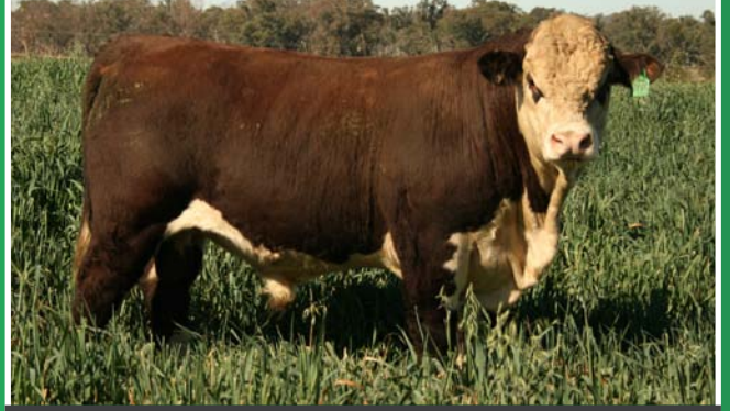
Lot 12 TYCOLAH RESURGE P065