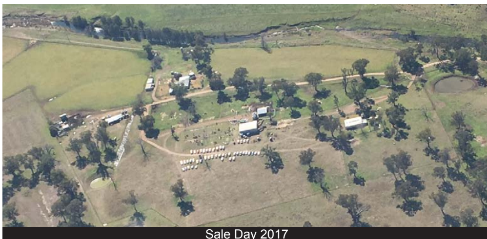
Sale Day 2017