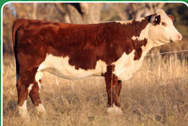
Lot 42 TYCOLAH MISS MOONBEAM P128