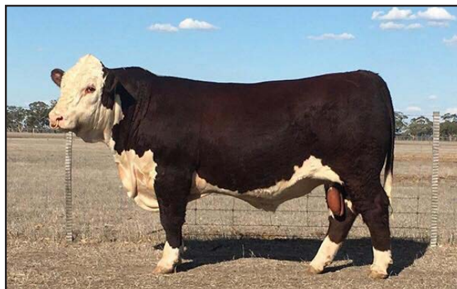
Sire of Lot 1 Allendale Bingara K184

ALLENDALE SUPERSTAR B28 (AI) (ET) (S) ALLENDALE YALLAROI 2 (AI) (TW) (PP) ALLENDALE FANCY A181 (AI) (P) Sire: ALLENDALE BINGARA K184 (P) KIDMAN COL JOY T96 (AI) (TW) (P) ALLENDALE CORA C81 (P) ALLENDALE CORA X59 (P) KARINA CHERRY Z8 (PP) TYCOLAH INSPIRE E63 (S) TYCOLAH TESSIES FAVOURITE X93 (P) Dam: TYCOLAH MISS GUNN H44 (P) TYCOLAH COBBADAH (P) KIDMAN MISS GUNN B244 (P) KIDMAN MISS GUNN Y62 (P)