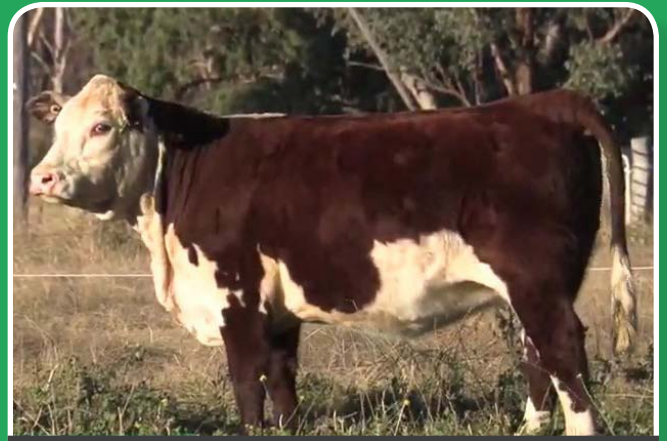
Lot 36 TYCOLAH TESSIESFAVORITE P069