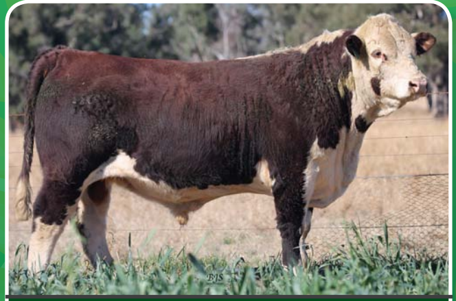
Lot 20 TYCOLAH REDBULL P151