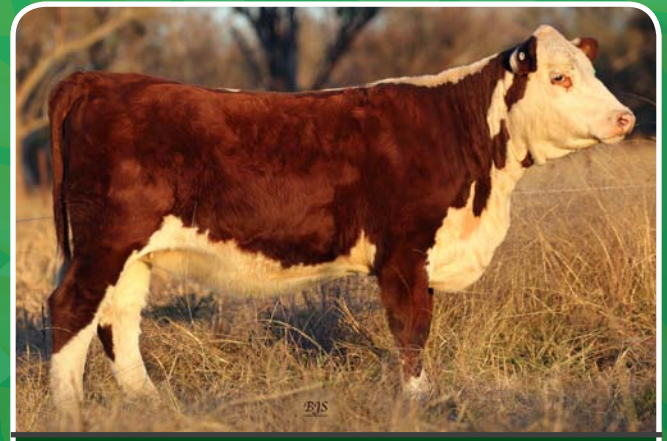
Lot 40 TYCOLAH COUNTESS P095