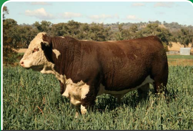
Lot 26 TYCOLAH REVEAL P168