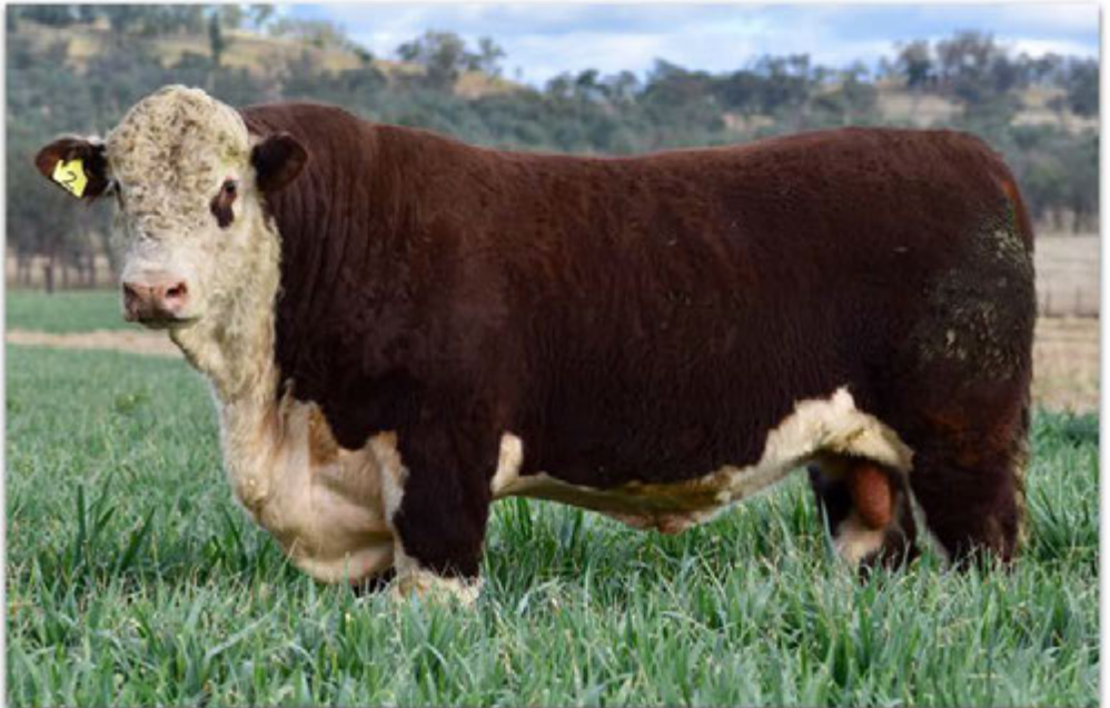
Lot 2 Mountain Valley Pedro P340 (AI) (ET) (P)