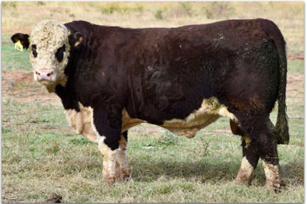
Lot 14 Mountain Valley Polar P099 (AI) (S)