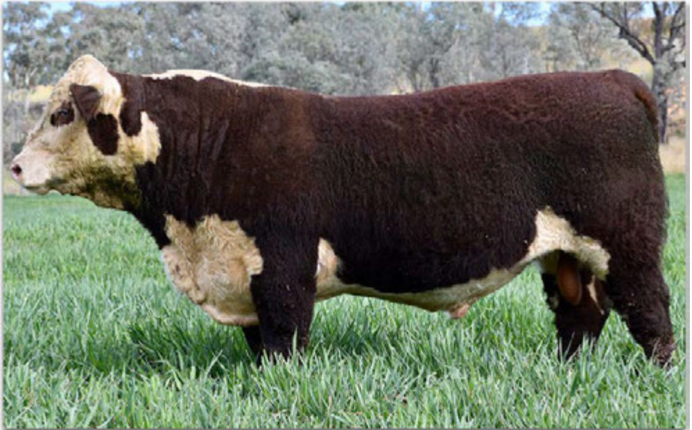
Lot 12 Mountain Valley Pistol P165 (P)