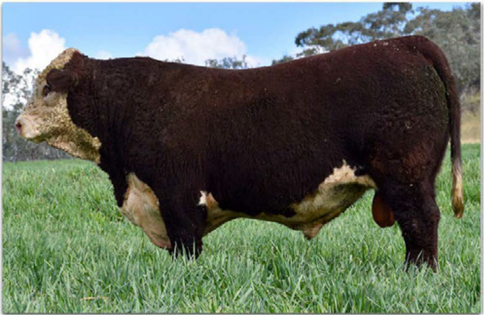
Lot 11 Mountain Valley Prospect P113 (AI) (P)