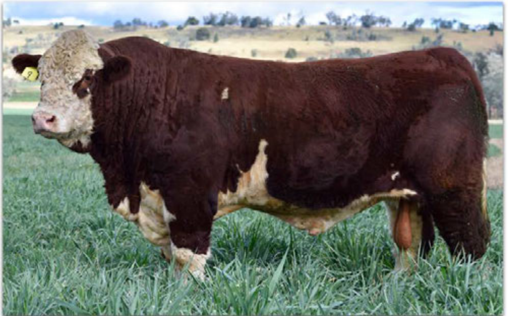
Lot 9 Mountain Valley Porter P104 (AI) (P)