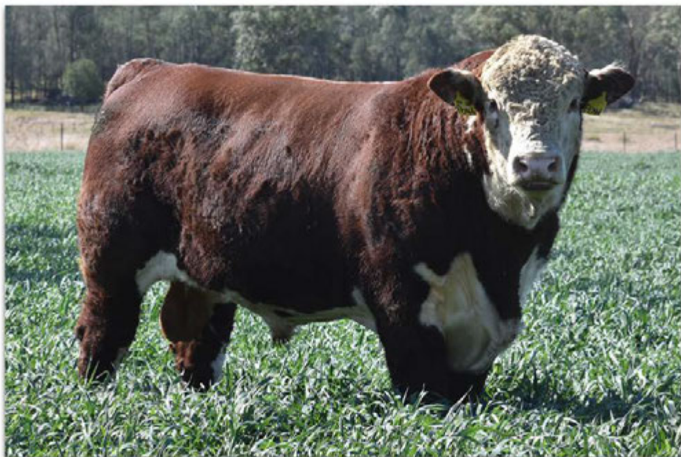
Lot 28 Mountain Valley Pindari P046 (PP)