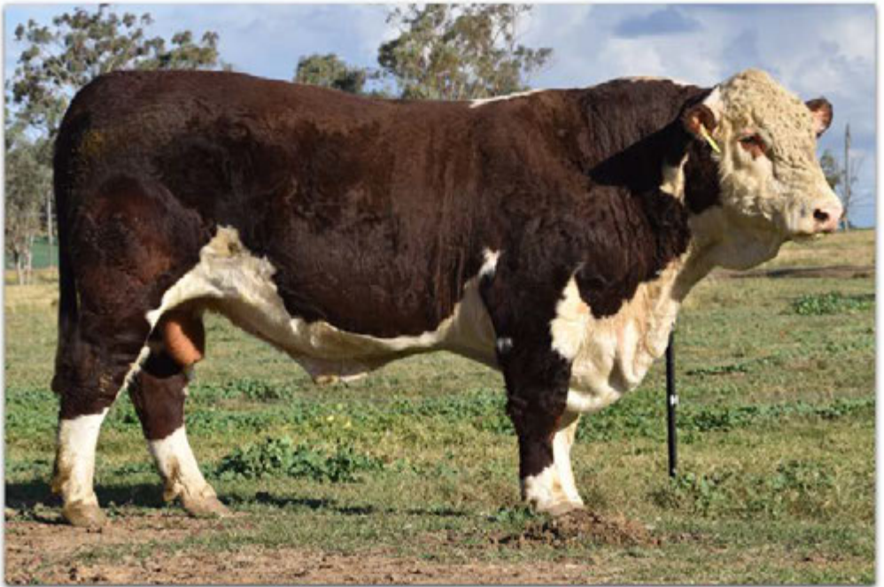
Lot 1 Mountain Valley Premium P335 (AI) (ET) (PP)