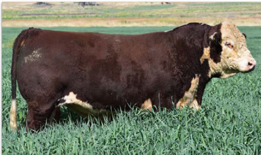
Lot 31 Mountain Valley Polar P042 (P)