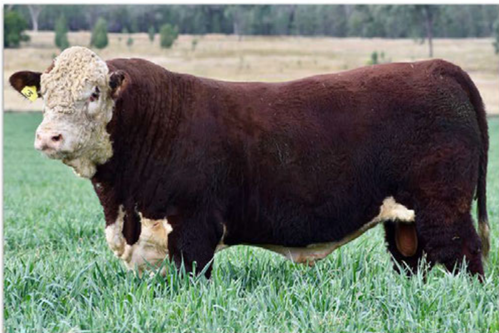
Lot 3 Mountain Valley Panama P120 (AI) (PP)