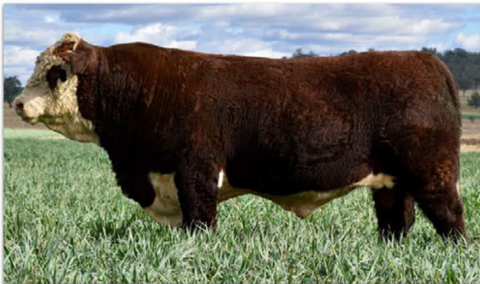
Lot 4 Mountain Valley Pogo P081 (AI) (PP)