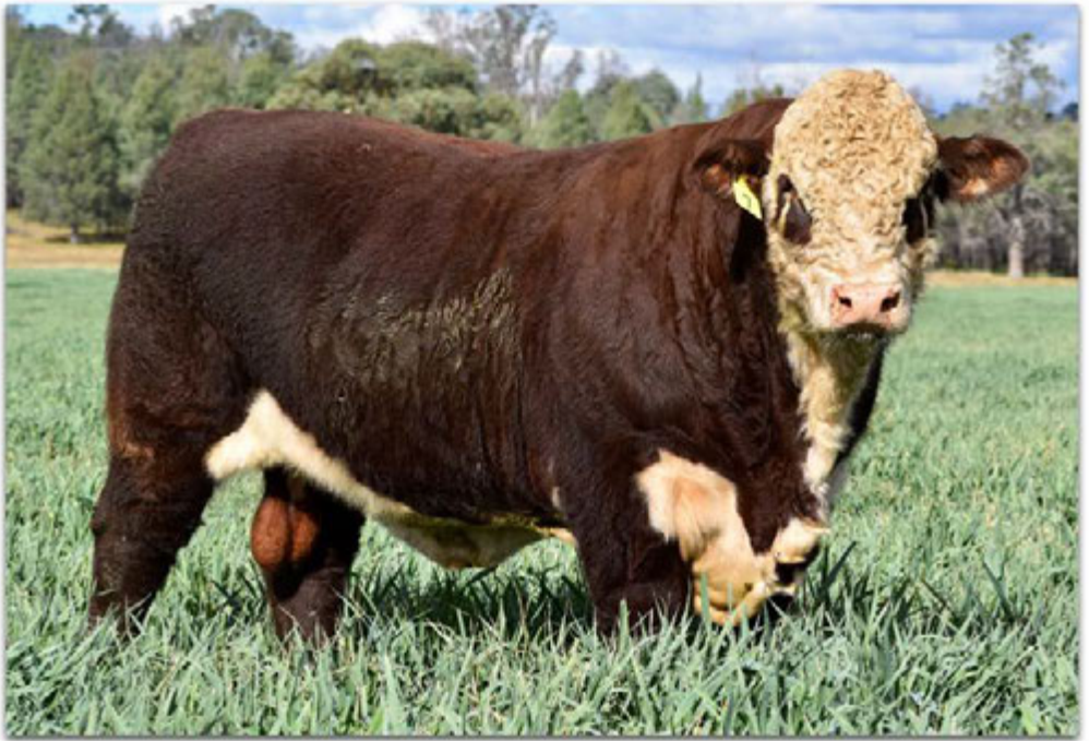
Lot 7 Mountain Valley Pindaroi P106 (AI) (P)