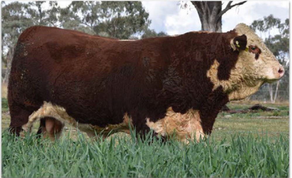
Lot 25 Mountain Valley Polo P122 (P)