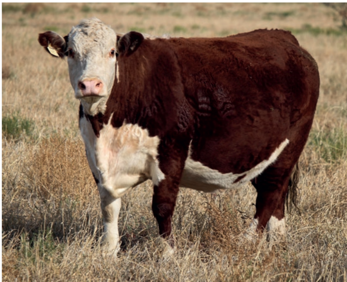
Dam of Lot 16