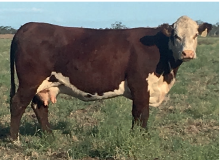
Dam of Lot 30