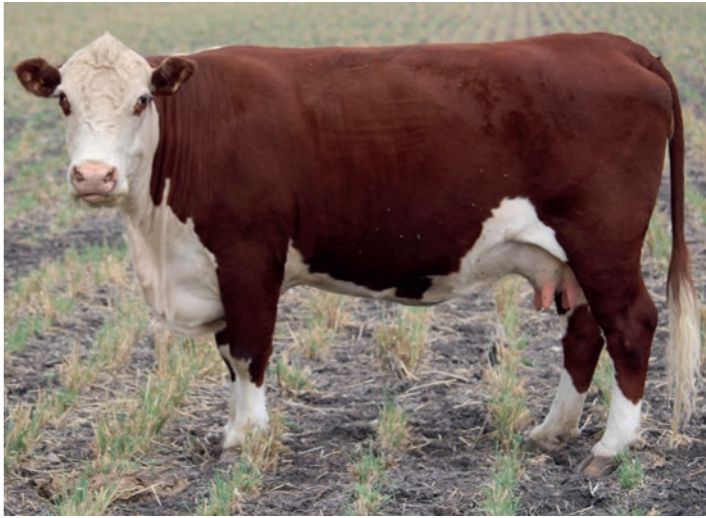
Dam of Lot 7