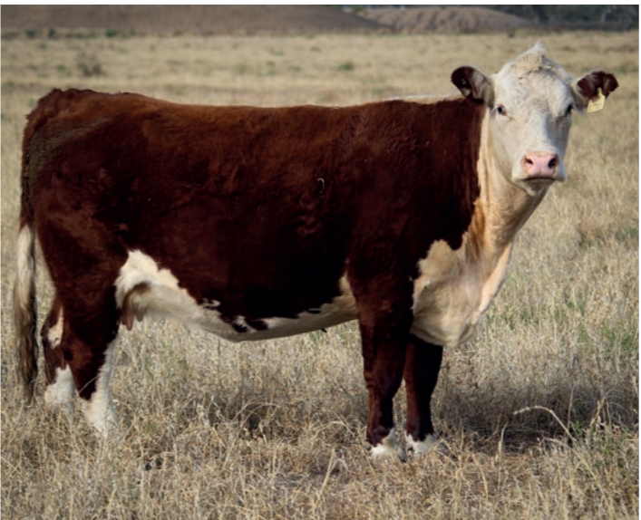
Dam of Lot 4