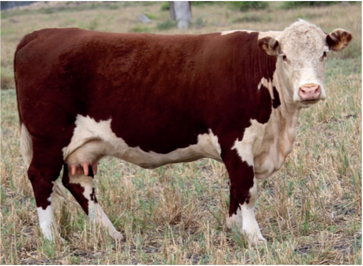
Dam of Lot 26