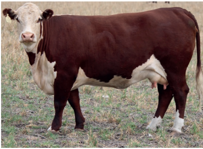
Dam of Lot 9