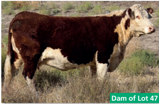
Dam of Lot 47