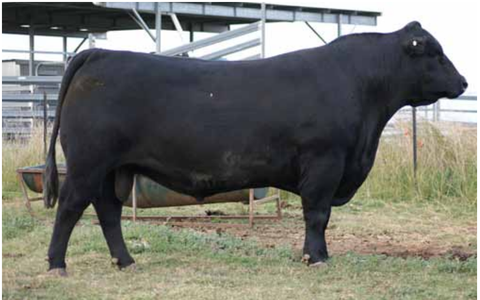
NEW SIRE KAROO K12 REALITY N278