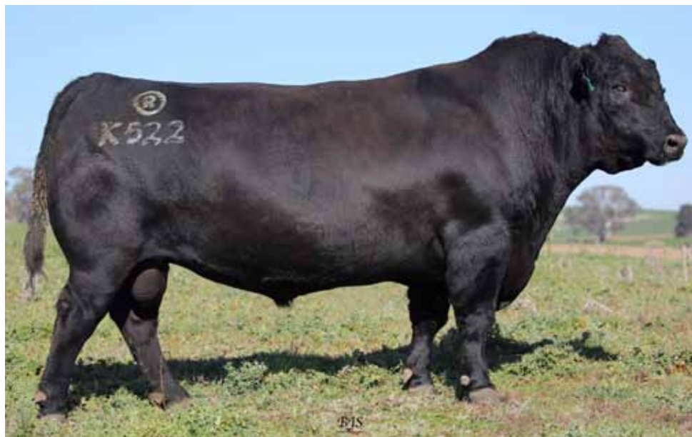
SIRE RENNYLEA KODAK K522 - SIRE OF LOTS 36, 71, 72, 75