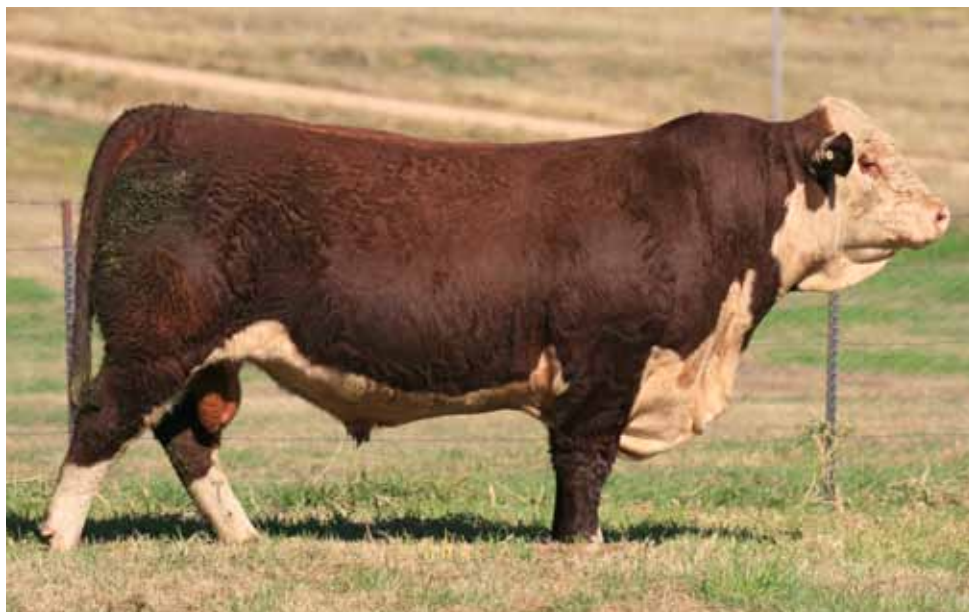
LOT 15 CASCADE MAXI P181 (S)

Notes: Long bull with a beautiful topline and muscle pattern. High milk EBV, top 5% for IMF.