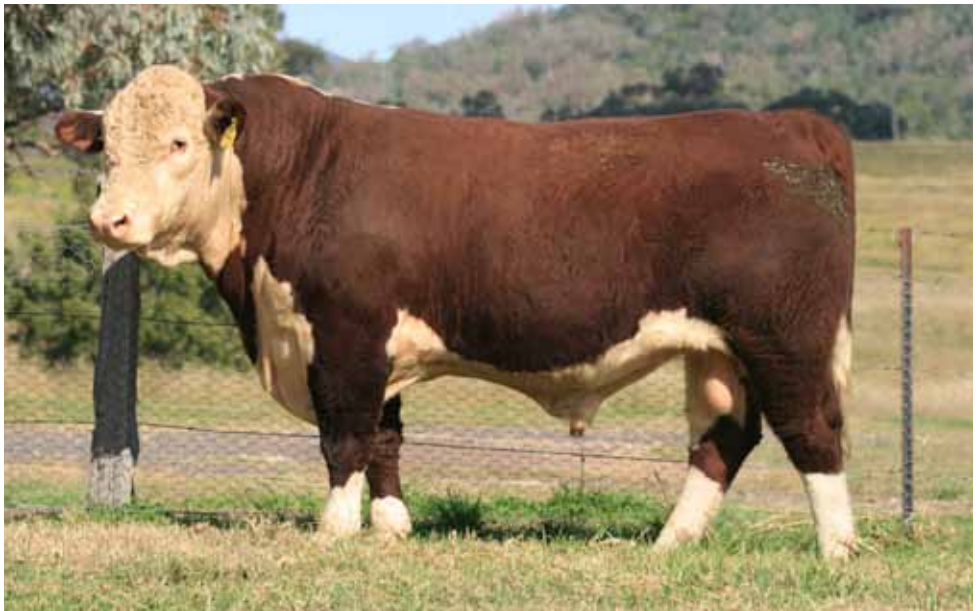
LOT 21 CASCADE LONGFORD P144 (S)

Notes: Length and outlook. Top 15% for IMF 200 400 and 600 day weights.