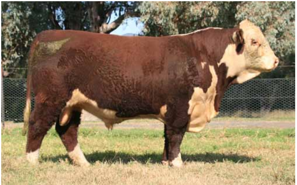
LOT 18 CASCADE MAXI P178 (PP)

Notes: Easy fleshing mobile bull with a well laid in shoulder.