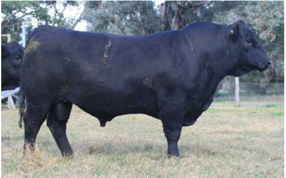
LOT 67 CASCADE RESERVE P134SV