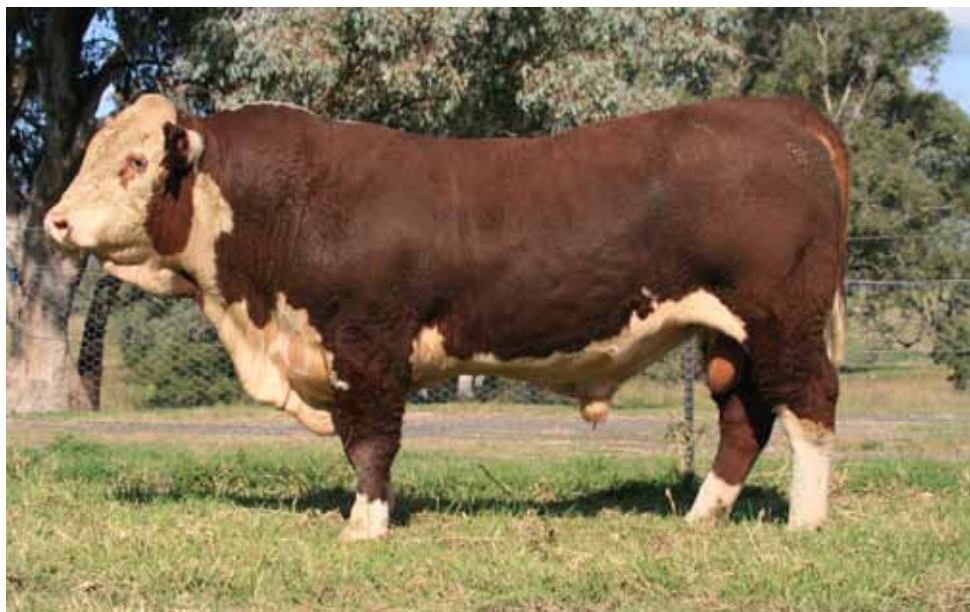
LOT 3 CASCADE ANZAC P114 (P)

Notes: Smooth skinned sire with excellent length and weight for age. P114 has power to boot. Top 1% 200,400 and 600 day weights, 10% EMA and 20% all Indexes.