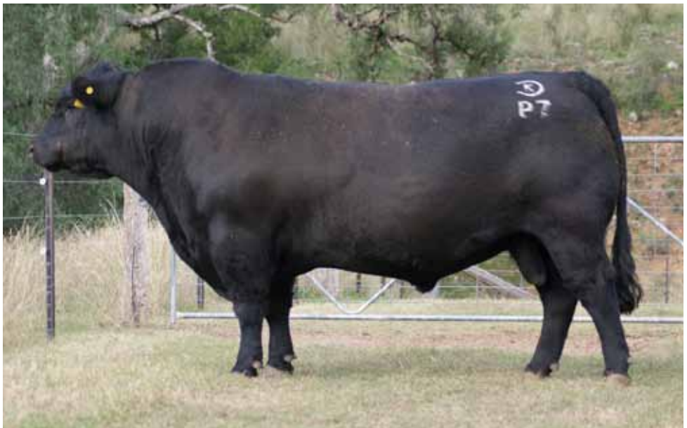
LOT 37 CASCADE COYBOY UP P7SV