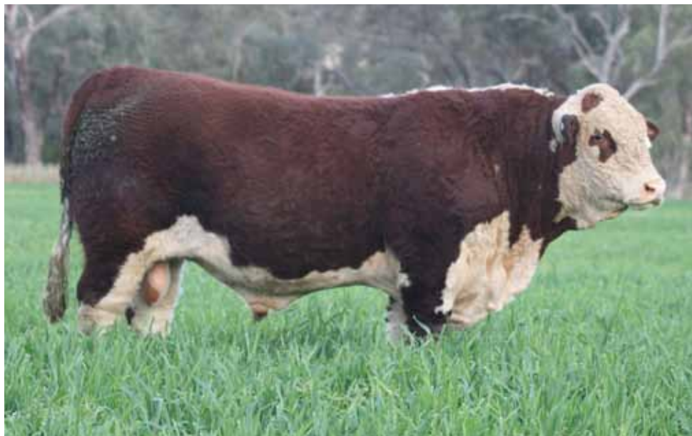
LOT 1 CASCADE ANZAC P162 (PP)

Notes: Stud Sire-Standout bull to start our 2020 sale. Exceptional quality and thickness. Anyone looking for a stud sire P162 is worthy of inspection. Was joined to cows last spring. Top 1% for 400 and 600 day weights, 5% for 200 and Scrotal, 10% EMA, 15% IMF and 20% all Indexes. Note-50 Straws of semen sold for in-herd use only and Cascade will retain 50 straws for in-herd use only.