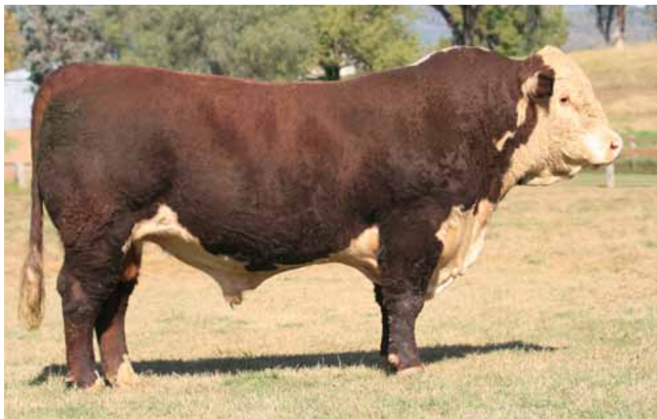
LOT 2 CASCADE ANZAC P126 (PP)

Notes: Stud Sire-Smoothed skinned, thick butted bull with extra length as are all of the L055 progeny. Joined to cows last spring Top 5% for 200, 400 and 600 day weights and 25% EMA.