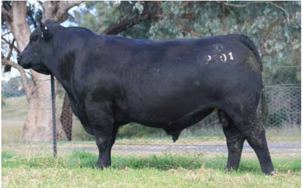
LOT 40 CASCADE MORGAN P101PV