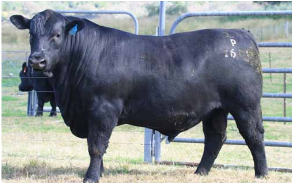
LOT 42 CASCADE LOADED GUN P1601SV