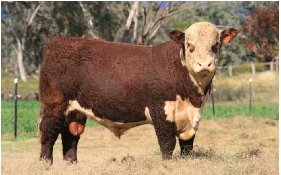
LOT 9 CASCADE ADVANCER P123 (PP)

Notes: Power, carcass and bone. A well muscled bull. Dam was 15 when she was sold, longevity. Top 5% for Retail Beef Yield, 10% for 200,400 and 600 day weights.