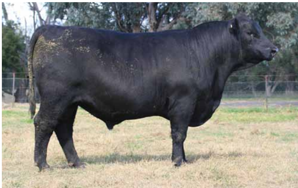
LOT 45 CASCADE STERN P114SV