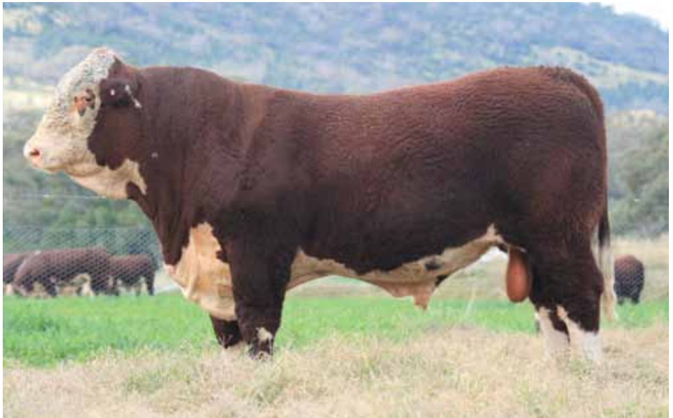
LOT 5 BOBANKEN ANZAC P016 (PP)

Notes: Real sire material. Powerful bull with extra muscle and width of pin. Great old cow family in the Irish Maid, they have served us well. Top 5% for 200 and 400 day weights, 10% for 600 day weights and 15% EMA. Top 20% all indexes.