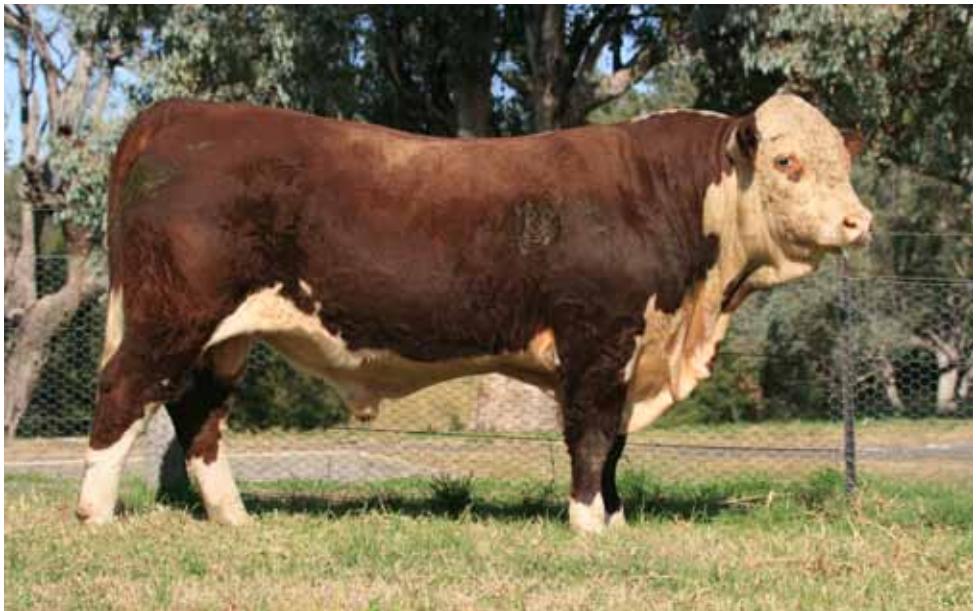
LOT 4 CASCADE ANZAC P148 (P)

Notes: More of the same! Good skin and extra growth. Top 10% 200, 400 and 600 day weights.