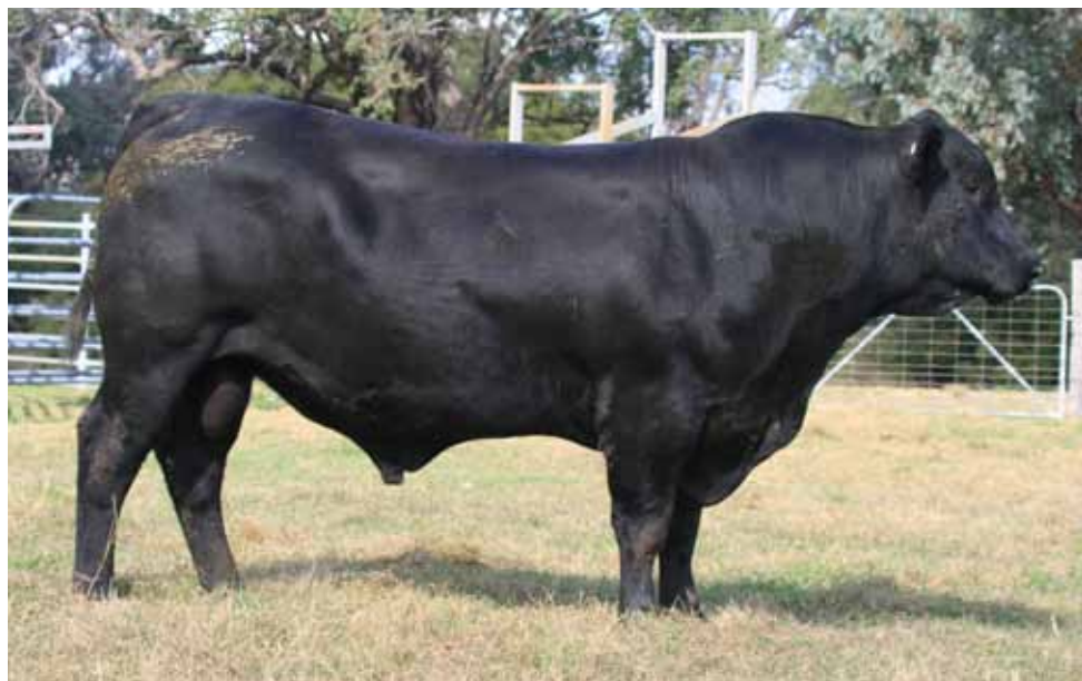
LOT 48 CASCADE MACGYVER P166PV