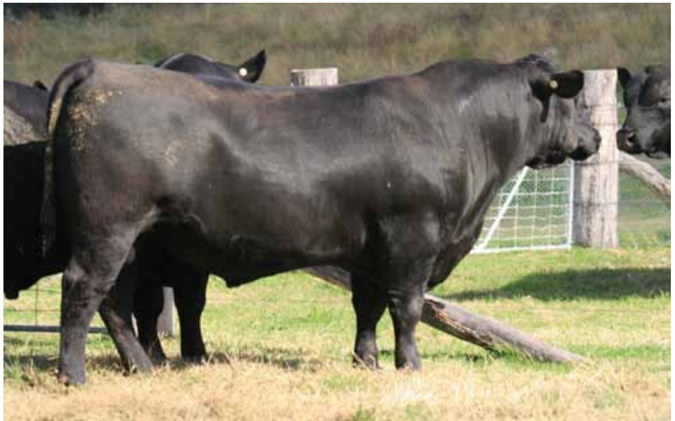
LOT 76 CASCADE HALLMARK P135SV