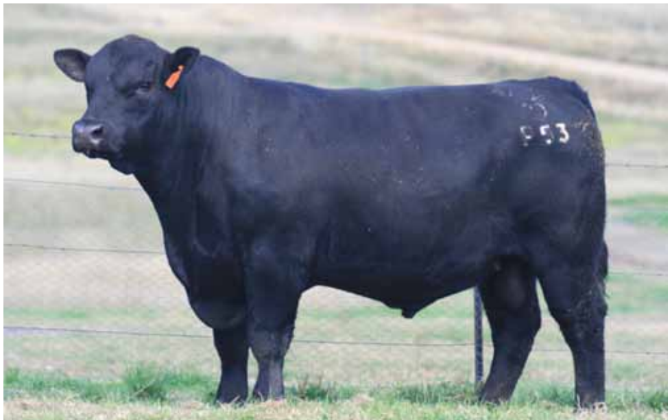
LOT 46 CASCADE CAPITALIST P53SV