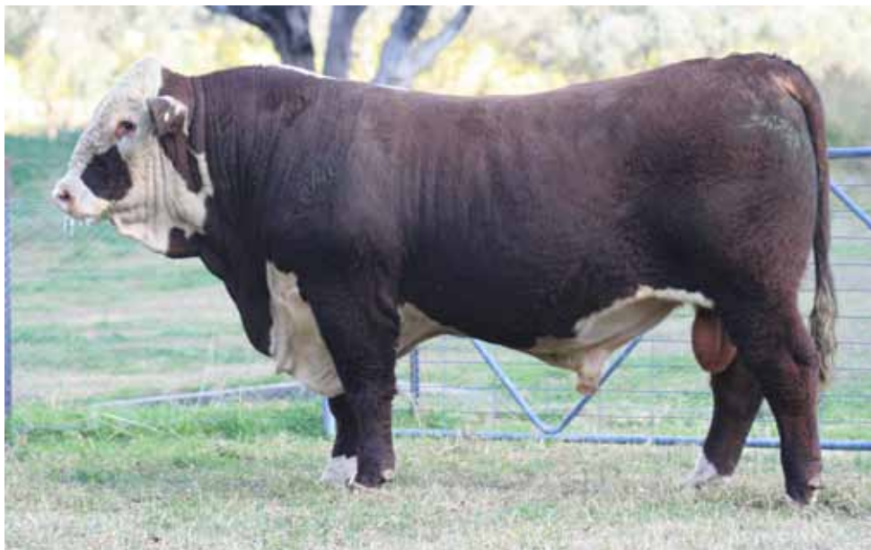
LOT 7 CASCADE ANZAC P035 (PP)

Notes: Powerful athletic sire . Excellent female lines prominent in this pedigree. Top 10% 200, 400 day weights and GL.