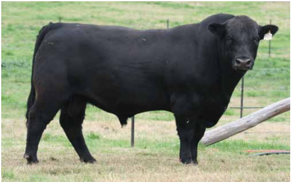
LOT 38 CASCADE COMPLEMENT P127SV