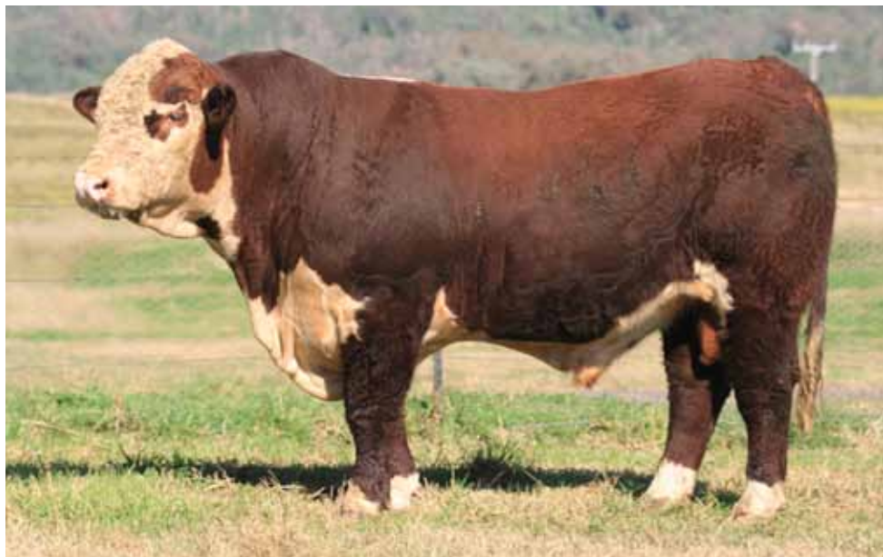
LOT 14 CASCADE WASHINGTON P087 (AI) (TW) (PP)

Notes: Load of visual muscle standing on a good structured bull.