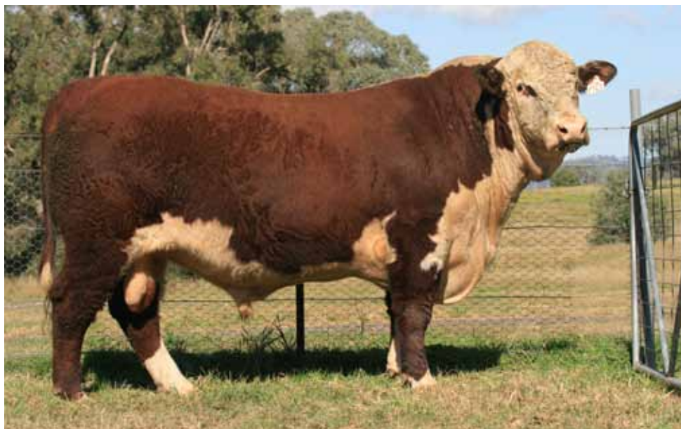
LOT 10 CASCADE ADVANCER P122 (S)

Notes: A moderate birth weight bull with outstanding growth and structure.High EBV for milk. Top 5% for 200, 400 and 600 day weights. Top 5% for Carcass weight and IMF.