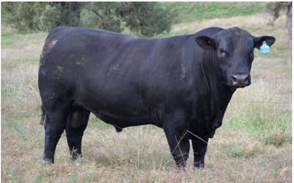
LOT 39 CASCADE HALLMARK P154SV