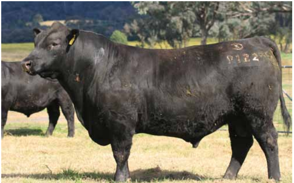
LOT 70 CASCADE GENESIS P122PV