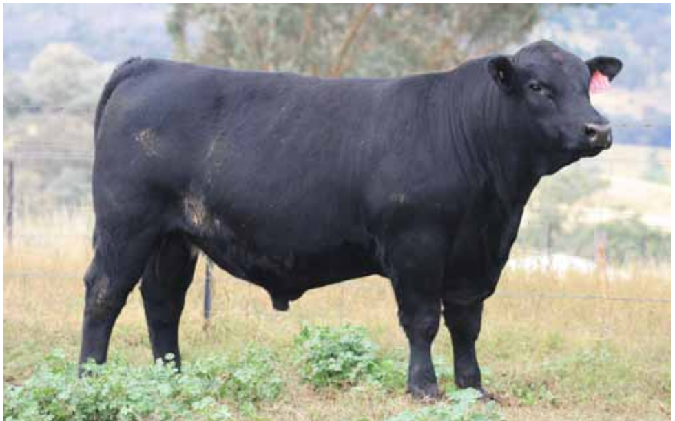
LOT 61 CASCADE LEGEND Q21PV