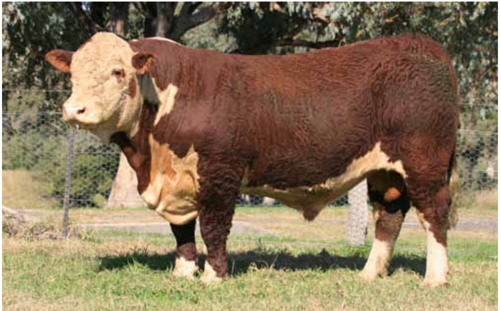
LOT 16 CASCADE MAGNATE P154 (PP)

Notes: Only bull by CDEM003 in sale catalogue. Outstanding carcass bull. Top 1% for 600 day weight, top 5% for 200and 400 day weights. Top 10% for EMA.