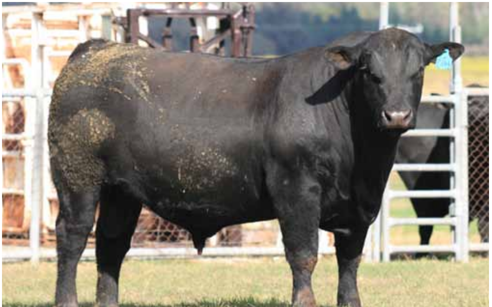
LOT 69 CASCADE CAPITALIST P144SV