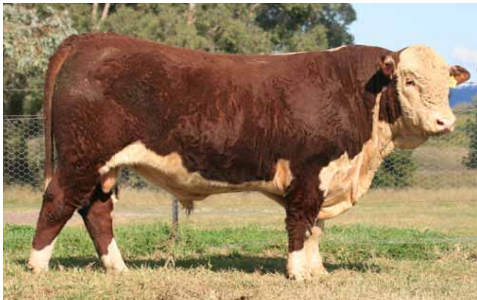
LOT 17 CASCADE MAXI P172 (P)

Notes: Moderate birth EBV data. Soft and good framed bull with a smooth shoulder.