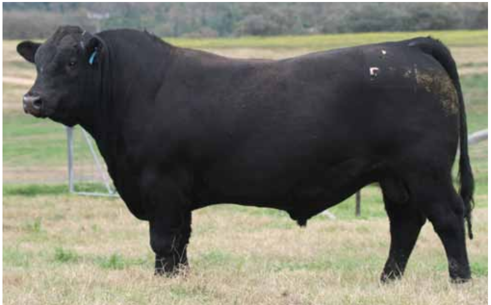
LOT 36 CASCADE KODAK P72SV