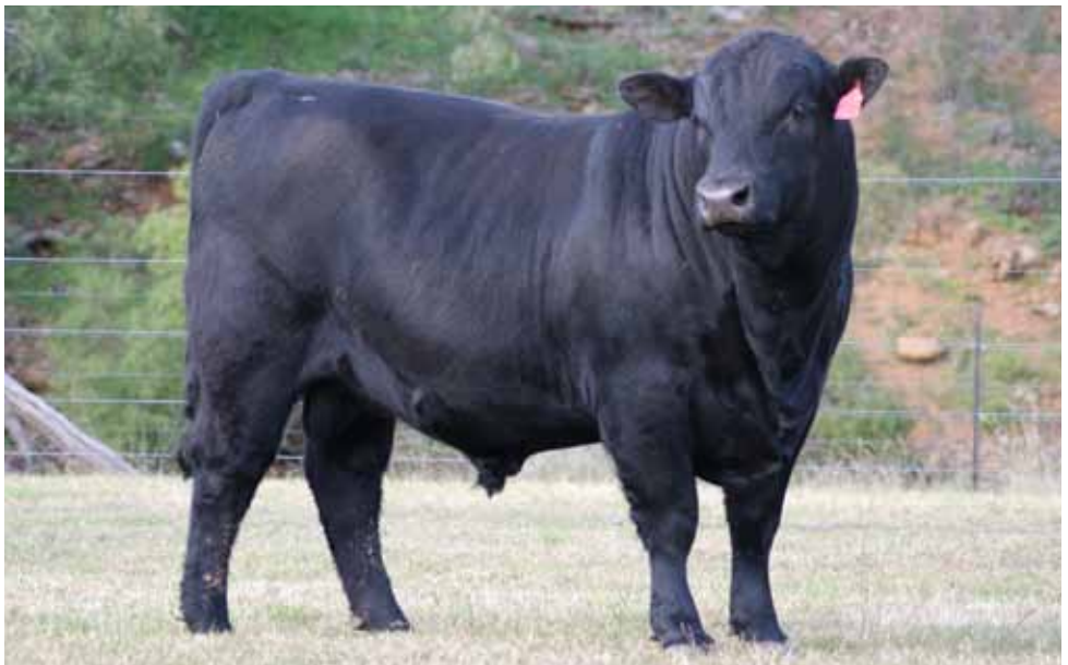
LOT 35 CASCADE RESERVE P133SV