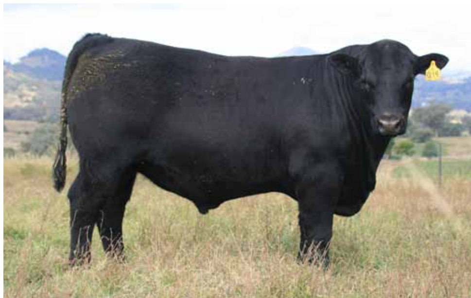
LOT 58 CASCADE CAPITALIST Q19SV