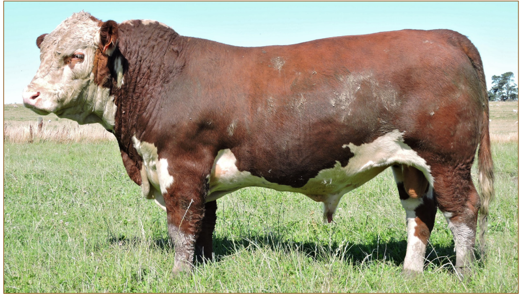
LOT 2 - OPCP253