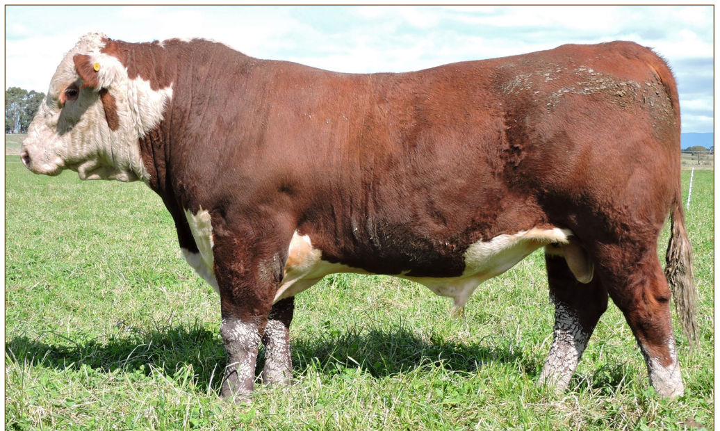
LOT 5 - OPCP219