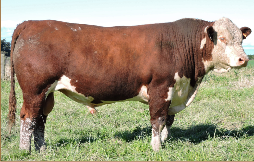
LOT 6 - OPCP245