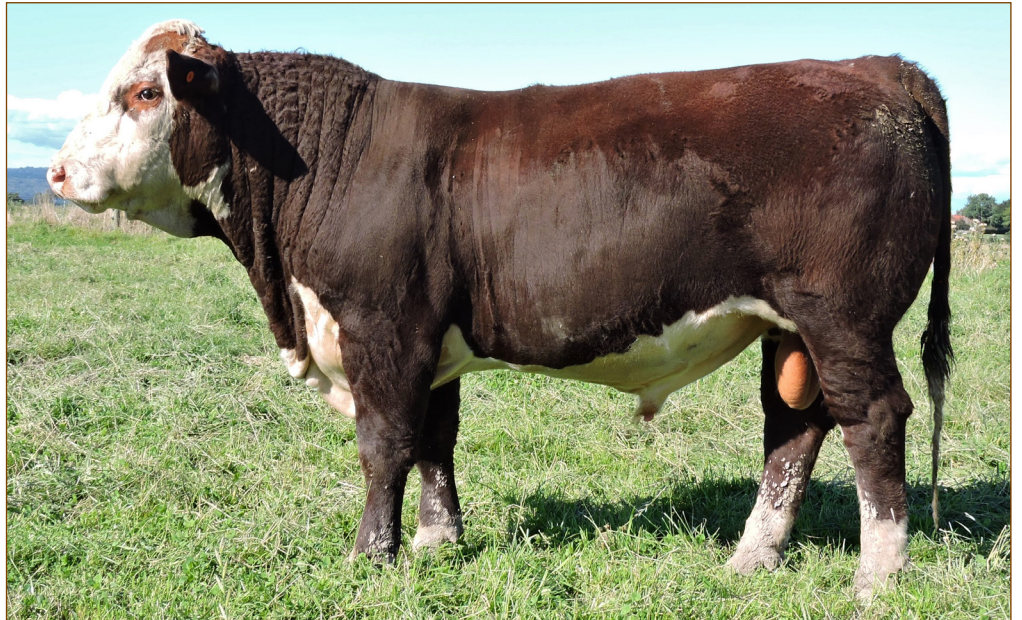
LOT 13 - OPCP234