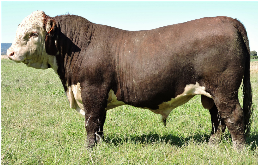
LOT 4 - OPCP372