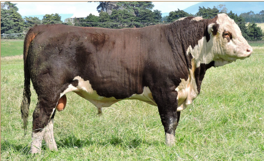
LOT 16 - OPCP366