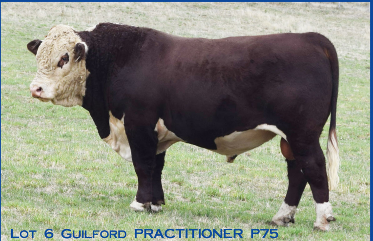
LOT 6 GUILFORD PRACTITIONER P75