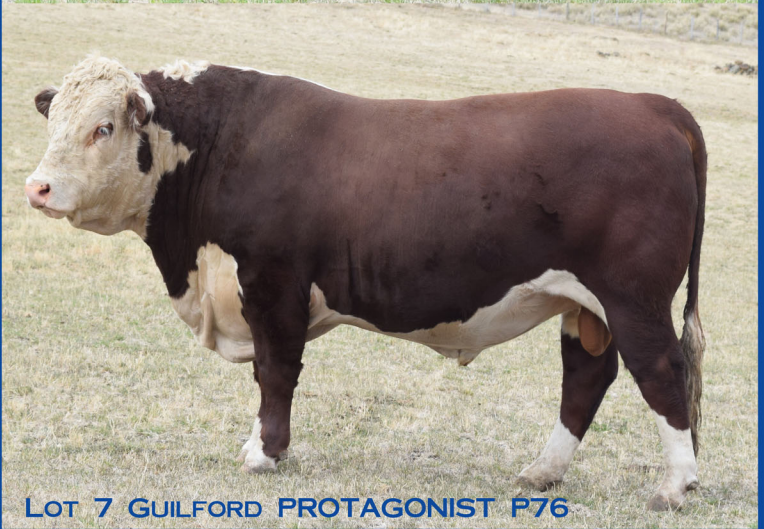
LOT 7 GUILFORD PROTAGONIST P76