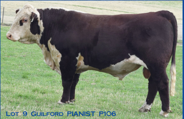
LOT 9 GUILFORD PIANIST P106