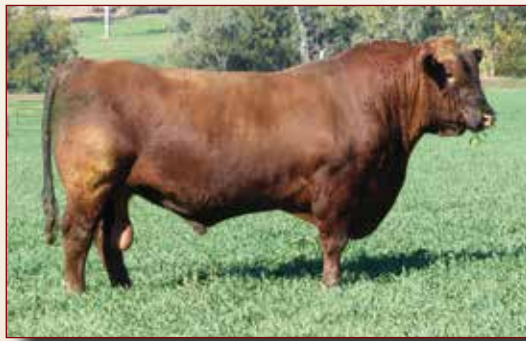
Goonoo Red Mind sired by K5X Jackpot J20