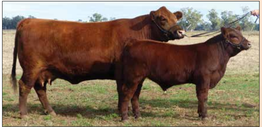
GOONOO RED FULL CASSIE (GSJE04) Senior & Grand Champion Female National Show & Sale 2015