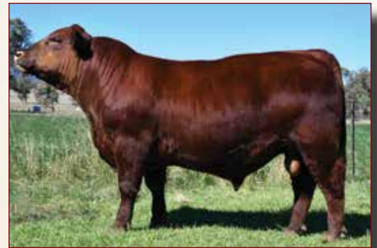
Goonoo joining sire: Jindelliston Park Nero N12