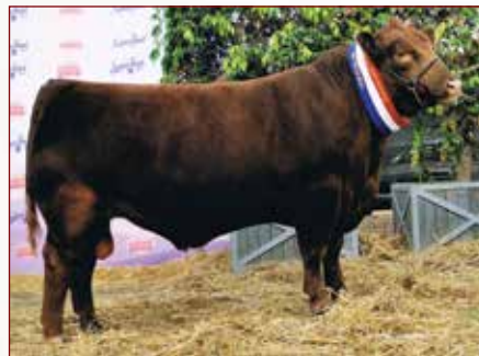
Goonoo 26P Jose Carreras Sire: Red Fine Line Mulberry 26P Senior & Grand Champion Bull Sydney Royal Feature Show 2016 Maternal brother to dam of Lot 18