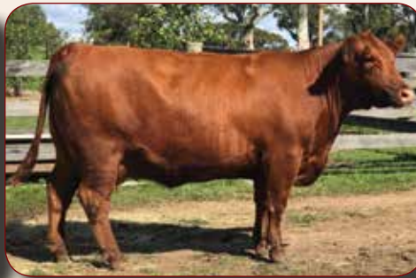
▲ Dam: Wollumbi Miss Momentum