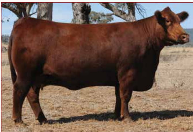
Goondoola Miss D dam of Lots 25. Grand Champion Sydney Royal