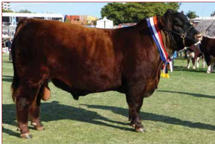
◀ K5X Jackpot J20: Team member Interbreed Champion Pair. Senior & Grand Champion Red Angus Bull Brisbane Royal 2015