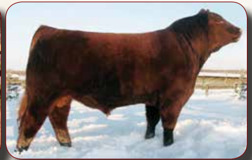
▲ Sire: Red Northline Fat Tony 605U