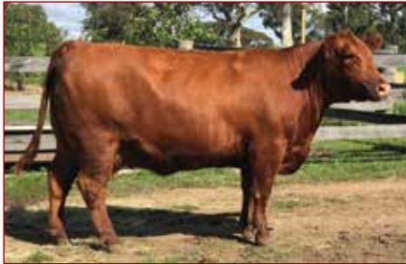
Wollombi Miss Momentum, dam of Lots 5 & 7.

Comments: Pow is another great miss momentum Daughters PWWJ17, this time by the Rib-Eye sire. A real soft easy doing female still with lots of punch, great on her feet and legs. Sells joined to YRAM10