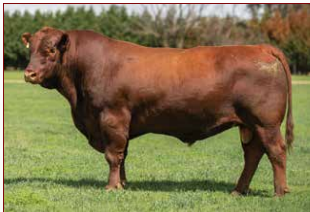
▲ Yallabee Buncha: Sire of Lots 30, 31