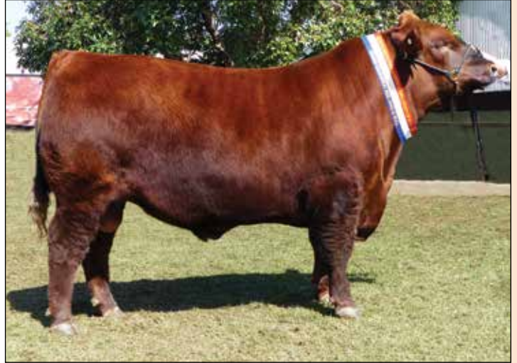
GOONOO CHUCK KENNY (GSJK14) Sire: Red Northline Chuck Norris 305X Senior & Grand Champion Bull - Adelaide Royal 2016