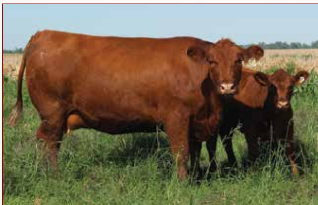
▲ GK Red Dina 240 M29: Dam of Lot 29.