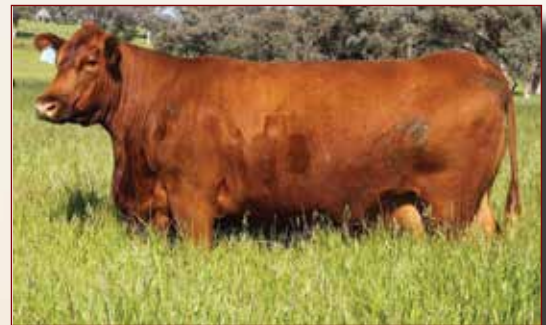
▲ BST Tullatoola Robin's Doll C104: Dam of Lot 10