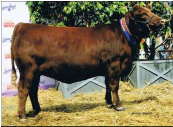
GOONOO 26P IMPISH K33 (GSJK33) Sire: Red Fine Line Mulberry 26P Junior Champion Heifer - Sydney Royal Feature Show 2016