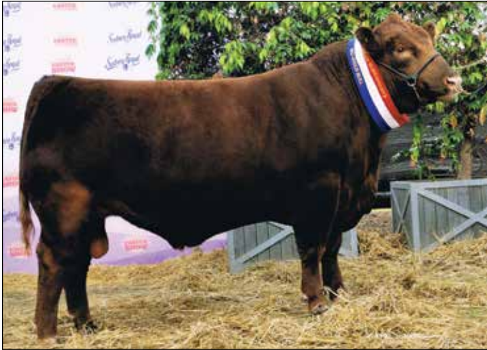
GOONOO 26P JOSE CARRERAS (GSJJ26) Sire: Red Fine Line Mulberry 26P Senior & Grand Champion Bull - Sydney Royal Feature Show 2016