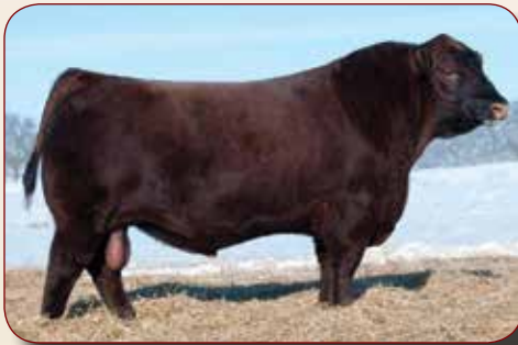
▲ Sire: Red Cockburn Ribeye 308U