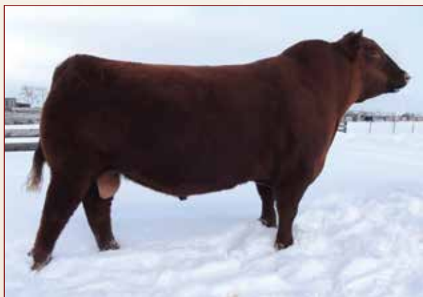
Red CRSL Goldmaster X74: Sire of Lot 29