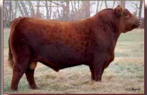
Lot 44: Red Fine Line Mulberry 26P