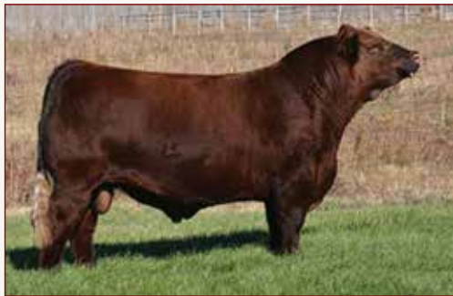
Red Six Mile High Caliber 177C, Goonoo AI Sire.