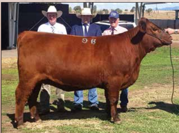
GOONOO RED Magnolia (GSJM16)

We have confidence in the genetics that bear the Goonoo "brand". We are equally as proud of a commercial producer increasing his financial return with progeny of a Goonoo sire as we are winning a Royal show. With a long family involvement in agriculture and the next generation showing interest we are committed to the long haul. We look forward to seeing you at this special sale and if you have any questions please do not hesitate to contact us.