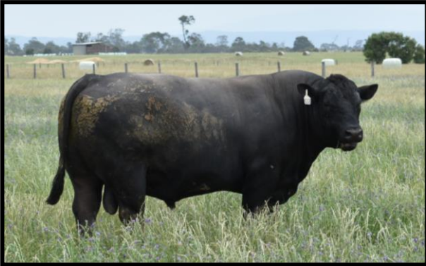
LEAWOOD YEO K268