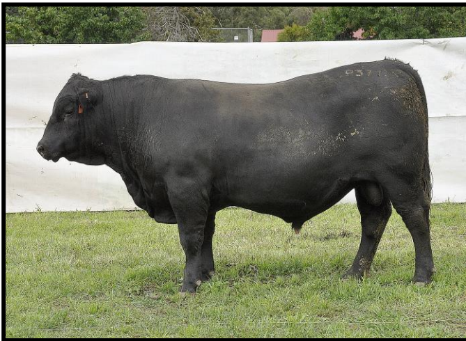
LOT 28 LEAWOOD YEO P561