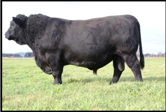
KAHARAU CLASS 790