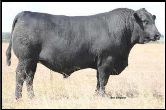
CLUNIE RANGE LEGEND