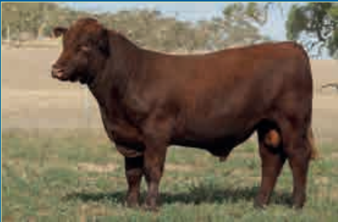
Lot 15 Belmore Drover P294