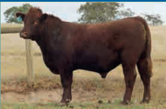
Lot 43 Belmore Fortress P66