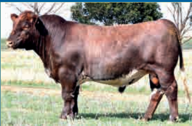
Lot 26 Bayview Wagner P75