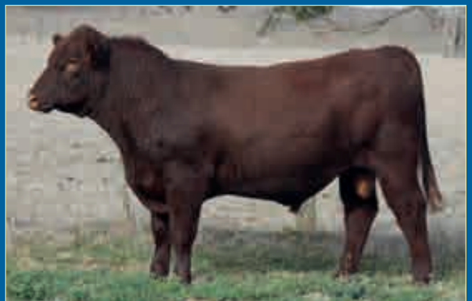
Lot 14 Belmore Juggler P365