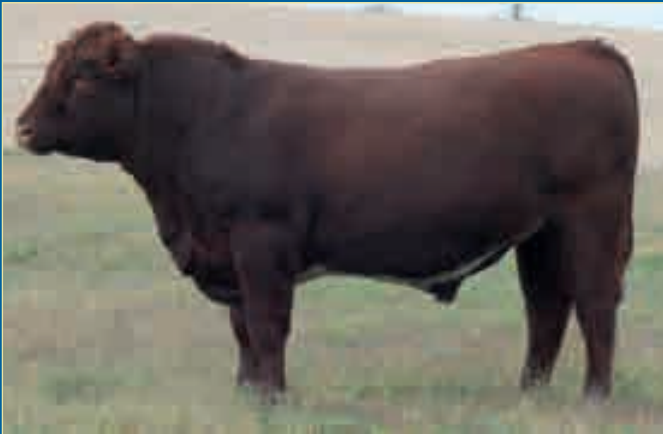
Lot 5 Belmore Larrikin P61