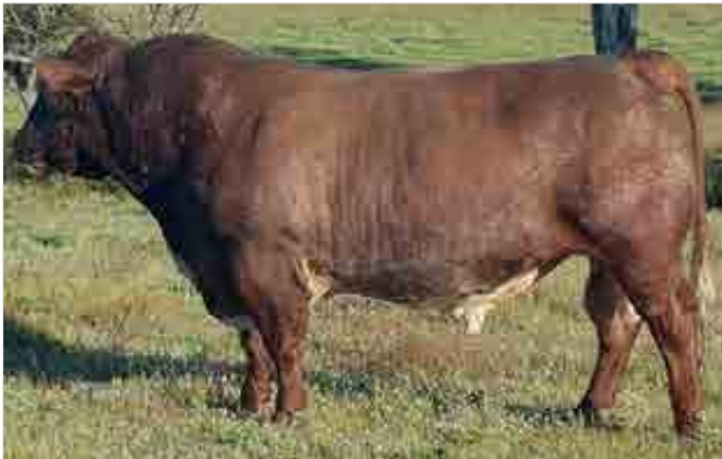
Belmore Quantur G193