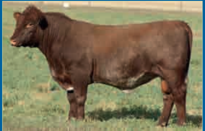
Lot 3 Belmore Fortress P72