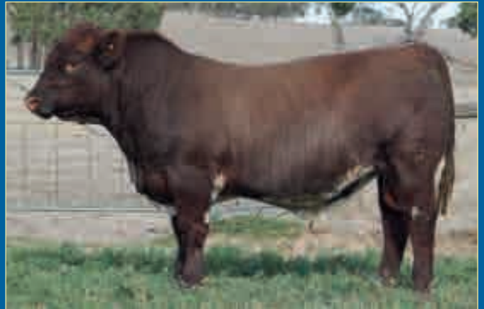
Lot 9 Belmore Chancellor P234