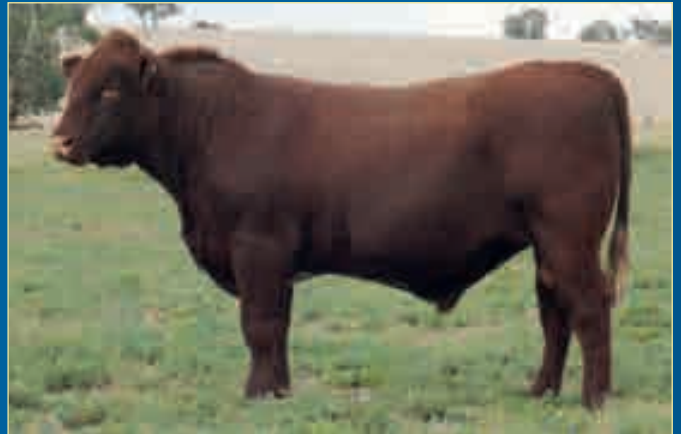
Lot 36 Belmore Stockman P102