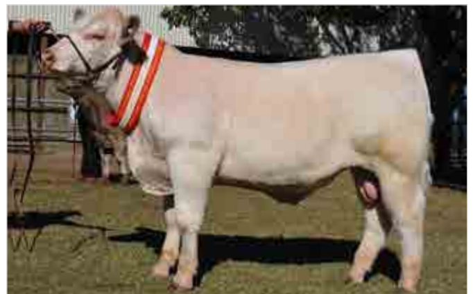
Carlton Jazz Ruler