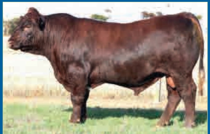
Lot 25 Bayview Austin P104