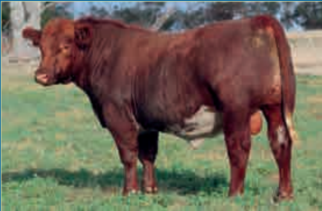
Lot 20 Belmore Quantum P254