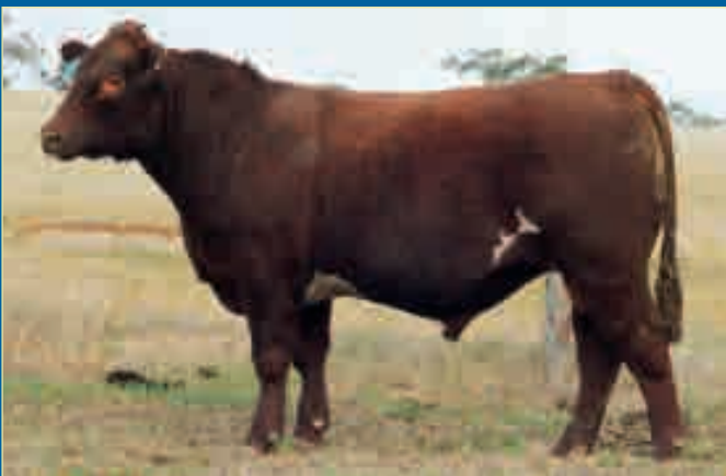
Lot 38 Belmore Fortress P46