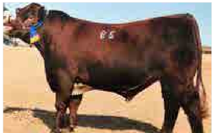
Wynyard Larrikin L114