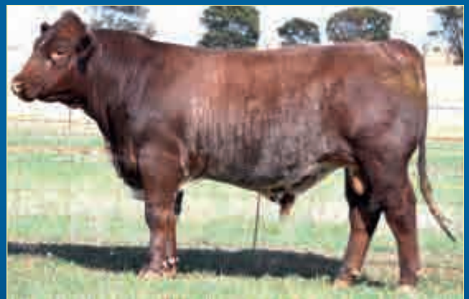
Lot 27 Bayview Commissioner P89