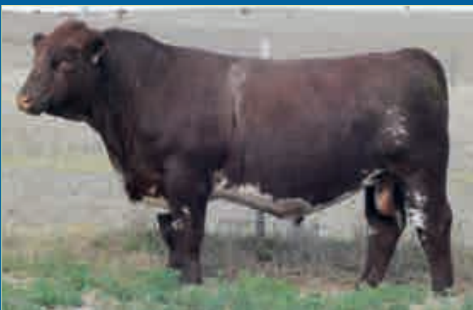
Lot 12 Belmore Quantum P360