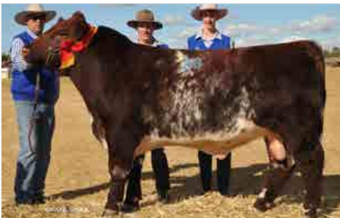
Nagol Park Elmt Logo L227