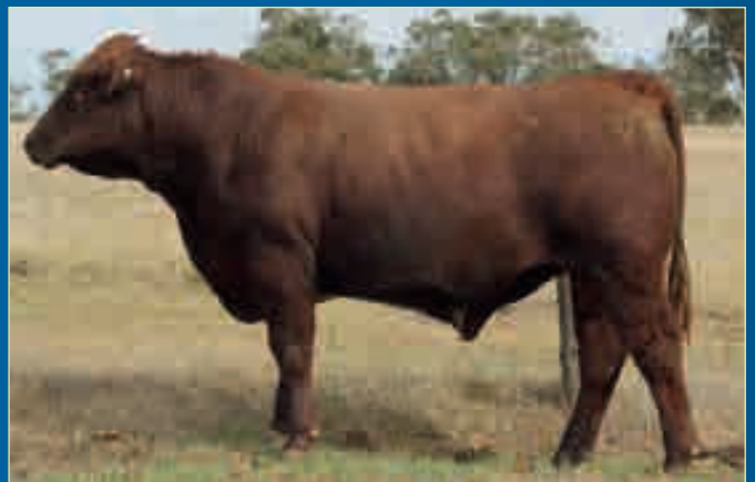
Lot 41 Belmore Larrikin P48