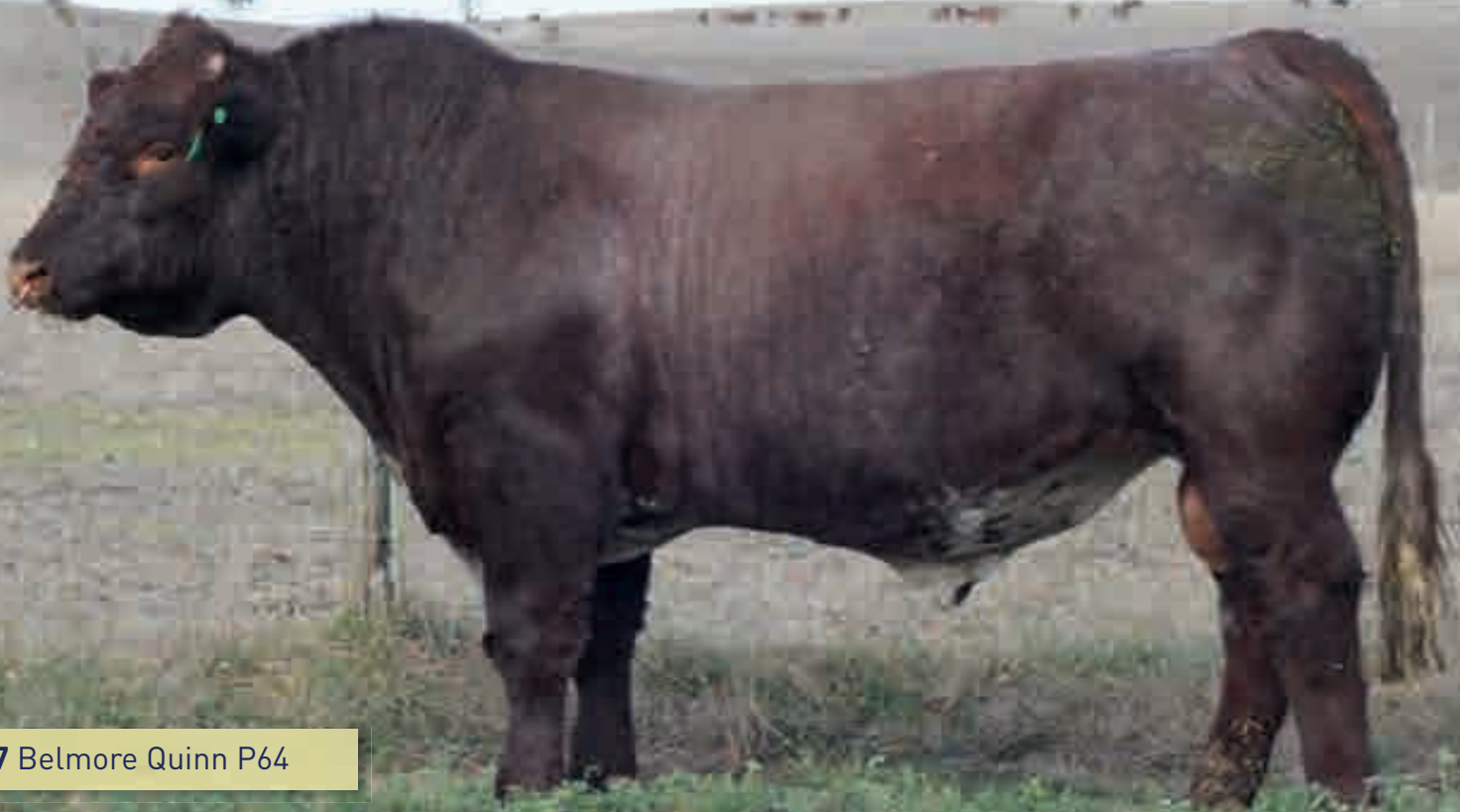
Lot 7 Belmore Quinn P64

47 Performance Recorded Shorthorn Bulls With Bayview and Carlton