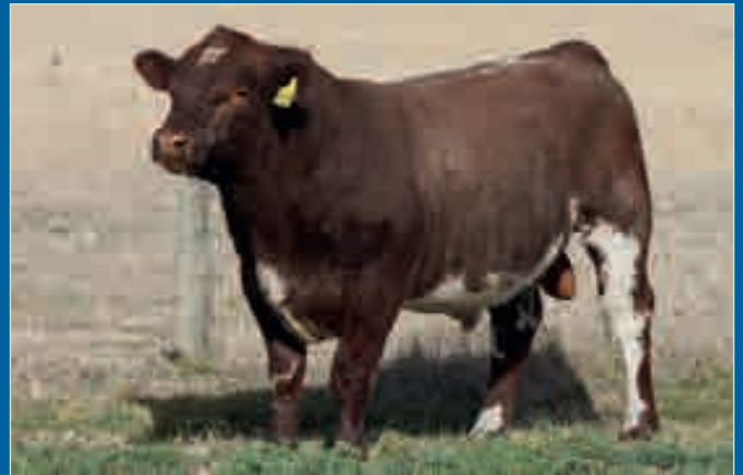
Lot 16 Belmore Drover P316