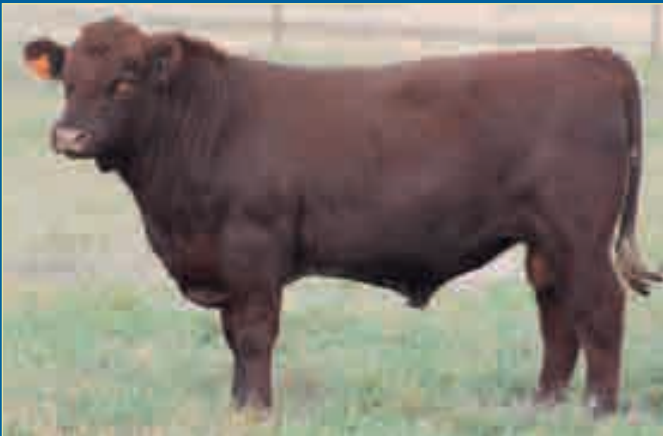
Lot 1 Belmore Larrikin P52