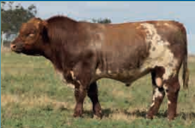
Lot 10 Belmore Chancellor P221