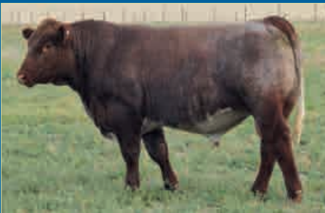
Lot 23 Belmore Juggler P248