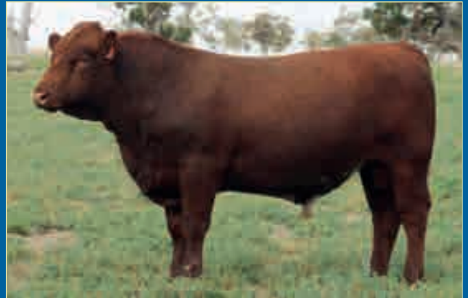
Lot 21 Belmore Larrikin P342