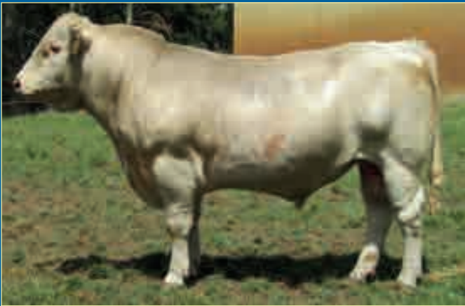
Lot 30 Carlton Pierre