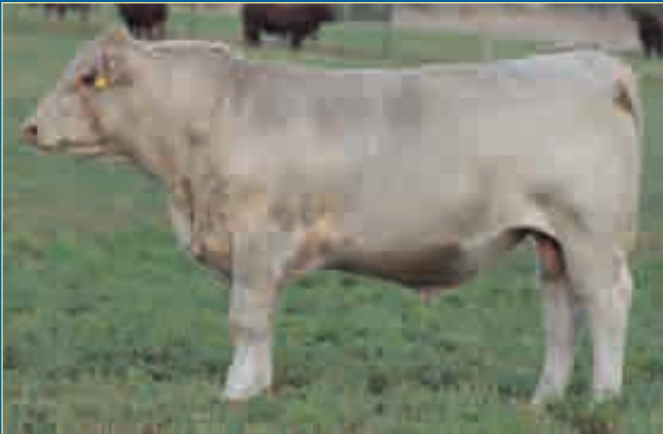
Lot 34 Belmore Drover P311