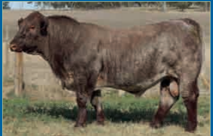
Lot 11 Belmore Juggler P299