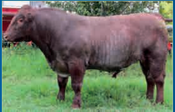
Lot 31 Carlton Painted Panache