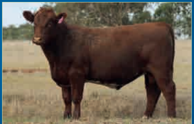
Lot 47 Belmore Tsar P197