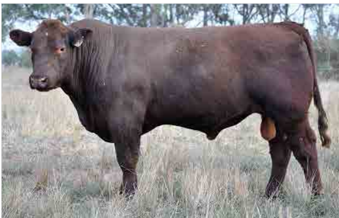
Eloora Fortress L19