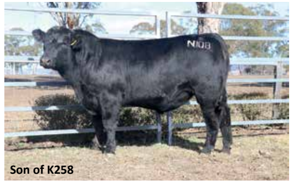
Son of K258

RIPPLE VALE RUSSELL R60# DOUBLE D W116# UNKNOWN