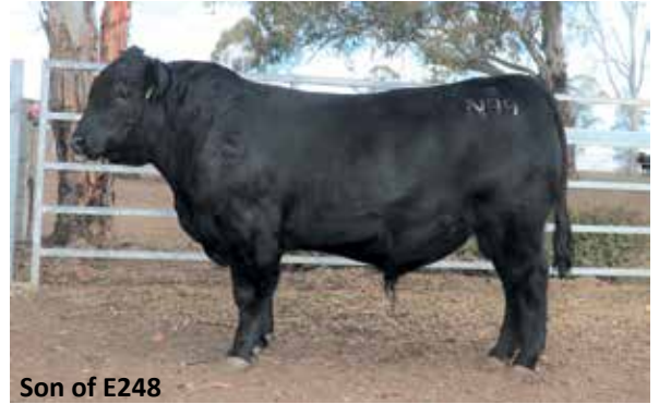
Son of E248

DOUBLE D TRAFALGAR T31# DOUBLE D THELMA X10# WEEMALAH THELMA J22+89#