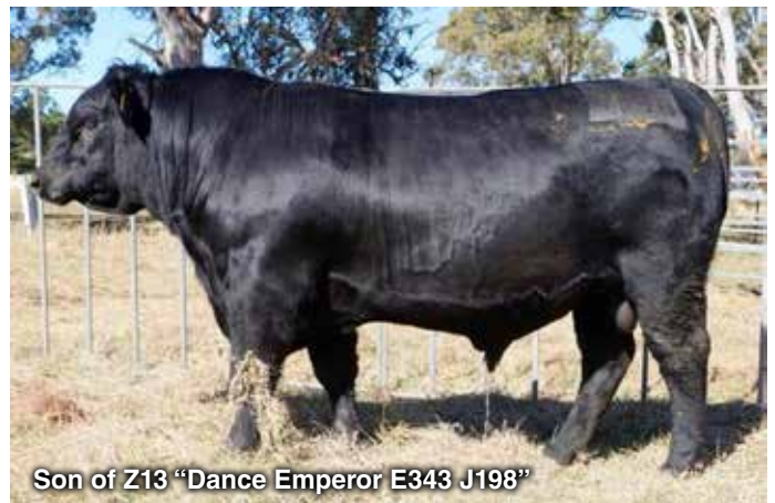
Son of Z13 "Dance Emperor E343 J198"