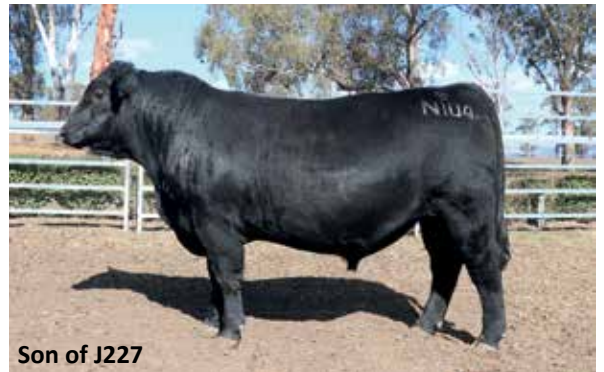
Son of J227