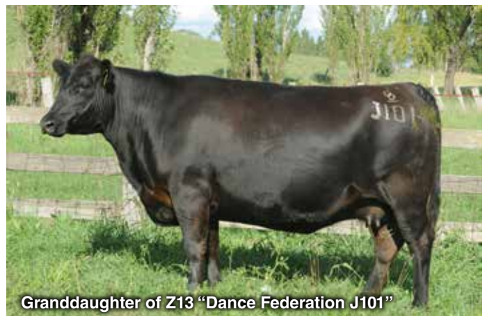
Granddaughter of Z13 "Dance Federation J101"