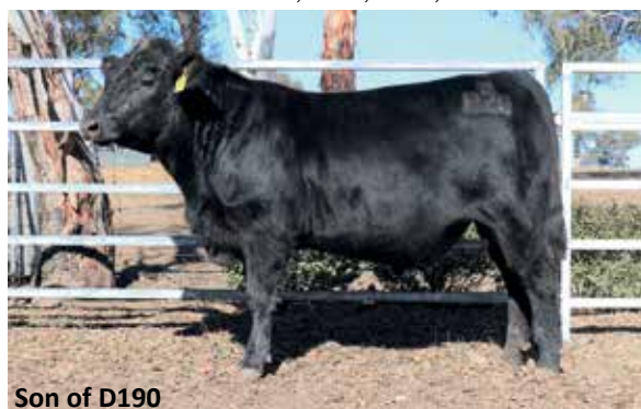
Son of D190

Birth Date: 25/08/2008 Genetic Status: AMC,CAFU,DDFU,NHFU