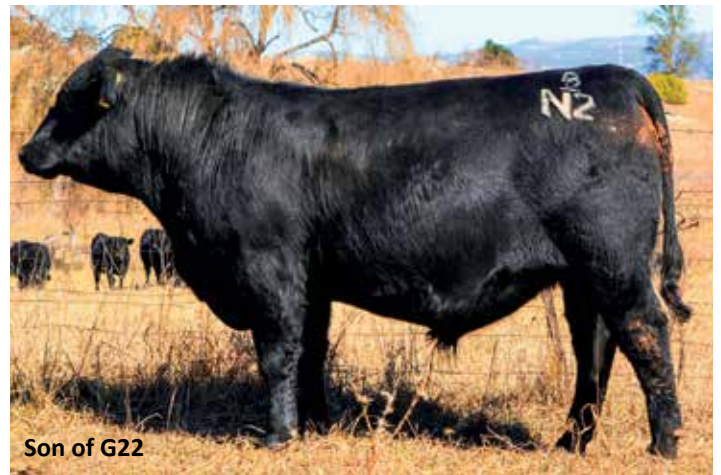
Son of G22