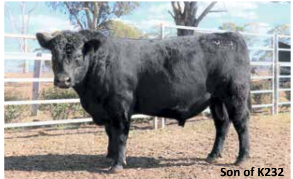
Son of K232

S A F FOCUS OF E R # MYTTY IN FOCUS # MYTTY COUNTESS 906 # SIRE: A A R TEN X 7008 S A SV S A V ADAPTOR 2213 # A A R LADY KELTON 5551 # H S A F LADY KELTON 504B # YTHANBRAE HENRY VIII U8 SV LAWSONS HENRY VIII Z1584 SV YTHANBRAE TRUE BLUE N33 V706 # DAM: DANCE HENRY E305 # G A R PARAMOUNT # LAWSONS PARAMOUNT W297 # YTHANBRAE N107+93 #