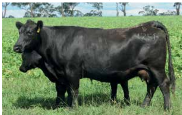
Mid February 2020 TransTasman Angus Cattle Evaluation

Birth Date: 5/09/2013 Genetic Status: AM4%,CA2%,DD25%,NH4%