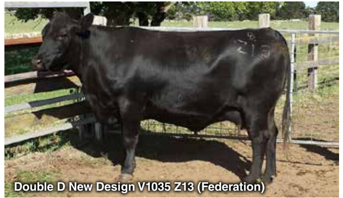
Double D New Design V1035 Z13 (Federation)

Double D New Design V1035 Z13 is arguably the best cow we have bred. She had 23 progeny recorded, many of which have topped bull sales time and time again. Her daughters have bred on to continue her legacy and have cemented their place among the elite of our herd. Z13 and her progeny have had such an impact at Dance Angus that she caused us to rethink our naming philosophy, with all her daughters taking the female name of her dam "Federation". The flush to Te Mania Emperor has been our most successful flush ever with 8 beautiful females (5 of which are offered in this sale) and 5 big powerful, robust bulls, 4 of which have been used by stud breeders. Her daughter G59, granddaughter J101 and great granddaughter N22 are also feature lots in this sale.