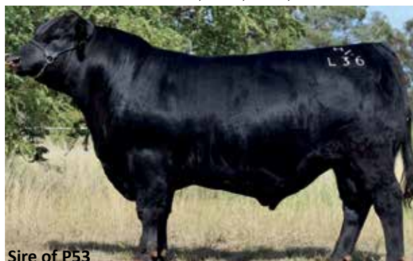
Sire of P53

KAROO W109 DIRECTION Z181 SV CARABAR DOCKLANDS D62 PV CARABAR BLACKCAP MARY B12 PV SIRE: CARABAR DOCKLANDS L36 PV TE MANIA BERKLEY B1 PV CARABAR BLACKCAP MARY H180 SV CARABAR BLACKCAP MARY B37 PV ARDROSSAN ADMIRAL A2 PV DANCE ADMIRAL E55 SV LAWSONS ROCKN D AMBUSH X55 # DAM: DANCE ADMIRAL E55 K283 # LAWSONS HIGH GRADE Z440 PV DANCE HIGH GRADE C196 # DOUBLE D NEW LEVEL A139 #