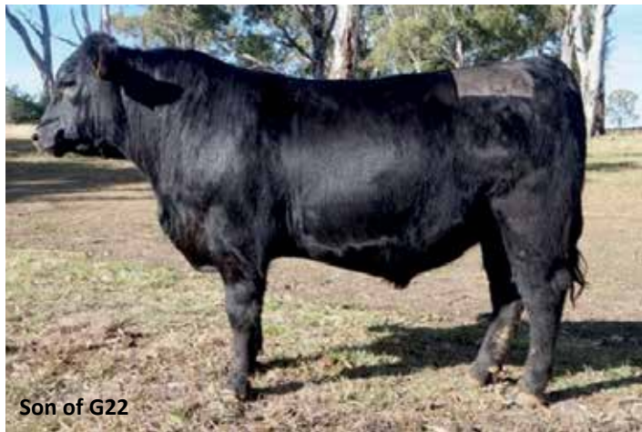
Son of G22