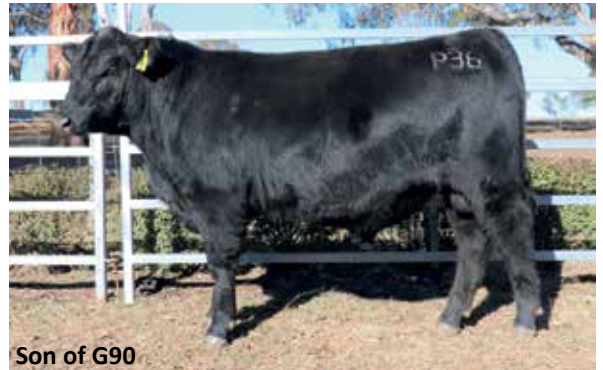
Son of G90

C A FUTURE DIRECTION 5321# ARDROSSAN DIRECTION W109 PV ARDROSSAN WILCOOLA Q71+95# SIRE: ARDROSSAN ADMIRAL A2 PV B/R NEW DESIGN 036# KENNY'S CREEK ROSEBUD W171# IMRAN ROSEBUD U17# G D A R TRAVELER 044# G A R GRID MAKER# G A R PRECISION 2536# DAM: LAWSONS GRIDMAKER Z37# ROCKN D AMBUSH 1531# LAWSONS ROCKN D AMBUSH X81# YTHANBRAE NEW DESIGN 036 T195#