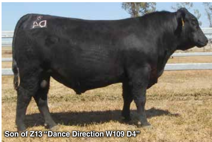
Son of Z13 "Dance Direction W109 D4"

*Note: Due to her exceptional performance, we recently had Z13 tested for genomics under the HD50K program and as a result her growth figures have improved markedly. This may not be evident in the comments section of each lot.