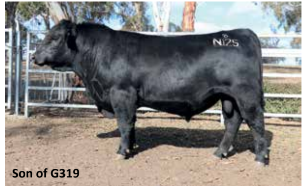
Son of G319

C A FUTURE DIRECTION 5321# CONNEALY COWBOY# BECKAH OF CONANGA 747# SIRE: CONNEALY WRANGLER# G A R GRID MAKER# KELLY OF CONANGA 577# CONNEALY BANDO 133# B/R NEW DESIGN 036# BON VIEW NEW DESIGN 1407# BON VIEW PRIDE 664# DAM: DOUBLE D NEW DESIGN 1407 B215# B/R NEW DESIGN 036# YTHANBRAE NEW DESIGN 036 V1032# G A R PRECISION 365#