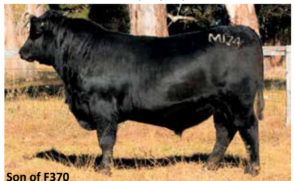
Son of F370

C A FUTURE DIRECTION 5321# ARDROSSAN DIRECTION W109 PV ARDROSSAN WILCOOLA Q71+95# SIRE: DANCE DIRECTION W109 D13 SV YTHANBRAE NEW DESIGN 036 V1035# DOUBLE D Z192# UNKNOWN BON VIEW NEW DESIGN 1407# DOUBLE D NEW DESIGN 1407 B1 SV LAWSONS GRIDMAKER Z11# DAM: DANCE D315# LAWSONS GAR FAIR DINKUM Z197 PV DOUBLE D FAIRDINKUM B126# DOUBLE D BURNETT V18#