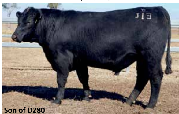
Son of D280

Birth Date: 24/09/2008 Genetic Status: AMF,CAF,DDF,NHF