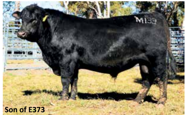
Son of E373

PAPA POWER 096 # PAPA EQUATOR 2928 # PAPA ENVIOUS BLACKBIRD 8849 # SIRE: WILSON DOWNS EQUATOR V191 SV N BAR EMULATION EXT # WILCO QUEENIE S9 # WILCO QUEENIE Q2+95 # G A R YIELD GRADE # LAWSONS HIGH GRADE Z440 PV LAWSONS PAYLOAD W536 # DAM: DANCE HIGH GRADE C221 # YTHANBRAE NEW DESIGN 036 V1035 # DOUBLE D NEW DESIGN V1035 Z31 # DOUBLE D BEAUTY S14 #