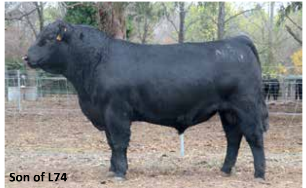
Son of L74

BON VIEW NEW DESIGN 208 SV TC TOTAL 410 # TC ERICA EILEEN 2047 # SIRE: POSS TOTAL IMPACT 745 # CONNEALY LEAD ON # POSS BLACKCAP 5116 # POSS BLACKCAP 205 # BALDRIDGE KABOOM K243 KCF # MOHNNEN DYNAMITE 1356 # MOHNNEN JILT 910 # DAM: DANCE DYNAMITE1356 H6 # YTHANBRAE NEW DESIGN 036 V1035 # DOUBLE D NEW DESIGN V1035 Z13 # WALHALLA FEDERATION+93 #