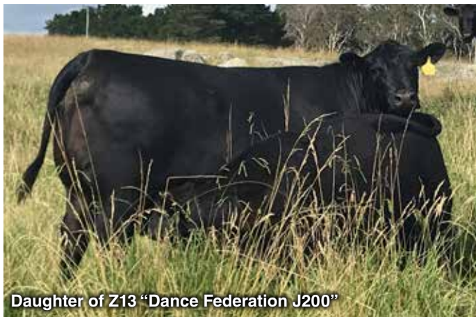
Daughter of Z13 "Dance Federation J200"