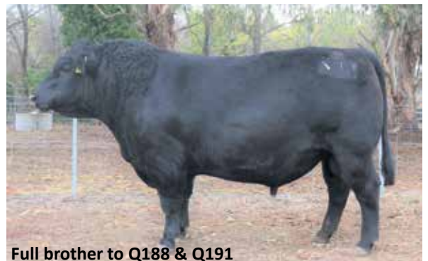
Full brother to Q188 &amp; Q191

WAITARA VALLEY TEX # HINGAIA 469 # HINGAIA 910 # SIRE: MILLAH MURRAH KINGDOM K35 PV BT RIGHT TIME 24J # MILLAH MURRAH FLOWER G41 PV MILLAH MURRAH FLOWER C15 SV TE MANIA BERKLEY B1 PV TE MANIA EMPEROR E343 PV TE MANIA LOWAN Z74 PV DAM: DANCE FEDERATION J200 PV YTHANBRAE NEW DESIGN 036 V1035 # DOUBLE D NEW DESIGN V1035 Z13 # WALHALLA FEDERATION+93 #