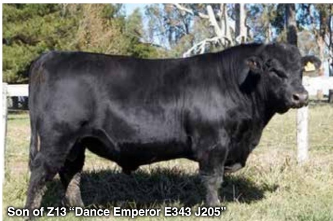
Son of Z13 "Dance Emperor E343 J205"