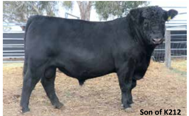
Son of K212

RITO 112 OF 2536 RITO 616# GAR-EGL PROTEGE# L B 6807 ISABEL 339# SIRE: CONNEALY SHREK 4242# CONNEALY DANNY BOY# BLACK SHELL OF CONANGA 10# BLACK SHEBA OF CONANGA 010# B/R NEW DESIGN 036# BON VIEW NEW DESIGN 1407# BON VIEW PRIDE 664# DAM: DOUBLE D NEW DESIGN 1407 A16# BON VIEW BANDO 598# DOUBLE D BURNETTE R4# SOUTHTEC KIRA K2+90#