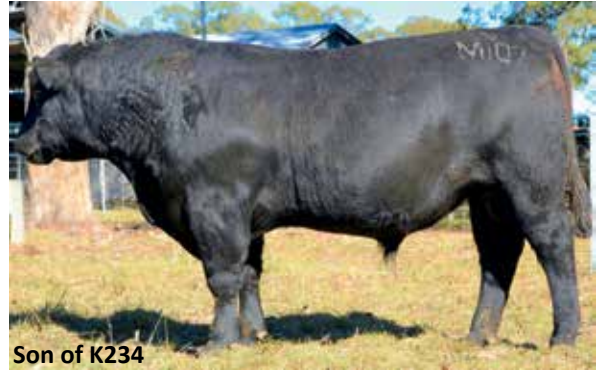
Son of K234