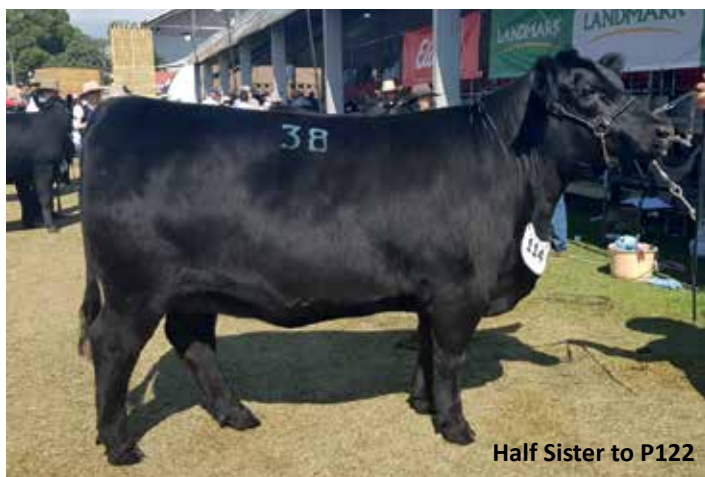
Half Sister to P122