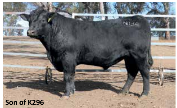
Son of K296

VERMILION DATELINE 7078# J & C APPEAL A10PV J & C MISS CHEYENNE W3# SIRE: DANCE TANK F232SV YTHANBRAE NEW DESIGN 036 V1035# DOUBLE D NEW DESIGN V1035 Z31# DOUBLE D BEAUTY S14# RITO 112 OF 2536 RITO 616# GAR-EGL PROTEGE# L B 6807 ISABEL 339# DAM: DANCE PROTEGE E196# YTHANBRAE NEW DESIGN 036 V1035# DOUBLE D NEW DESIGN V1035 Y255# DOUBLE D#