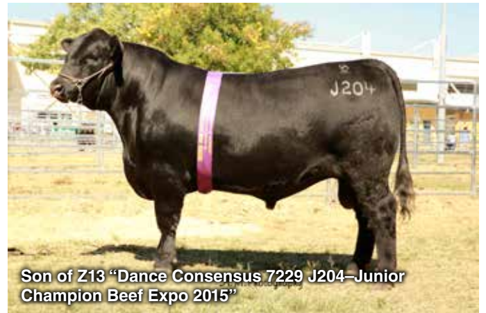
Son of Z13 "Dance Consensus 7229 J204 - Junior Champion Beef Expo 2015"