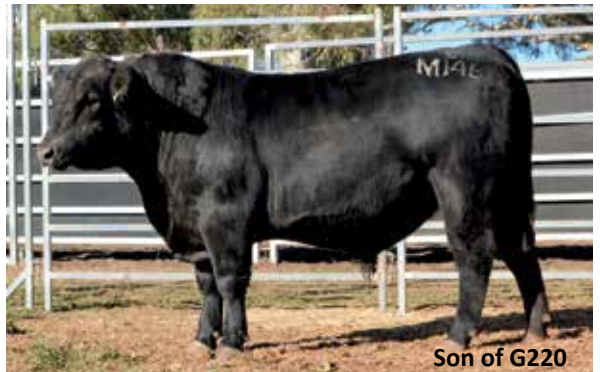
Son of G220

C A FUTURE DIRECTION 5321# ARDROSSAN DIRECTION W109 PV ARDROSSAN WILCOOLA Q71+95# SIRE: ARDROSSAN ADMIRAL A2 PV B/R NEW DESIGN 036# KENNY'S CREEK ROSEBUD W171# IMRAN ROSEBUD U17# G D A R TRAVELER 044# G A R GRID MAKER# G A R PRECISION 2536# DAM: LAWSONS GRIDMAKER Y1721# B/R NEW DESIGN 036# YTHANBRAE NEW DESIGN 036 V1018# YTHANBRAE N73+93#