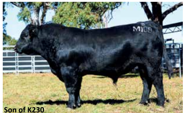
Son of K230

S A F FOCUS OF E R# MYTTY IN FOCUS# MYTTY COUNTESS 906# SIRE: A A R TEN X 7008 S A# S A V ADAPTOR 2213# A A R LADY KELTON 5551# H S A F LADY KELTON 504B# C A FUTURE DIRECTION 5321# BLACK DIAMOND DIRECTION Y309SV BLACK DIAMOND T.C. 365 ARCHER T8# DAM: DANCE DIRECTION Y309 E185# YTHANBRAE NEW DESIGN 036 V1035# DOUBLE D NEW DESIGN V1035 Y254# DOUBLE D PA36+94#