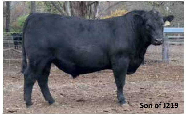
Son of J219