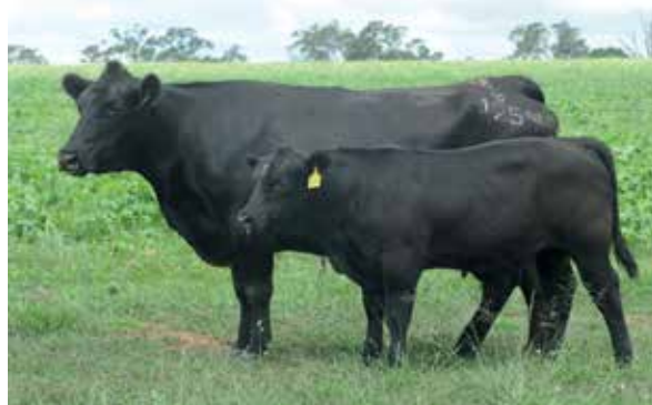
Mid February 2020 TransTasman Angus Cattle Evaluation

Birth Date: 5/09/2013 Genetic Status: AMFU,CAFU,DDFU,NHFU