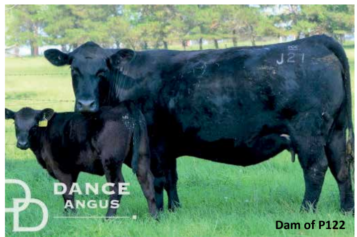
Dam of P122