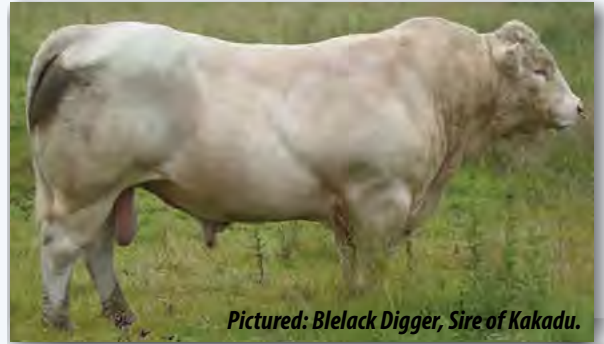
Pictured: Blelack Digger, Sire of Kakadu.