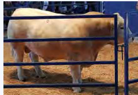
Palgrove Legend (PK L564E) - Son of Palgrove Hannibal