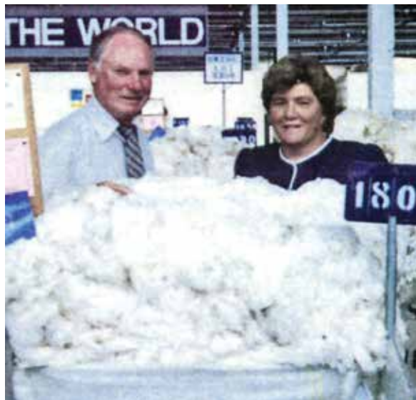
Dad and mum

karly morris DESIGNS www.karlymorrisdesigns.com.au