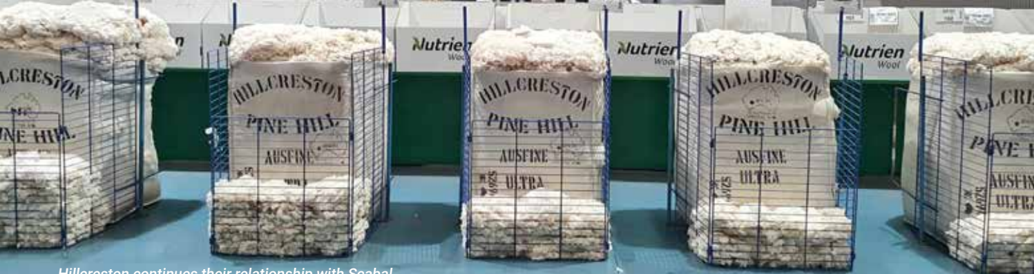
Hillcreston continues their relationship with Scabal, all finer micron wool is sold direct to the mill.