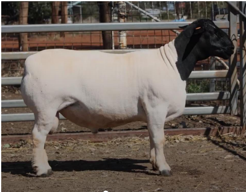
Ram pictured not in sale: