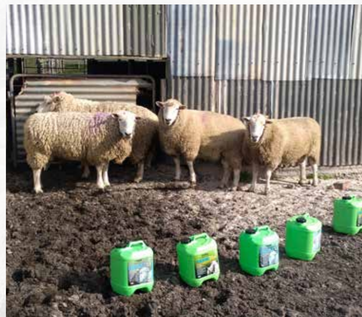
The top four "bomb proof" rams in our flock have said goodbye to drench

If you reflect on anthelmintic chemical use in sheep, prior to 1950 it was nicotine and tar, then white, clear, mectin and orange drenches. This took some natural resistance pressure off sheep for 50 years and all we are doing now is rebuilding their immune systems again.