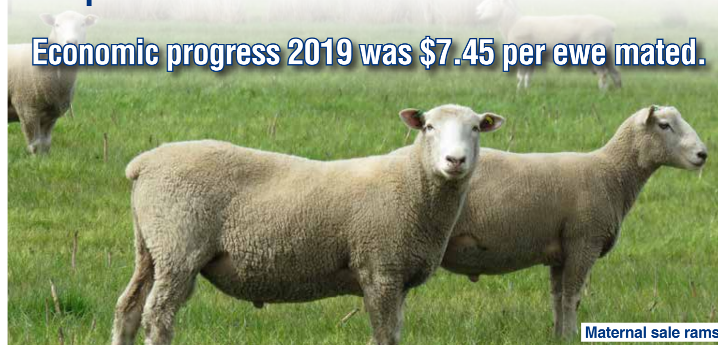
Maternal sale rams

Economic progress 2019 was $7.45 per ewe mated.