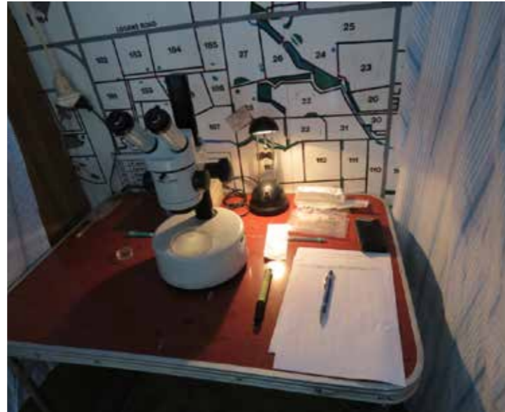
Counting embryos from the 8 best ewes selected from 3000 potential candidates, March 2020

We sorted through 3000 classed stud ewes and selected the best 8 on ASBV, type and structure to enter the embryo transfer program. Seventy five collected embryos then went into recipients which have had a high retention rate. Some of the 2019 embryo rams are in this years sale.