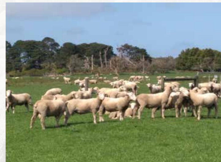
August 2019 Poll Dorset rams

Each year we do an AI program on our Terminal ewes and then use the best sons from the previous year as back up sires. We aim for rams that will suit the 22 kg carcass weight range but keep a close eye on birth weights. Our rams have proved very popular joined to Maternal ewe lambs for easy lambing.