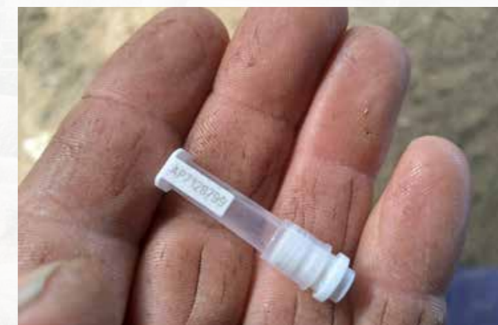
Tissue sampling unit for DNA collection

Genomics come into play here with their ability to link traits and build a better picture. The issue until recently has been that Maternal sheep have not had enough samples collected to create an effective reference population and for lowly heritable traits that is approximately 10,000 recent DNA samples.