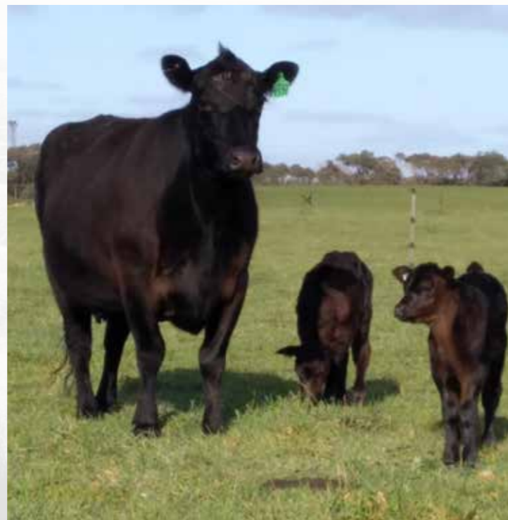
Cashmore Twinner cow Green 4339 and August 2020 drop twins

The herd has been entered on the American IGS data base of 20 million animals which can accommodate cross bred cattle and generates breeding values weekly.