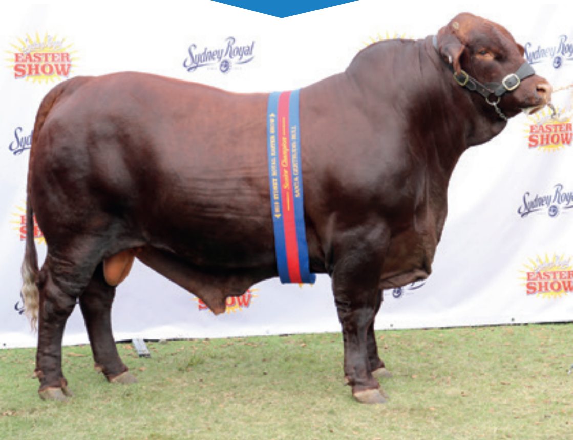
Nirvana N182 (PS) – Senior Champion Bull – Sydney Show

The preg test results will be available on the day