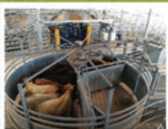
Automated cattle handling facility

With over 30 years experience servicing the livestock industry, Thompson Longhorn provides services including consultation, design, fabrication and installation.