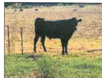
View Larger Image: 260.9kb

Identifier: CRIPN064 Sex: Male Tattoo: N064 Birth Date: 08/06/2017 Calving Year: 2017 Status: Active Registration Status: Herdbook Registered Grade: Purebred Horn: Polled Wagyu Blood%: 98.5 Colour: Black Genetic Test Status (Click for explanation): B3FU, CHSF, CL16FU, F1125% Sire: FOCONO K00139 Dam: AYRLIE PARK L0029 (AI) (ET) Breeder: COASTAL FARM SERVICES Current Owner: COASTAL FARM SERVICES Genotype for PV: SNP SNP #: 650858 Verified to Mating Gene Tests: CHS-Free, POLL_C-PcPc Progeny: None EBV Graph: [View]