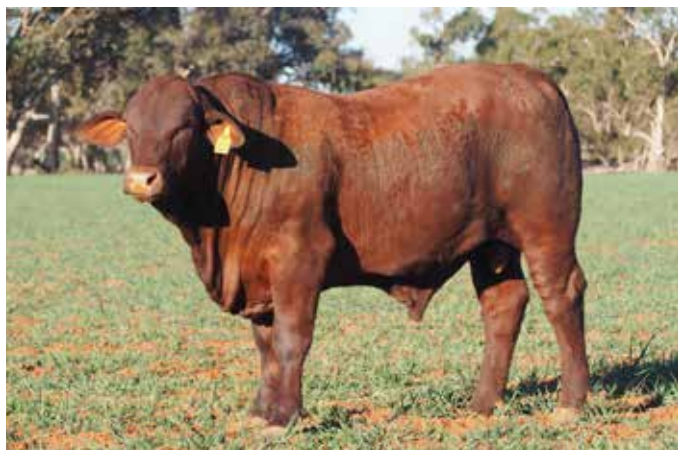
ROCKINGHAM NED (P) LOT 10