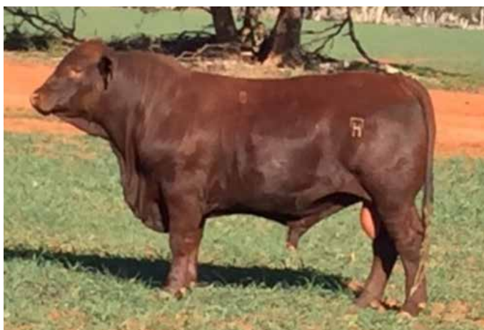
ROCKINGHAM NUGGET (P) LOT 25