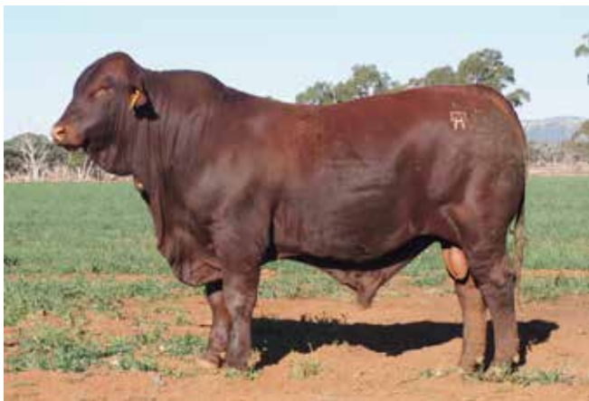
ROCKINGHAM NIGHT CAP (P) LOT 3