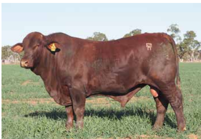
ROCKINGHAM NUGENT (PS) LOT 4