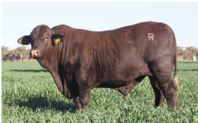
ROCKINGHAM NERO (P) LOT 2