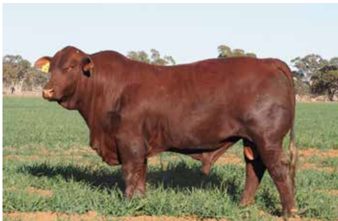
ROCKINGHAM NEPTUNE (PS) LOT 1