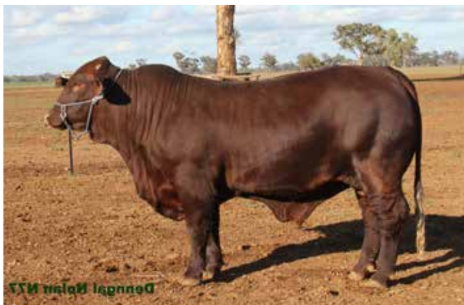
DENNGAL NOLAN (PS) LOT 17