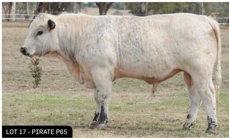
LOT 17 - PIRATE P65