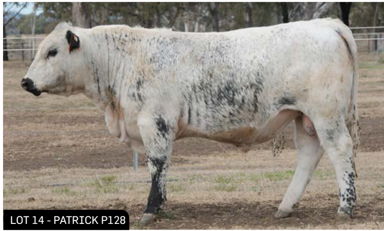
LOT 14 - PATRICK P128