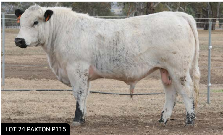
LOT 24 PAXTON P115