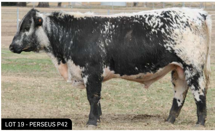
LOT 19 - PERSEUS P42