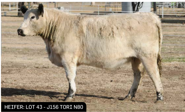
HEIFER: LOT 43 - J156 TORI N80