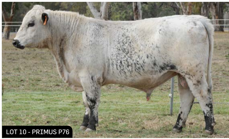
LOT 10 - PRIMUS P76