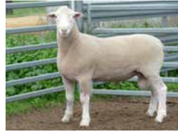
Bundara Downs 182708

Bwt : 0.28 Wwt : 11.3 Pwwt : 18.3 Pfat : 0.8 Pemd : 3.7 TCP : 162.1 Carcase + : 230