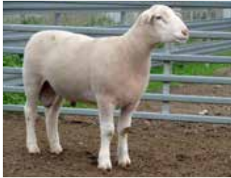
Bundara Downs 182596

Bwt : 0.34 Wwt : 11.6 Pwwt : 19.2 Pfat : -0.3 Pemd : 2.6 TCP : 157.7 Carcase + : 227