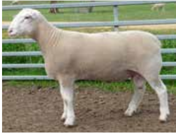
Bundara Downs 181596

Bwt : 0.34 Wwt : 11.6 Pwwt : 19.2 Pfat : -0.3 Pemd : 2.6 TCP : 157.7 Carcase + : 227