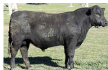
LOT 66. P264 Command x Hallmark