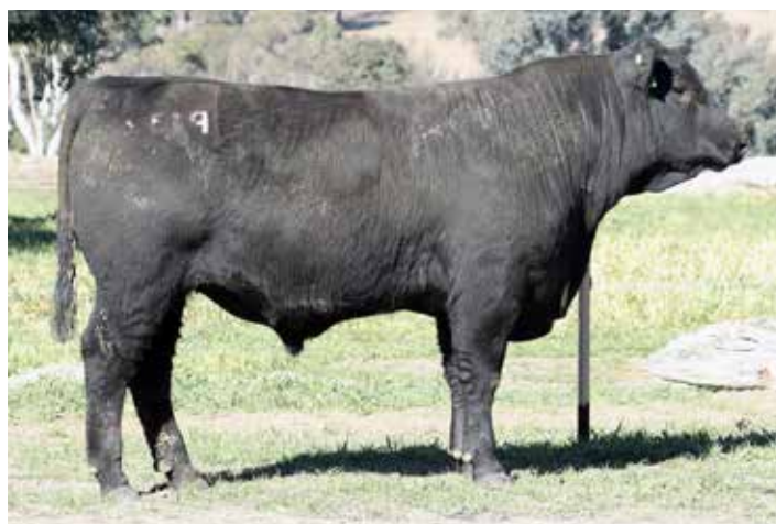
LOT 25. BEN NEVIS POWERPLAY P131 (see page 18)