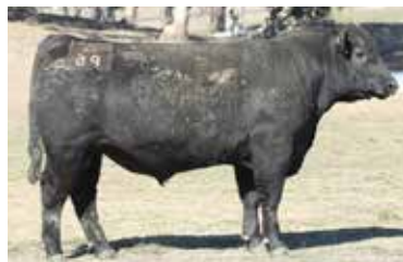
LOT 35. P6 Hallmark x Raff Empire