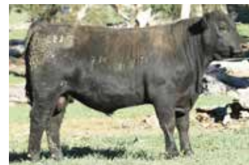
LOT 20. P133 Profit x Dal Johno