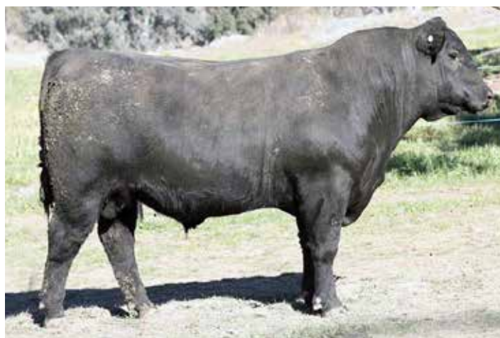
LOT 29. BEN NEVIS PROFESSIONAL P64 ET (see page 18)