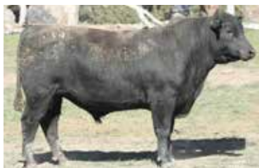
LOT 54. P75 Command x Raff Empire ET