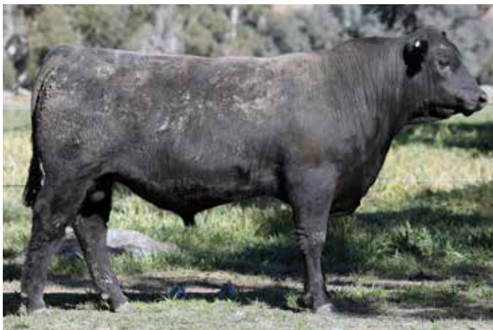
LOT 39. BEN NEVIS PATCH P208