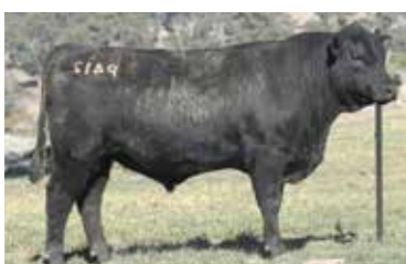
LOT 59. P412 Proceed x Stewie