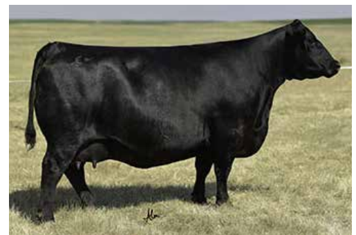
Baldrige Isabel Y69 – Dam of Baldrige Beast Mode and Baldrige Compass.