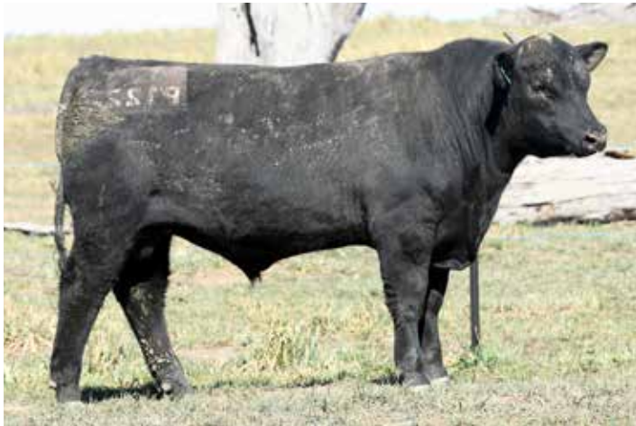
LOT 38. BEN NEVIS PRIME P122