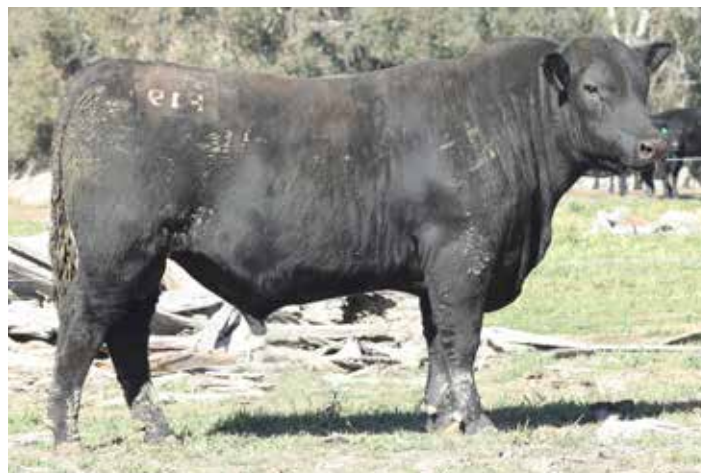
LOT 14. BEN NEVIS PERENNIAL P19