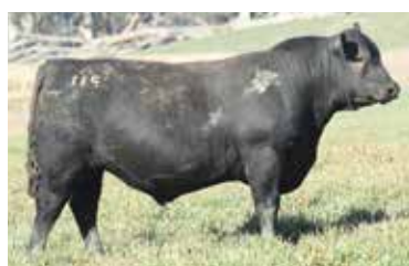
LOT 10. P11 Compass x Empire ET