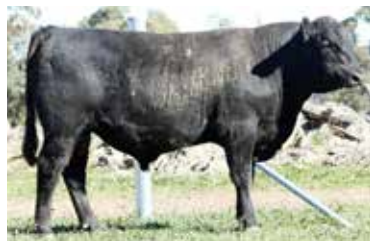
LOT 43. P180 Compass x MM D78