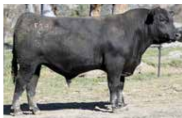
LOT 48. P77 Command x Raff Empire ET