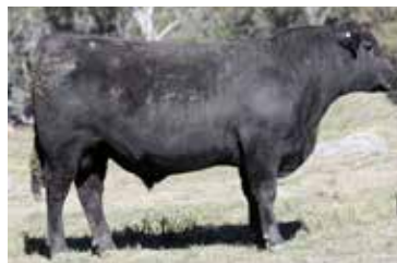
LOT 19. P183 Lionheart x Poss Impact