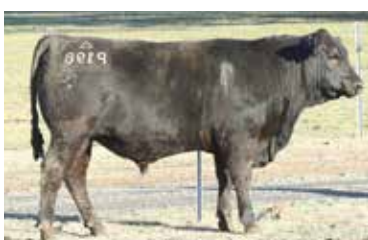
LOT 72. P198 Monarch x Bartel