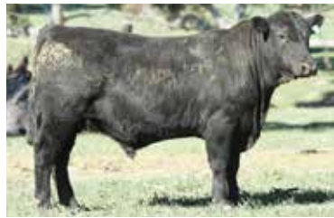
LOT 26. P132 Judo x BN Jabba