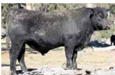
LOT 63. P417 Stewie x Stewie