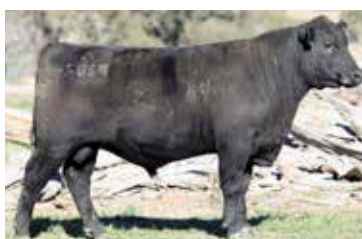
LOT 65. P202 Command x BN Jabba