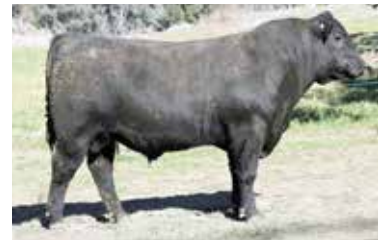
LOT 29. P64 Unanimous x BN Frontrow ET