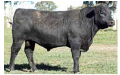
LOT 41. P102 Profit x Braveheart