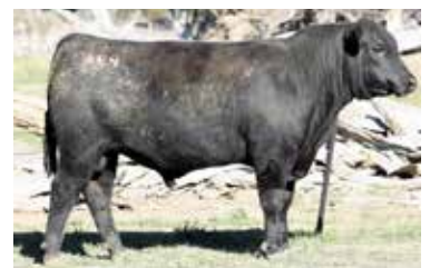
LOT 49. P94 Command x BN Front Row