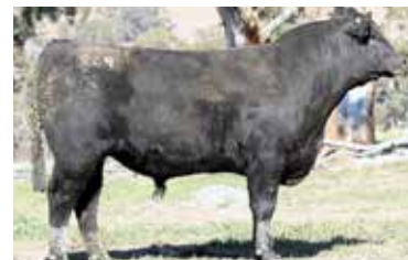
LOT 53. P39 Hallmark x Ayrvale Bartel