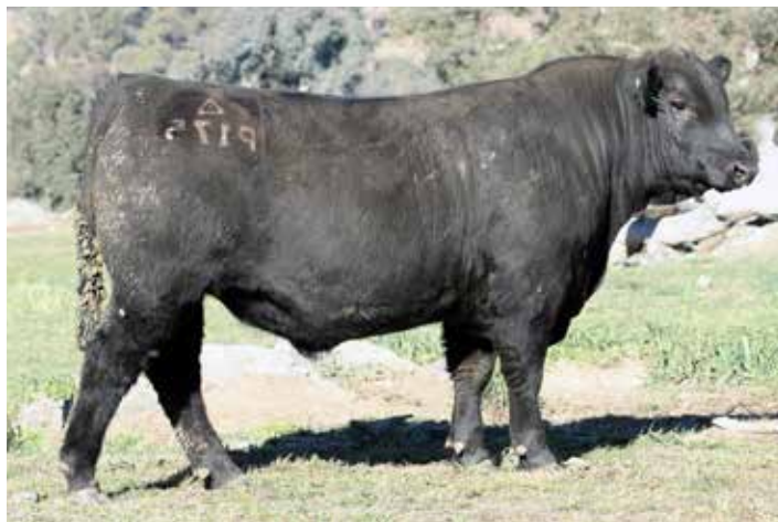
LOT 67. BEN NEVIS PILOT P175 (see page 33)