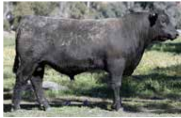
LOT 39. P208 Beast Mode x Ayrvale Bartel