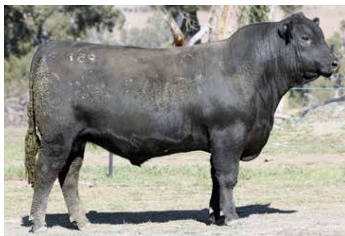
LOT 11. BEN NEVIS PRIMUS P57 ET