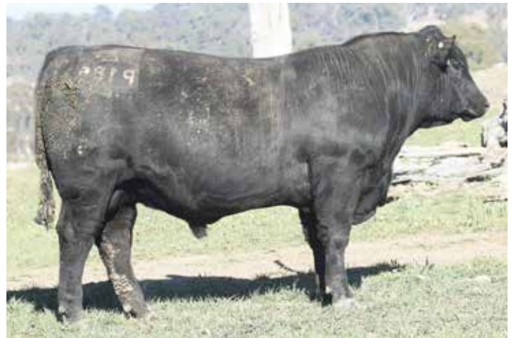
LOT 5. BEN NEVIS PORSCHE P186