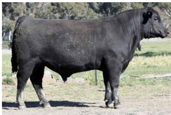
LOT 50. BEN NEVIS PRISM P93