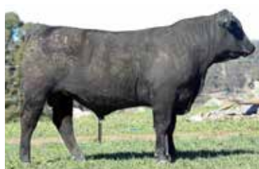
LOT 17. P265 Command x Jacks Joker