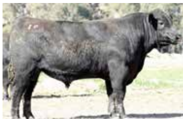
LOT 52. P1 Hallmark x Comrade ET