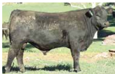
LOT 2. P360 Command x BN Gamemaker