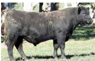
LOT 68. P108 Command x Jacks Joker