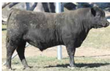
LOT 46. P368 Beast Mode x BN Bruiser