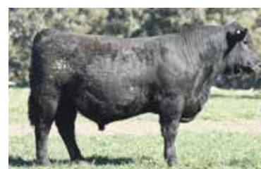
LOT 74. P163 Lionheart x Raff Empire