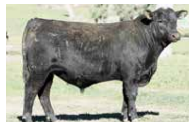
LOT 57. P369 Ascot Global x BN Bruiser