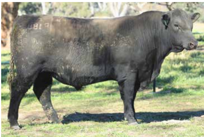
LOT 3. BEN NEVIS PRESTIGE P188