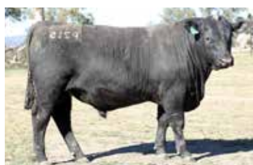
LOT 22. P215 M Proceed x BN Frontier