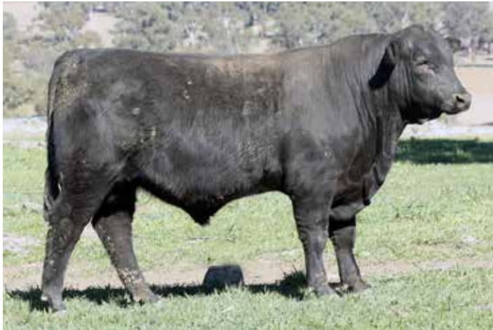
LOT 60. BEN NEVIS PROCREATE P168 (see page 31)