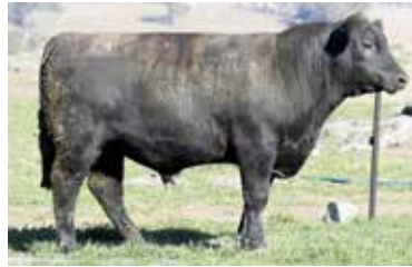
LOT 31. P50 Command x Jacks Joker