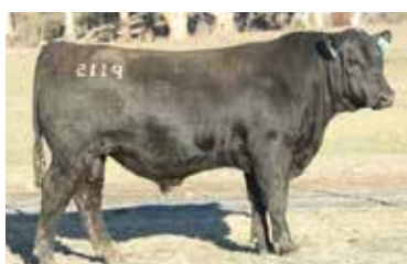
LOT 71. P115 Judo x Hallmark