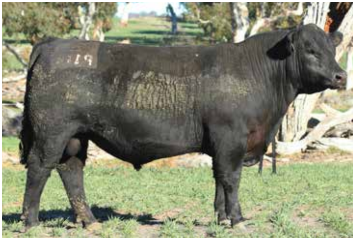
LOT 1. BEN NEVIS PREMISE P114