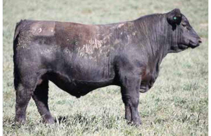
LOT 7. BEN NEVIS PURE BEAST P160 (see page 12)