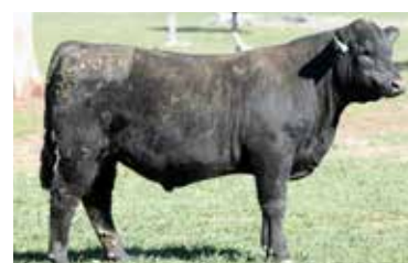
LOT 61. P209 Command x BN Kibah