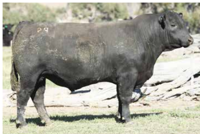
LOT 10. BEN NEVIS PERFECTION P11 ET (Full ET brother of Lot 9)