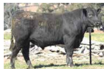
LOT 16. P69 Hallmark x Crusader