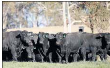
STANDOUT: This years sale includes some of the first Baldrige Beast Mode bulls in the country, a breed leader for growth, marbling and doing ability off grass.

According to Erica Halliday, "it makes sense as sending over-fed, two-year-olds out to work for the first time is like sending a sumo wres-