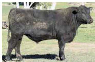
LOT 47. P193 Lionheart x BN Hooligan