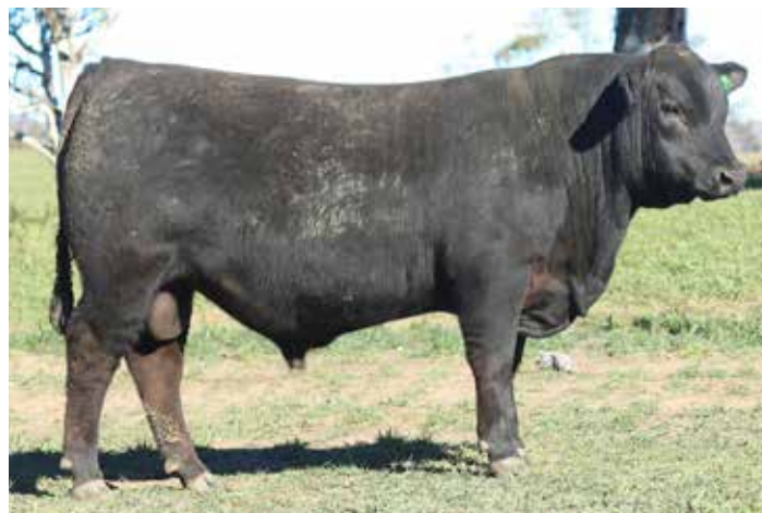
LOT 18. BEN NEVIS PANTHER P177 (see page 16)