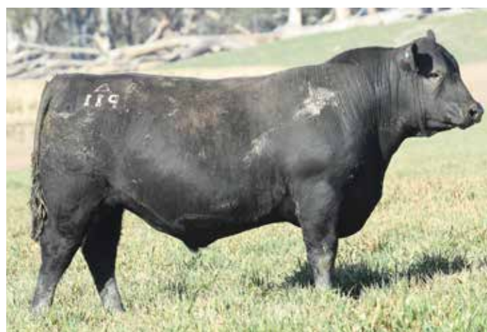
LOT 9. BEN NEVIS PINNACLE P9 ET (Full ET brother of Lot 10)