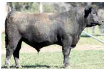
LOT 56. P78 Lionheart x BN Eritrea