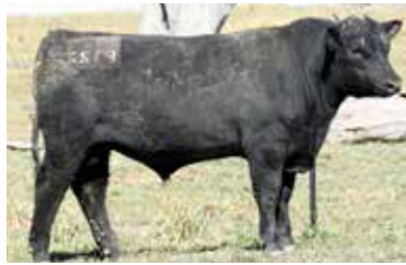
LOT 38. P122 Beast Mode x Ayrvale Bartel