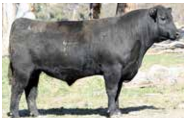
LOT 51. P81 Unanimous x BN Frontrow ET