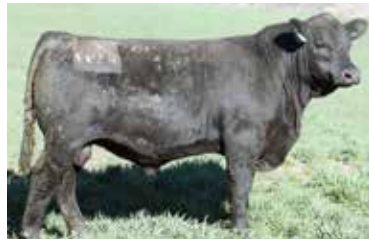
LOT 40. P197 Prophet x Infinity