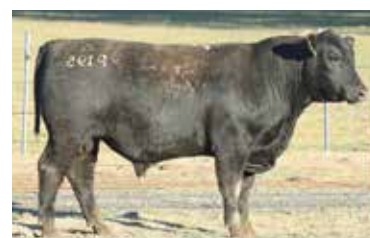
LOT 70. P195 Judo x Jacks Joker