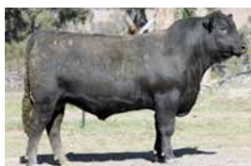
LOT 11. P57 Proceed x BN Frontrow ET