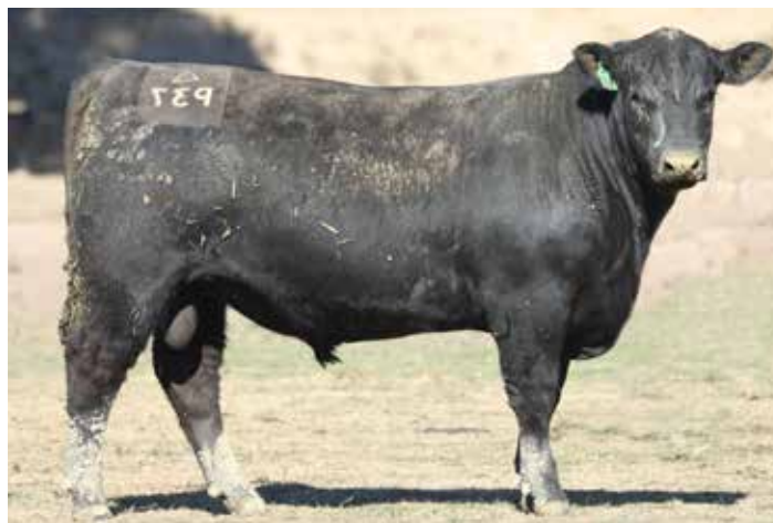
LOT 12. BEN NEVIS PROPOGATE P37 (see page 14)