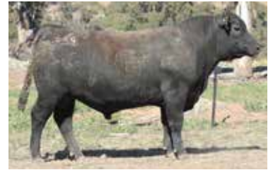
LOT 33. P48 Command x BN Judo