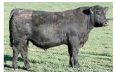
LOT 45. P205 Beast Mode x Jacks Joker