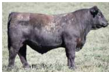
LOT 7. P160 Beast Mode x BN Frontrow