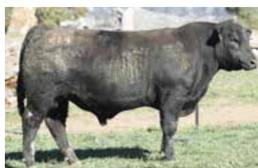
LOT 13. P16 Command x Right Way