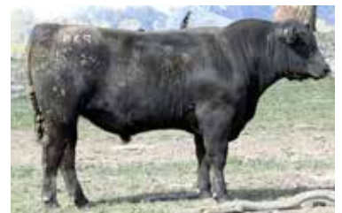
LOT 37. P38 Lionheart x Ayrvale Bartel