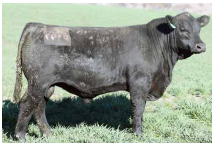
LOT 40. BEN NEVIS PROFITATEER P197