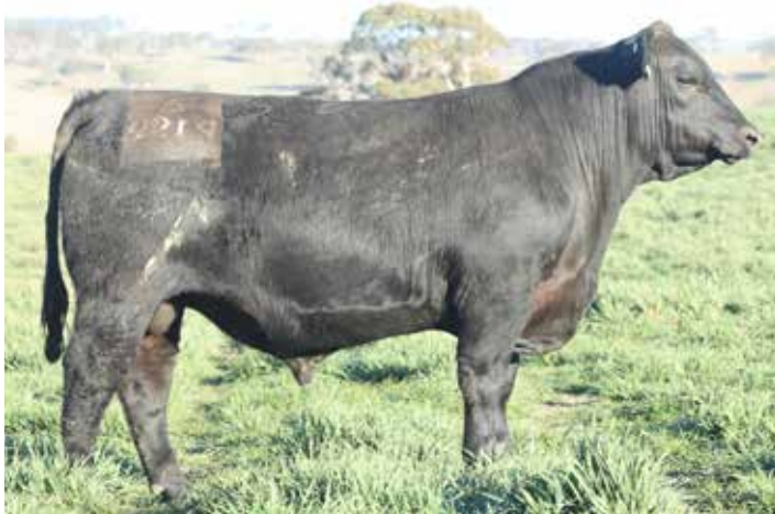
LOT 6. BEN NEVIS POWDERKEG P199 (see page 12)