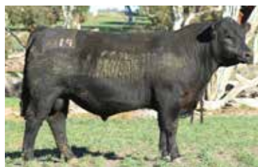
LOT 1. P114 Command x BN Frontrow