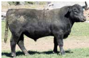
LOT 42. P201 Command x Jacks Joker