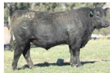
LOT 4. P242 Lionheart x Bartel