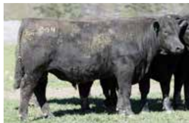
LOT 36. P65 Hallmark x Crusader