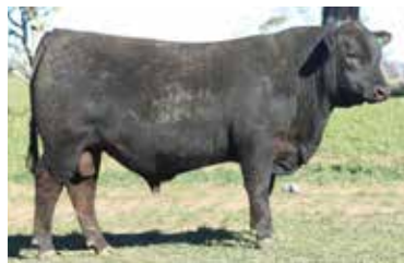
LOT 18. P177 Lionheart x MMD78