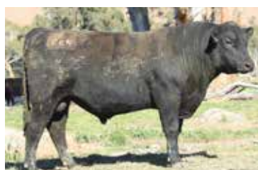
LOT 15. P35 Lionheart x MM D78