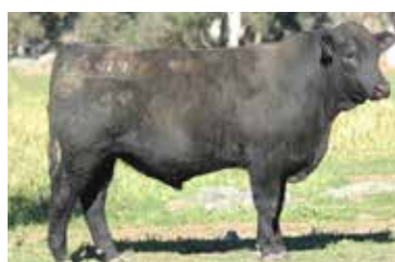
LOT 23. P189 M Realty x BN Gmaker