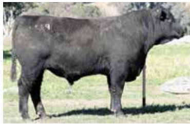
LOT 25. P131 Judo x BN Jabba