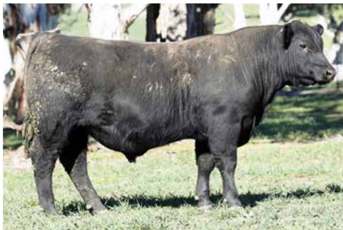
LOT 68. BEN NEVIS PREHISTORY P108 (see page 33)