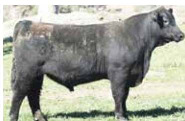
LOT 21. P259 Prophet x B Dandy