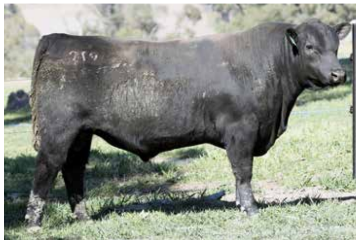
LOT 30. BEN NEVIS PROXY P70 ET