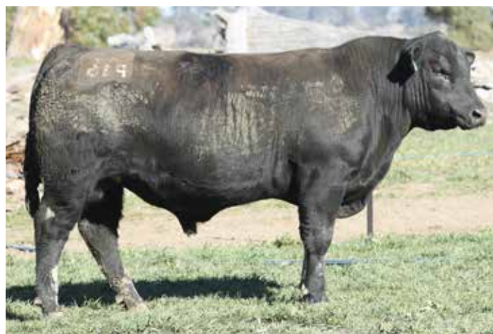
LOT 13. BEN NEVIS PIRATE P16