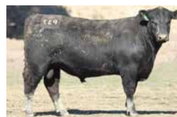
LOT 12. P37 Command x MMD78