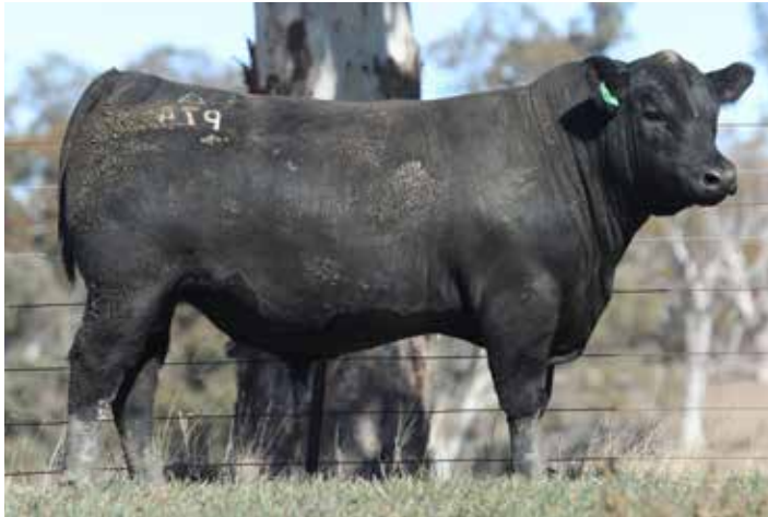
LOT 55. BEN NEVIS POWERSURGE P74 ET