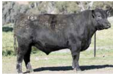
LOT 28. P61 Unanimous x Crusader ET