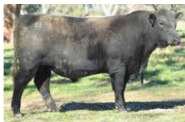
LOT 3. P188 Lionheart x BN Gamemaker