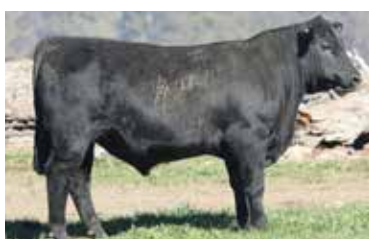
LOT 58. P230 Prophet x B Zealful