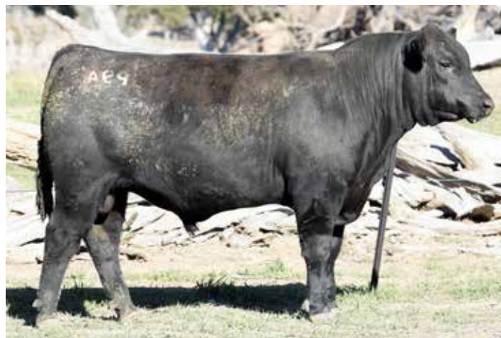
LOT 49. BEN NEVIS PERIDOT P94