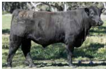
LOT 44. P137 M Realty x Comrade