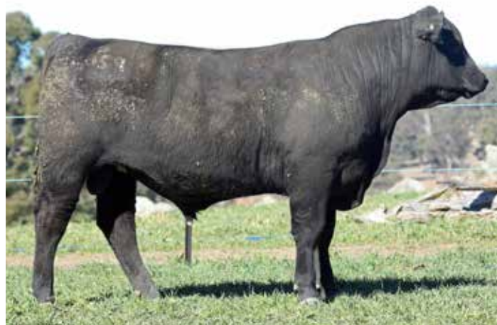
LOT 17. BEN NEVIS PROMETHEUS P265