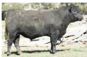
LOT 9. P9 Compass x Empire ET