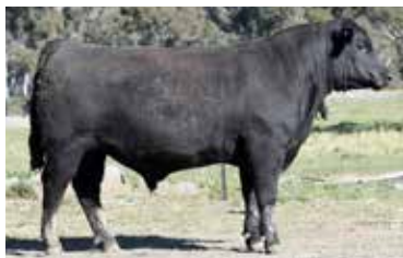
LOT 50. P93 Command x BN Frontrow