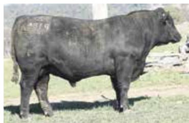
LOT 5. P186 Lionheart x Bartel