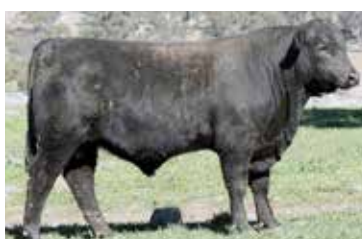
LOT 60. P168 M Realty x BN Dino