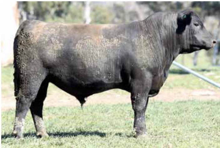
LOT 56. BEN NEVIS POUNDMAKER P78 ET