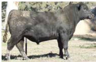
LOT 34. P51 Command x BN Judo