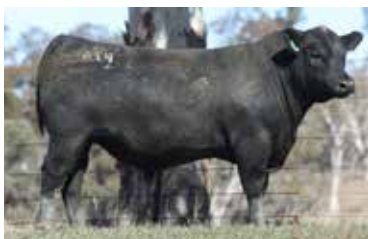
LOT 55. P74 Command x Raff Empire ET