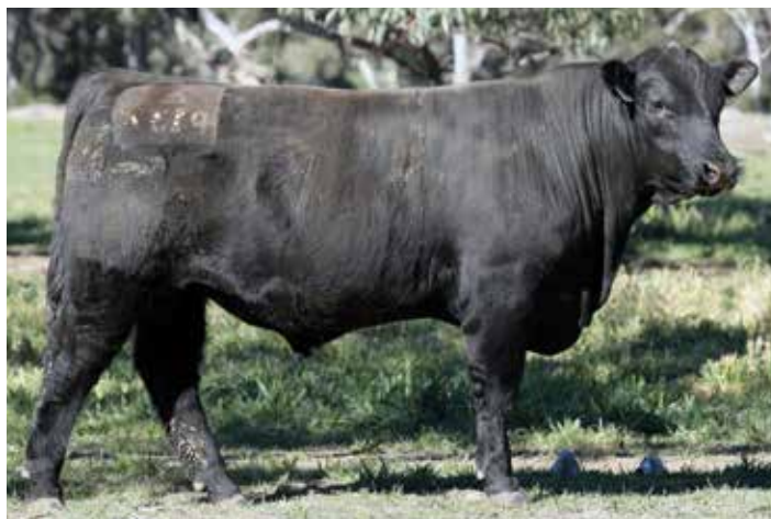
LOT 44. BEN NEVIS PREMIER P137