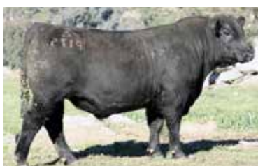
LOT 67. P175 Lionheart x Poss Impact