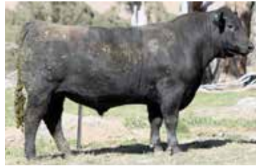
LOT 32. P47 Command x BN Hooligan