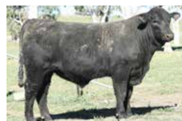
LOT 24. P223 M Realty x BN Eritrea