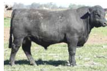
LOT 8. P212 Beast Mode x BN Bruiser