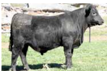
LOT 73. P236 Prophet x Raff Empire