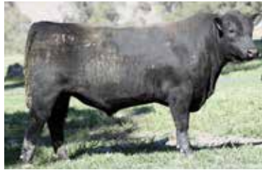
LOT 30. P70 Unanimous x BN Frontrow ET