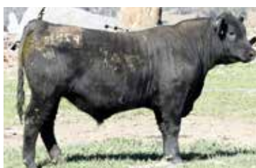
LOT 69. P251 Monarch x Ayrvale Bartel