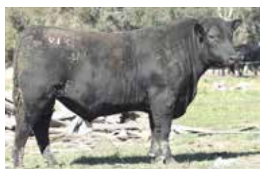
LOT 14. P19 Hallmark x Infinity