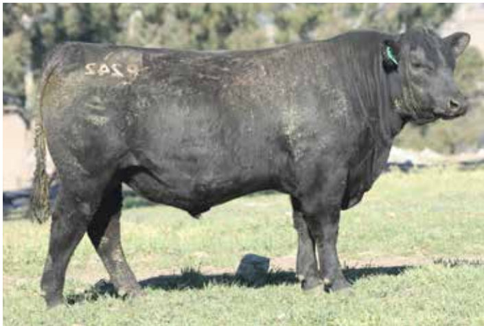
LOT 4. BEN NEVIS PODIUM P242