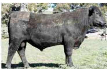
LOT 62. P225 Beast Mode x BN Xerox