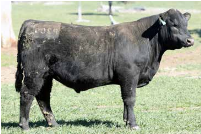
LOT 61. BEN NEVIS PATENT P209