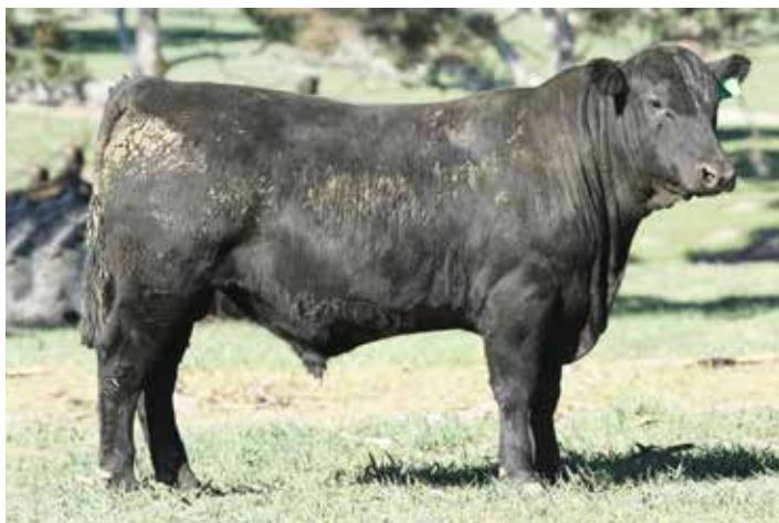
LOT 26. BEN NEVIS PRIMAL P132 (see page 18)