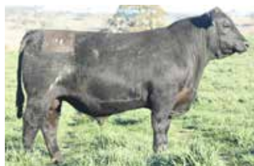
LOT 6. P199 Beast Mode x Bartel