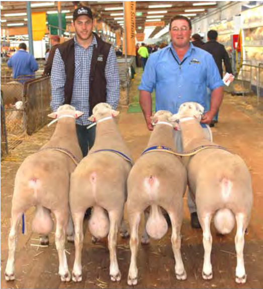
Anden White Suffolks winning the Lamb Production Class for Trade and the Lamb Production Class for Export at the 2015 Royal Adelaide Show.