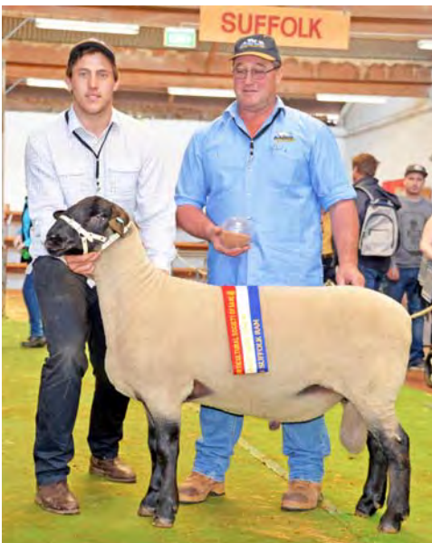
Kerangie 150530 2016 Royal Adelaide Show – Grand Champion Suffolk Ram.