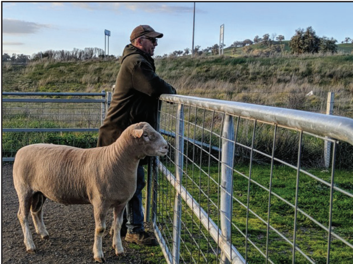
One has been retained as a sire - the other is for sale