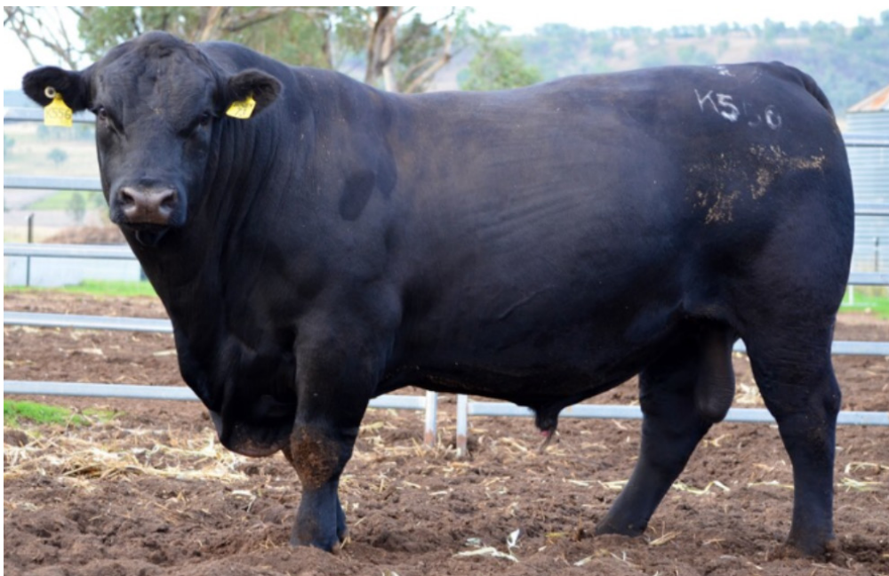
PEAKES GABBA K556