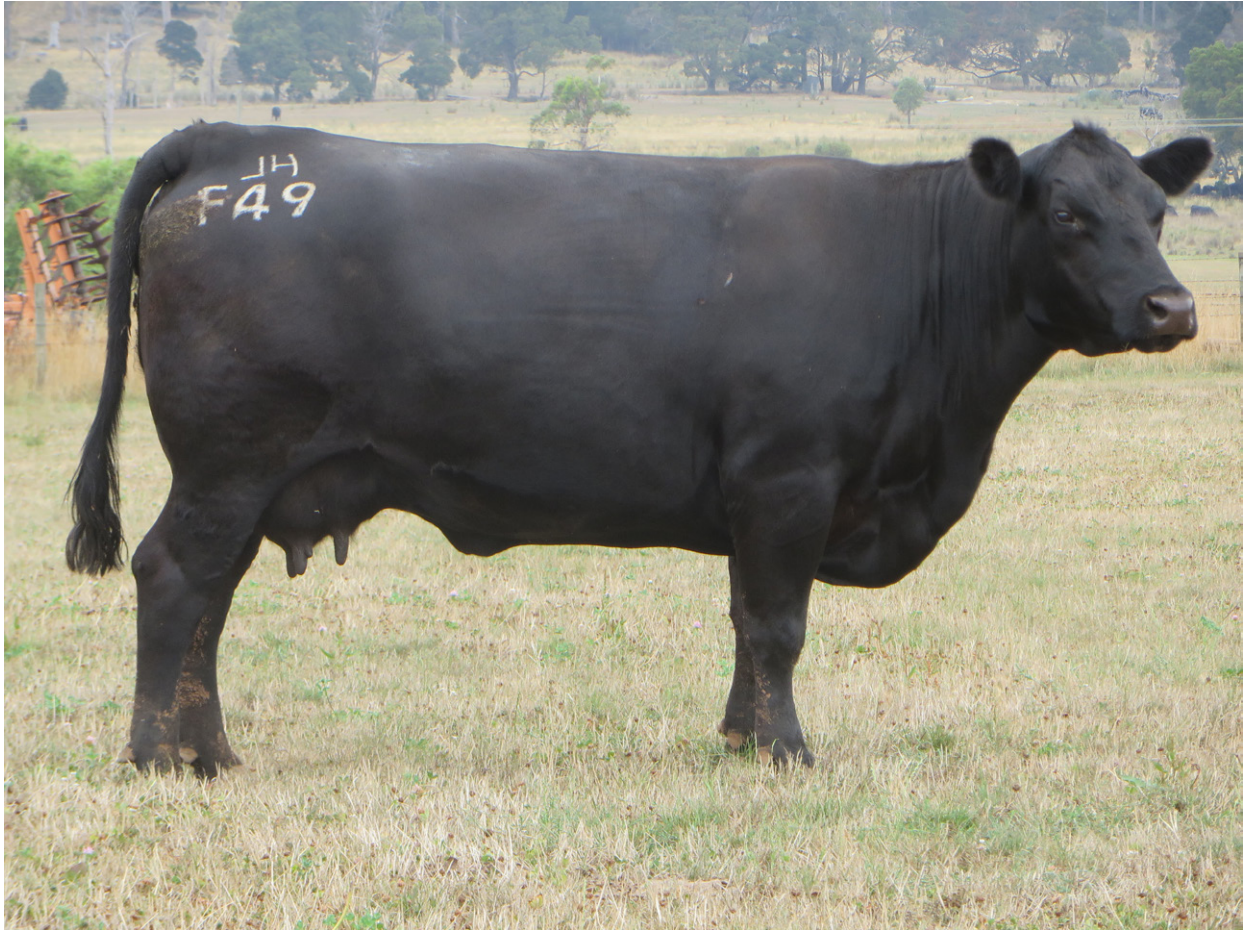
The infamous Frannie F49. Our most favoured female.