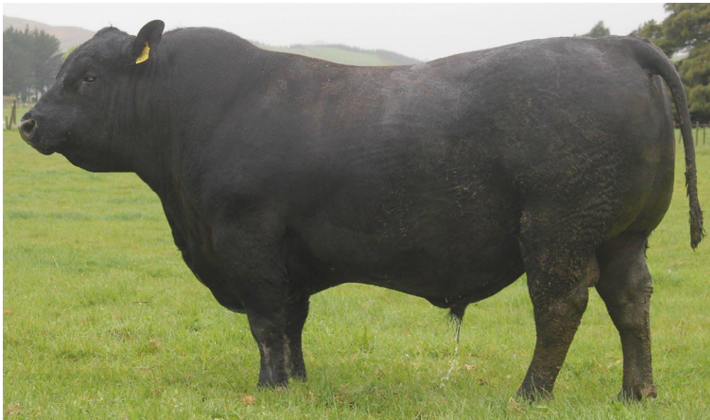
MERCHISTON STEAKHOUSE 489