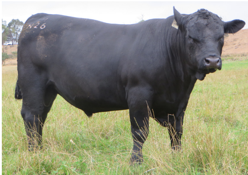
LOT 1: TLHN26