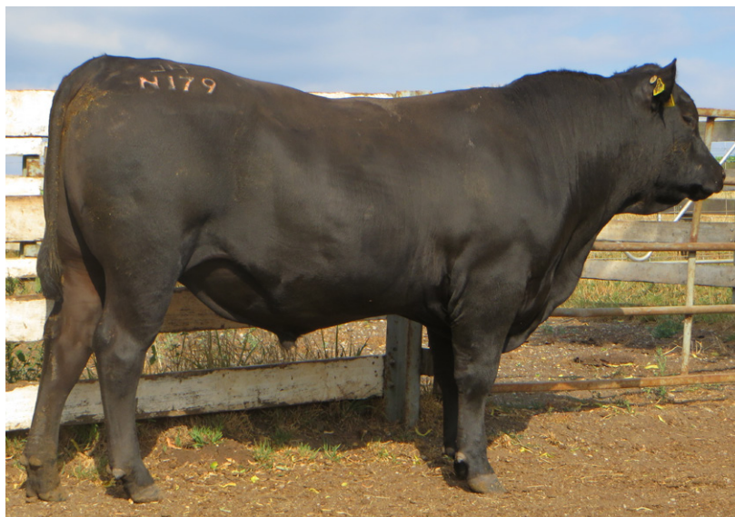
LOT 16: TLHN179