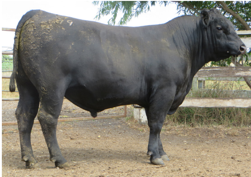
LOT 12: TLHN79