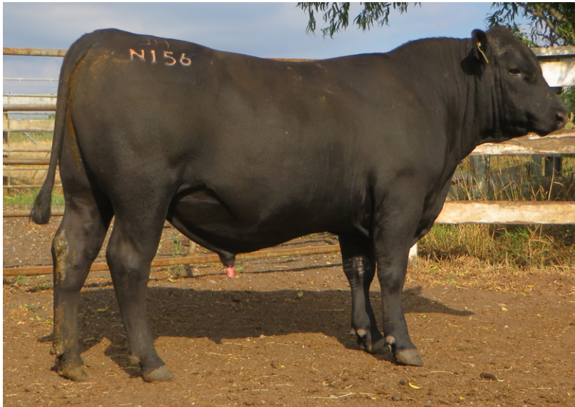
LOT 42: TLHN156