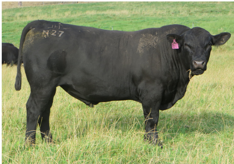
LOT 9: TLHN27