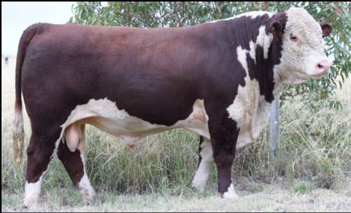
OAK DOWNS LOT 20