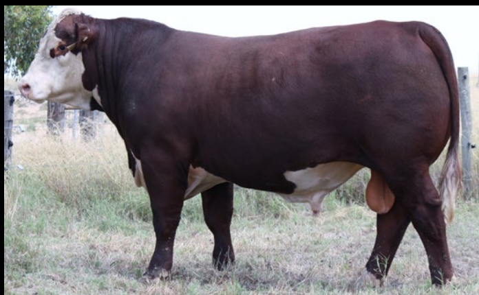
OAK DOWNS LOT 9