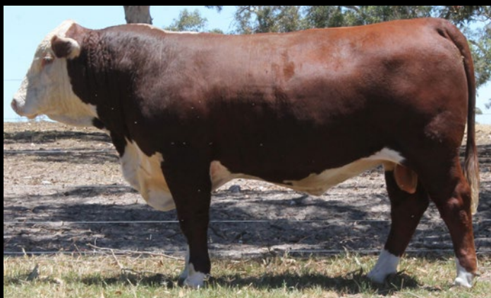
KERLSON PINES LOT 1