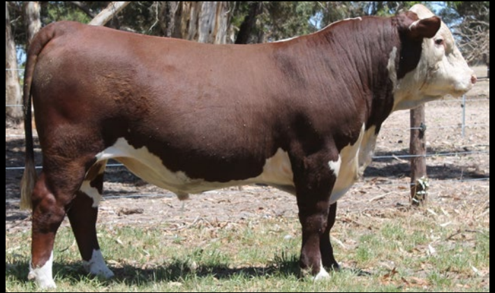
KERLSON PINES LOT 13