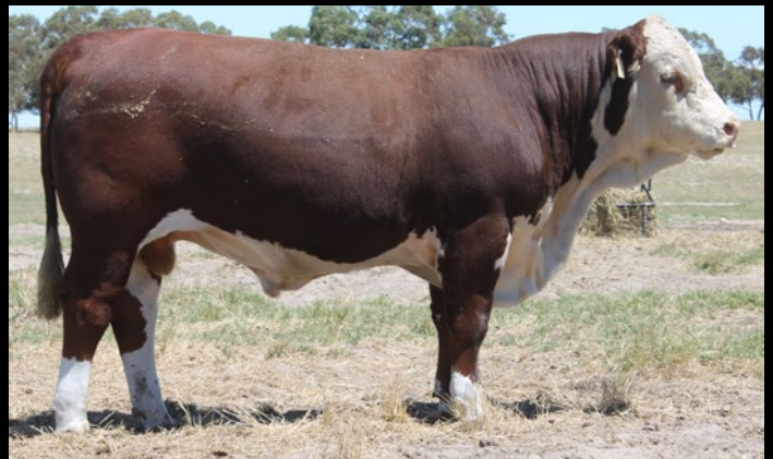
KERLSON PINES LOT 37