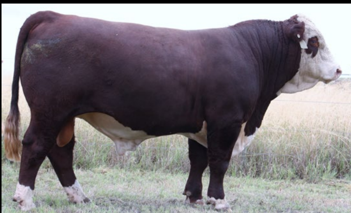
OAK DOWNS LOT 23