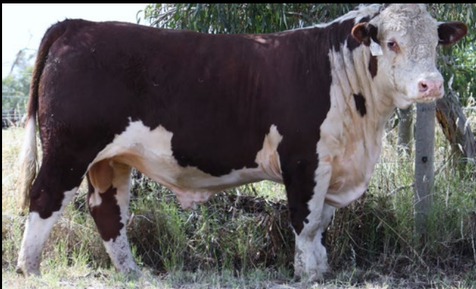
OAK DOWNS LOT 21