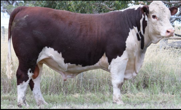
OAK DOWNS LOT 10