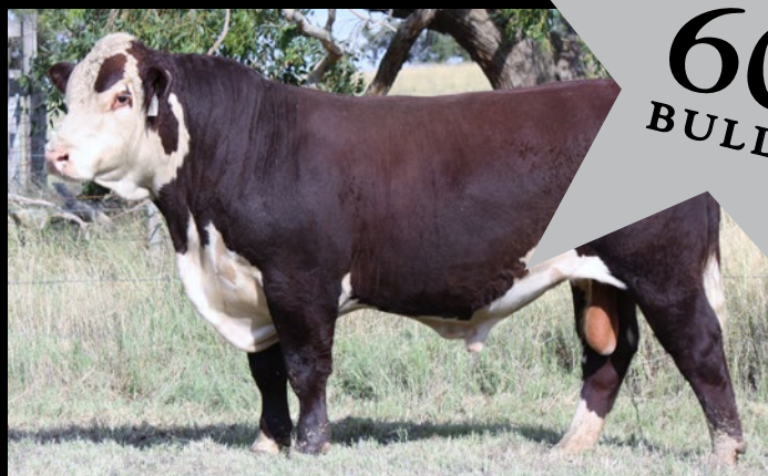
OAK DOWNS LOT 12