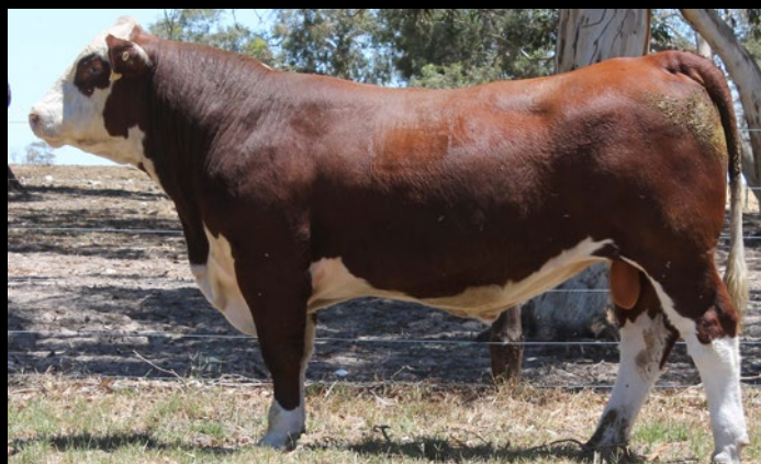
KERLSON PINES LOT 15