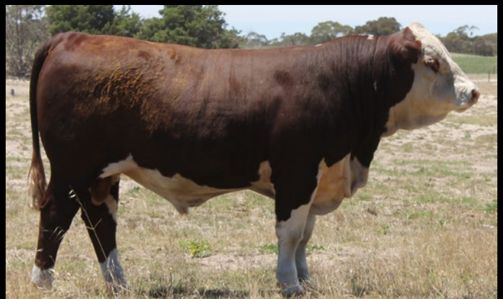
KERLSON PINES LOT 17