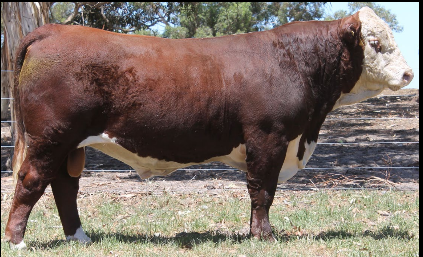
LOT 14 KERLSON PINES NIGHTCAP N010