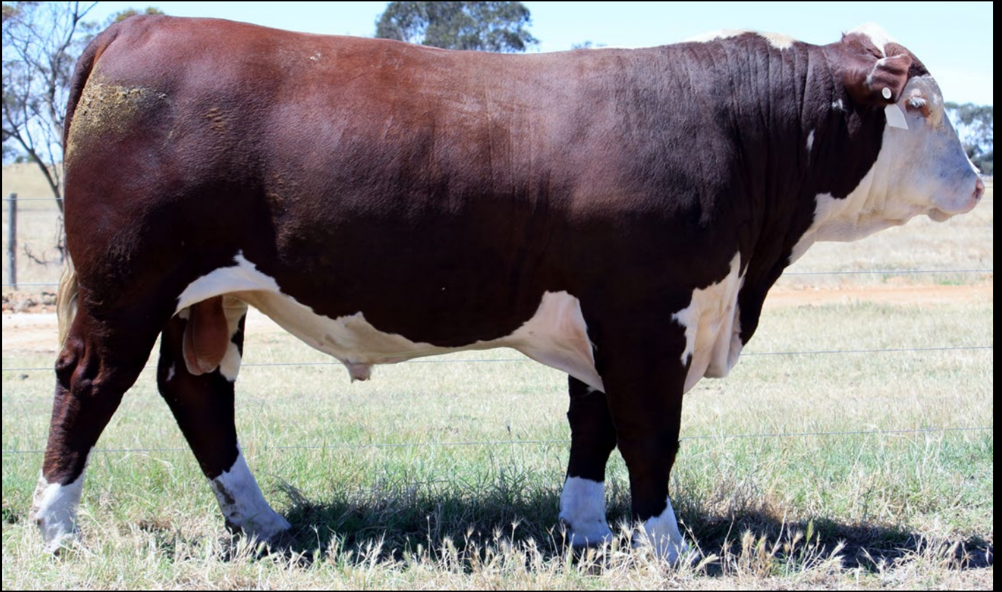
LOT 7 OAK DOWNS NAMBROK N15