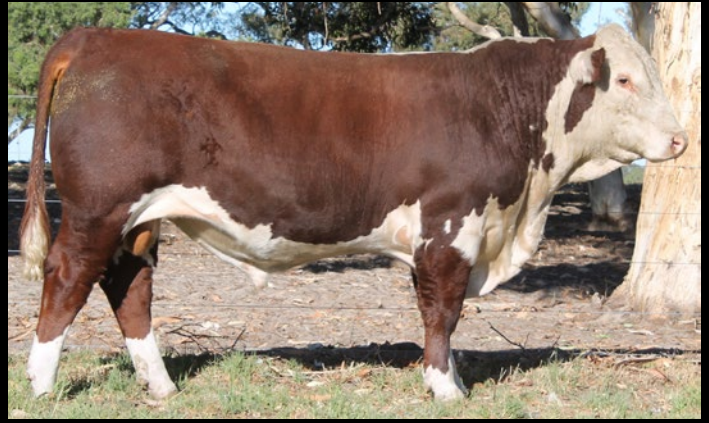
KERLSON PINES LOT 2