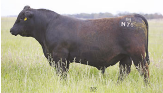
Lot 5 Granite Ridge Nuclear N76