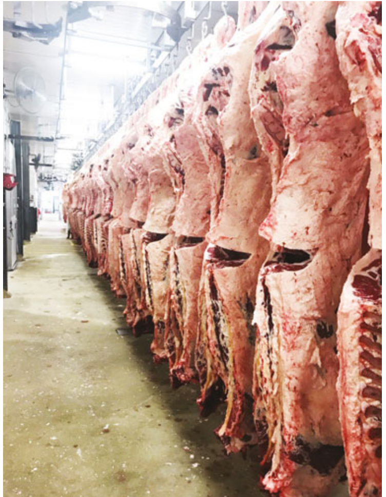
Some of the 100 carcasses Yielding 64% Carcass Weight

We would like to thank Alan and Coralee Gillogly of Montrose Feedlot and their team for their loyal support by buying our steers and for supplying feedback that has proven our high-quality results.