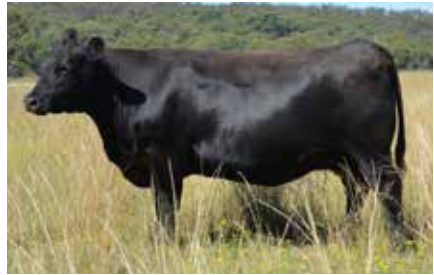
BURNETTE FAMILY Trio Burnette D42