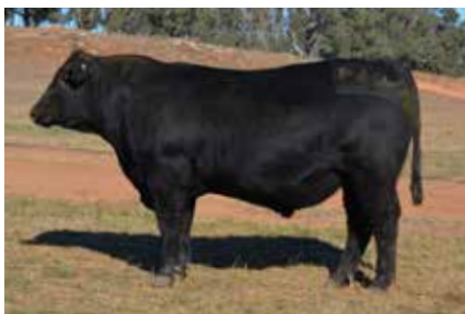
LOT 4 P48