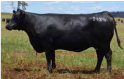
WAGON FAMILY Kansas Wagon J125