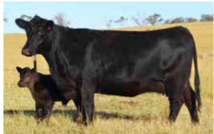
QUAIL FAMILY Trio Quail G9