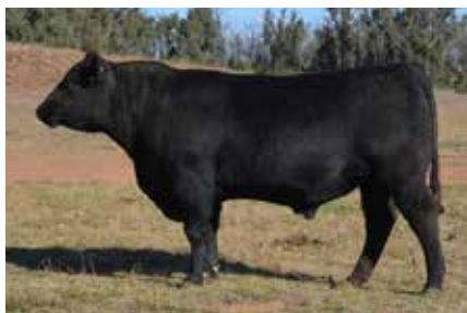
LOT 3 P2