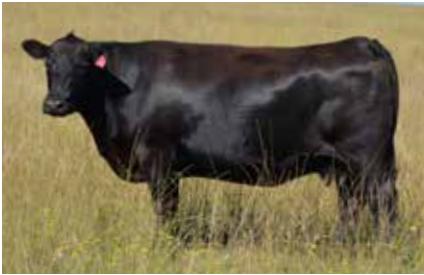
EXPENSIVE FAMILY Trio Expensive E63