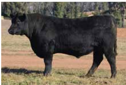
LOT 2 P9