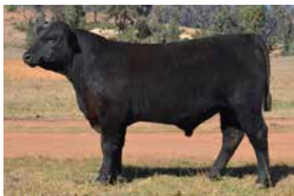
LOT 27 P65