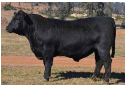
LOT 16 P3