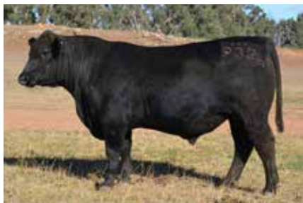
LOT 1 P32