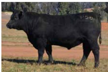
LOT 10 P56