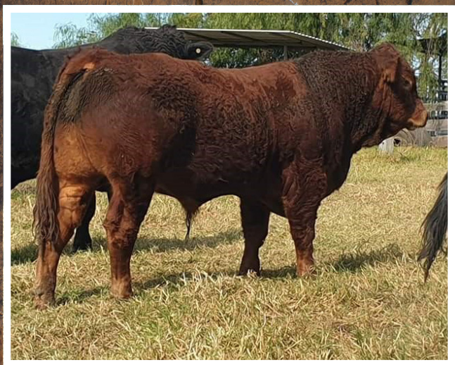
LOT 10 RYRADAN PARK PHOENIX P1