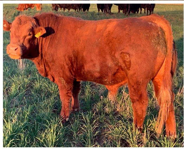
LOT 17 HARLEES JOCK N34