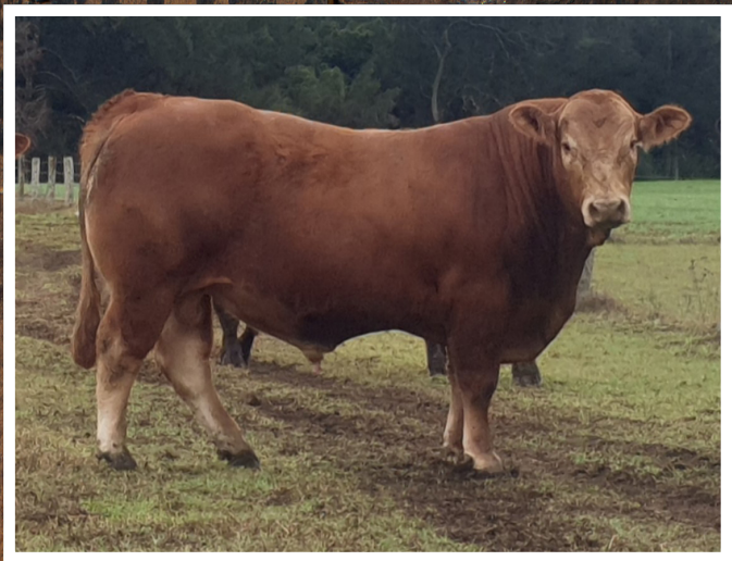
LOT 9 WARRIGAL NIGHT RIDER N12