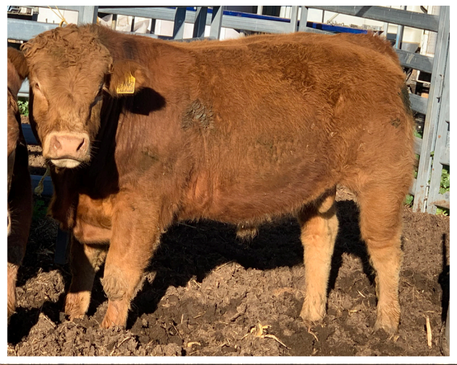
LOT 11 HARLEES WESTWOOD N47