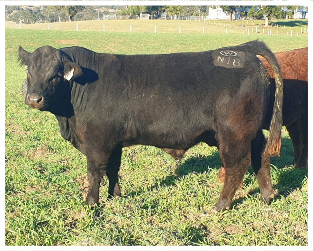
LOT 15 WARRIGAL NIGHTVISION N18