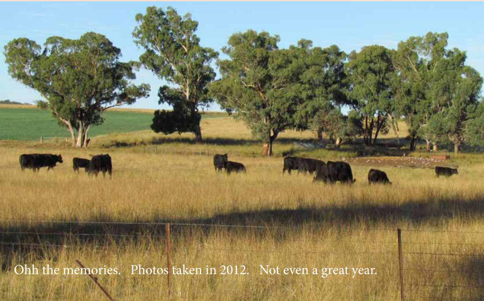
Ohh the memories. Photos taken in 2012. Not even a great year.

DSK Kracker K21 that we kept for his immense spring of rib & huge ema along with beautiful length of spine & neck extension. Also the fact that we rarely get a Panda son or daughter that doesn't produce outstanding progeny. Kracker is no exception with some real outstanding sires in the draft. Big, robust & heavy.