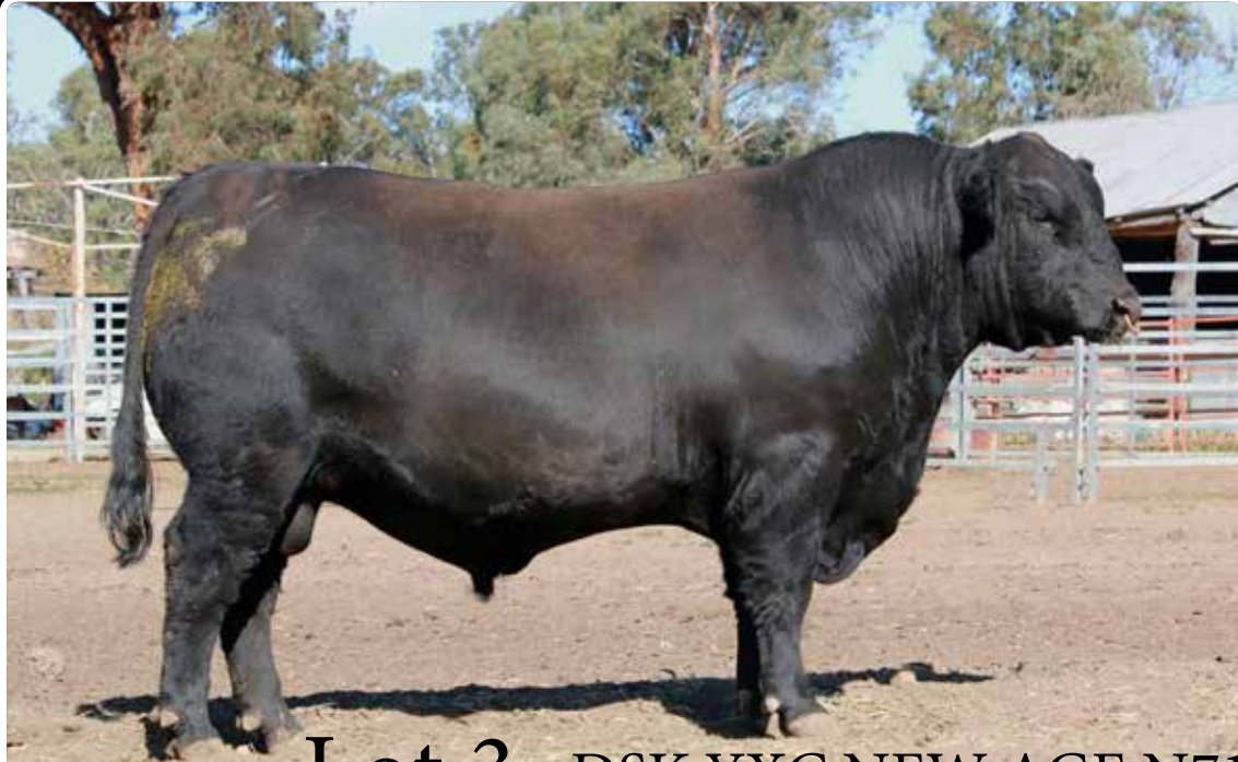
Lot 3; DSK YXC NEW AGE N71