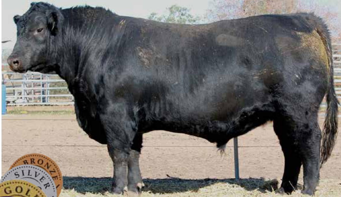
Lot 11; DSK RR NOVAK N92