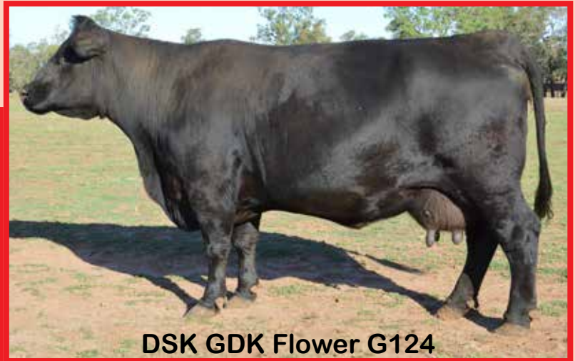
DSK GDK Flower G124 Dam of Lot 6 & Lot 36

Upward is the standard for performance by which all other bulls are measured in the Angus breed. Upward progeny are big, powerful, growthy cattle that make breeding cattle fun and feeding cattle profitable. The original performance powerhouse, Upward is a household name amongst cattle producers worldwide with most widely used sires & dams today having this great bull in the pedigree.