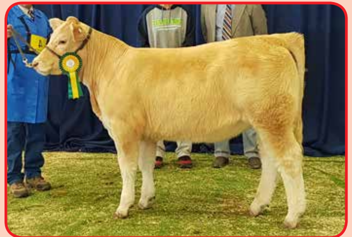
DSK WML Beatrix N50E Reserve Intermediate Champ. Female 2019 Charolais National Showcase. Sired by Winn Manns Lanza 610S