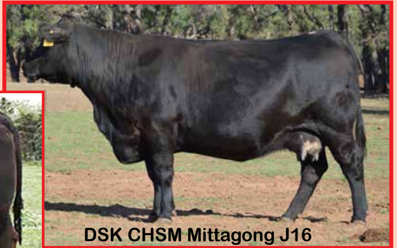
DSK CHSM Mittagong J16 Dam of Lot 4