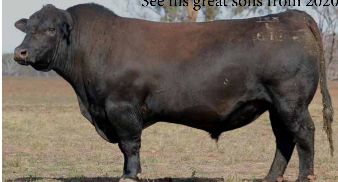
DSK STUD SIRE PURCHASED FOR $56,000