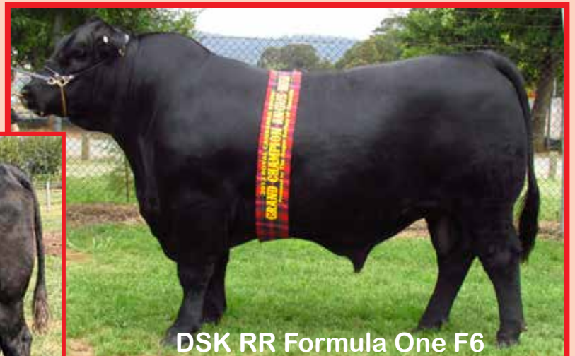
DSK RR Formula One F6 Sired by Remital H Rachis out of dam DSK Z10 Flower C151 Grand Champion Canberra Royal 2012 & sold for $20,000