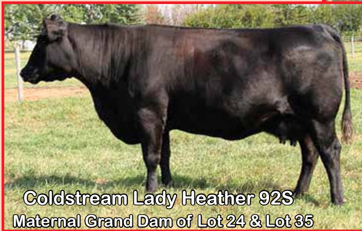
Coldstream Lady Heather 92S Maternal Grand Dam of Lot 24 & Lot 35 Our first Canadian Donor Dam