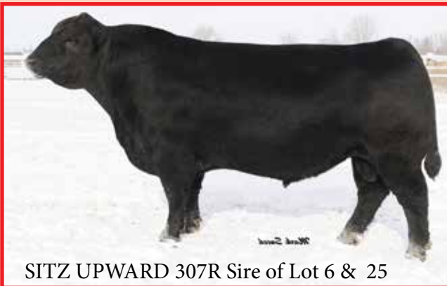
SITZ UPWARD 307R Sire of Lot 6 & 25