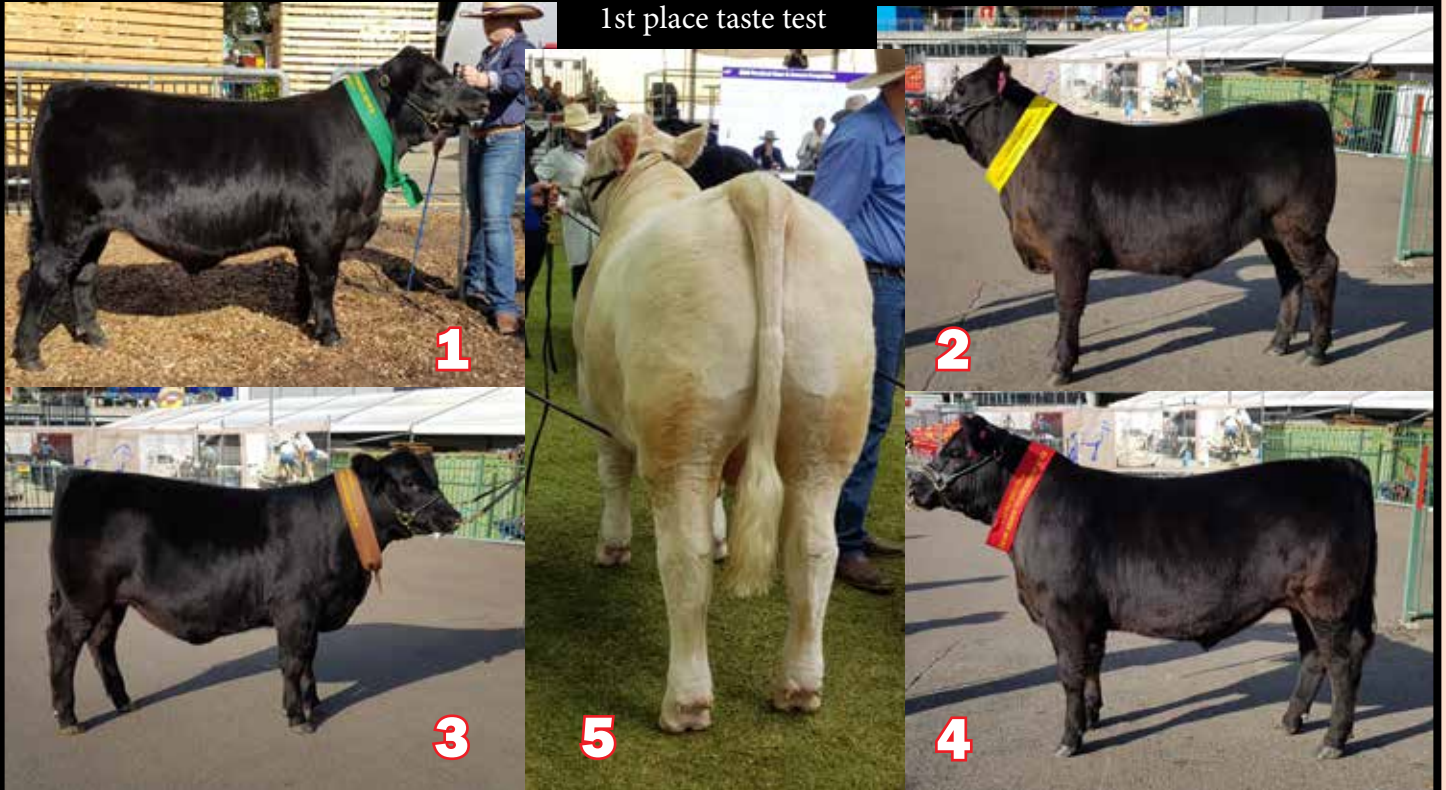
1st place taste test

Bull client success showing outstanding quality beef using DSK genetics