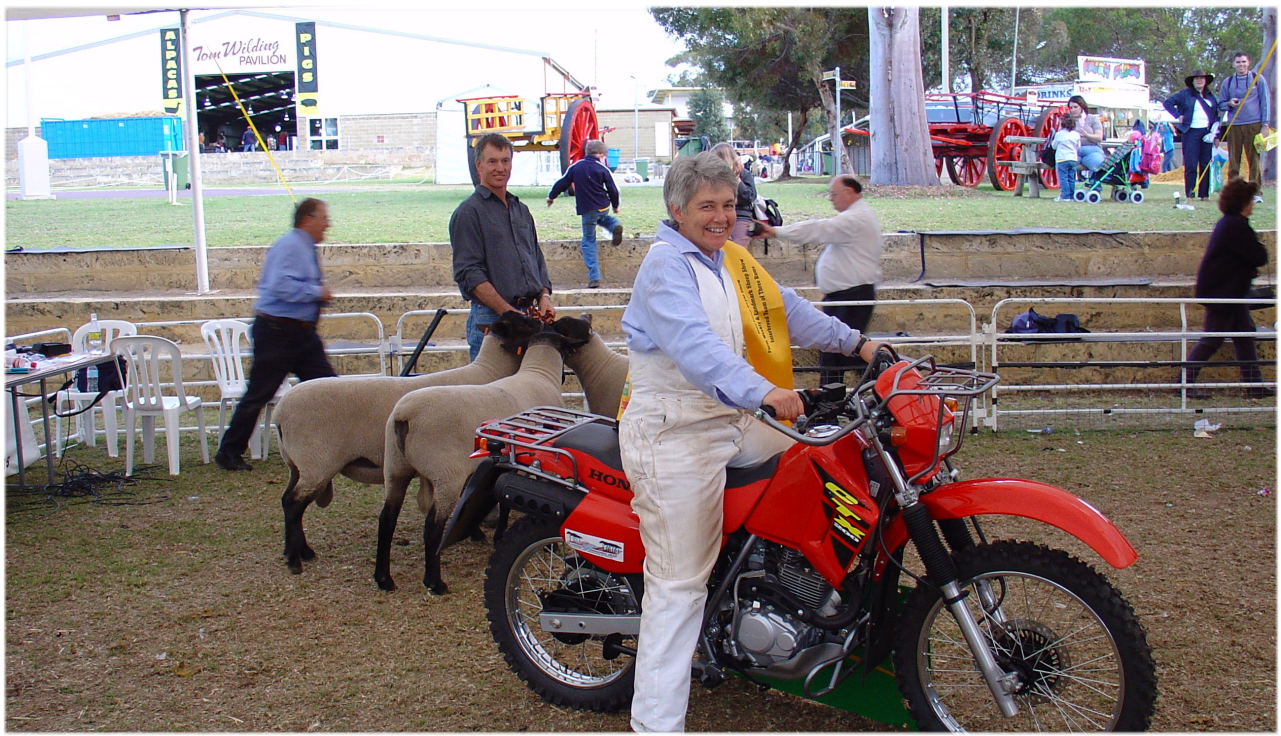
2003 Inaugural Landmark and Farm Weekly Interbreed Group 3 Rams