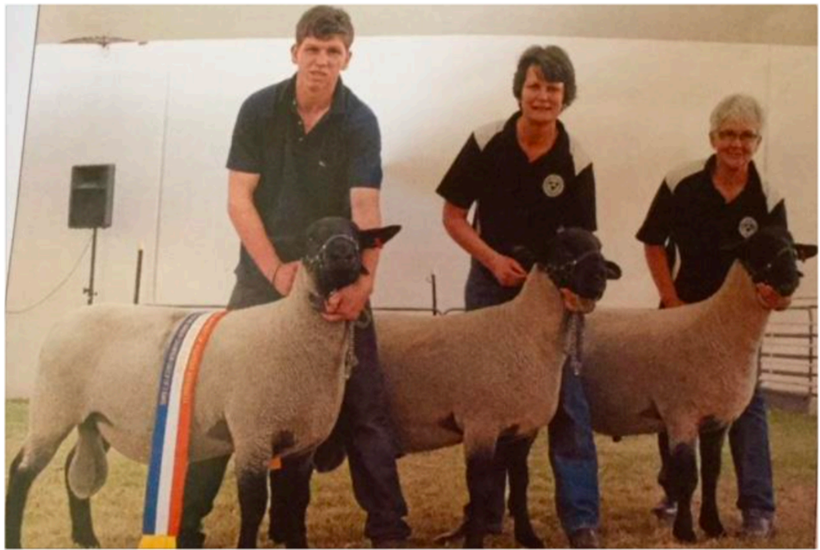
Interbreed Champion 2015 Perth Royal Show